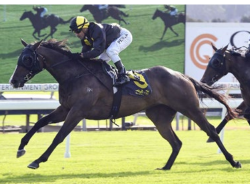
Tinkermosa (NZ) (Alamosa)