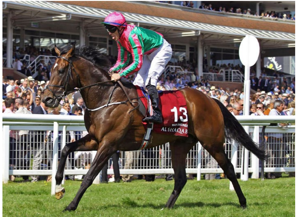
War Decree will stand at Inglewood Stud for the 2018 breeding season

"He's a horse who had a lot of natural talent and ability," O'Brien said. "He's an unusually good mover, he covers a lot of ground and barely touches it, so fast ground suited him well."