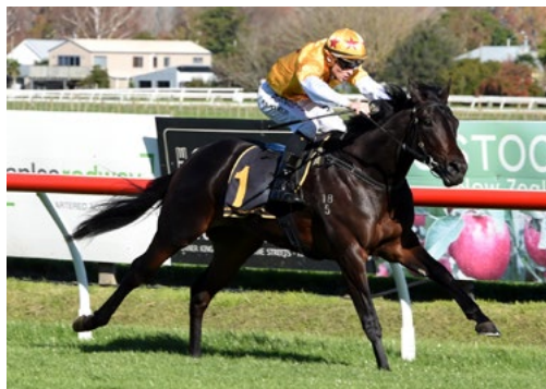
Qiji Express (NZ) (Shamexpress)

"He's the young star of the three-year-old colts. Let's see how we go towards a Queensland Derby and obviously the Grand Prix is an important step in that direction."