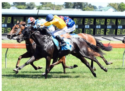
Terra Sancta (NZ) (Pierro)

Sun), out of Wellfield Lodge's 2016 draft at Karaka for $50,000.