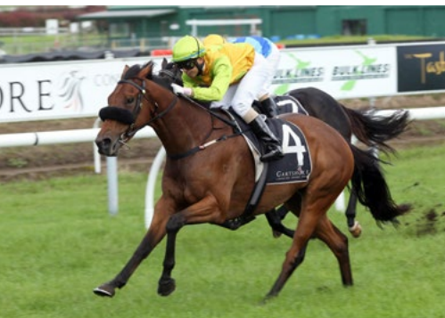
Wooden Edge (NZ) (Have No Fear)