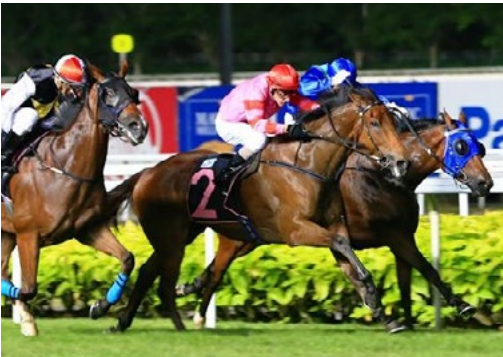
Preditor (NZ) (Savabeel)