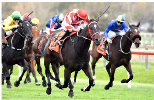
Scandalo (NZ) (Shocking)