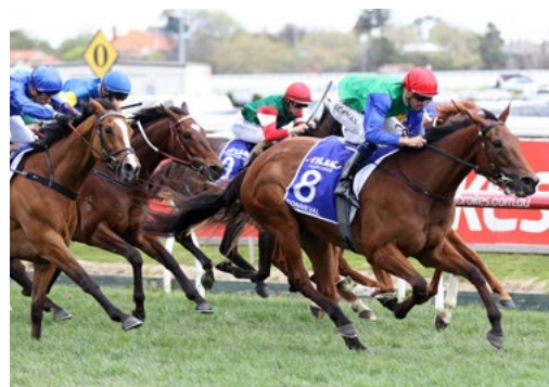
Bonneval (NZ) (Makfi)

The son of Shocking has also placed twice at Group One level in the Chelmsford Stakes (1600m) and in The Metropolitan (2400m).