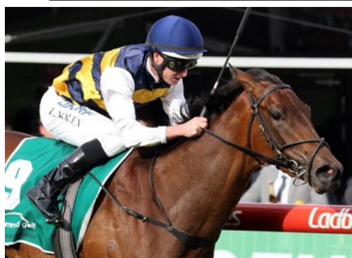
Aloisia (NZ) (Azamour)