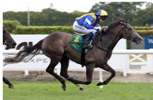
Mime (NZ) (Mastercraftsman)

"She might have a run in late June or early July, she's a good staying filly."