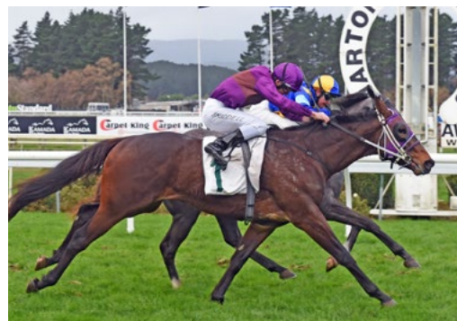
Manhattan Street (Manhattan Rain)