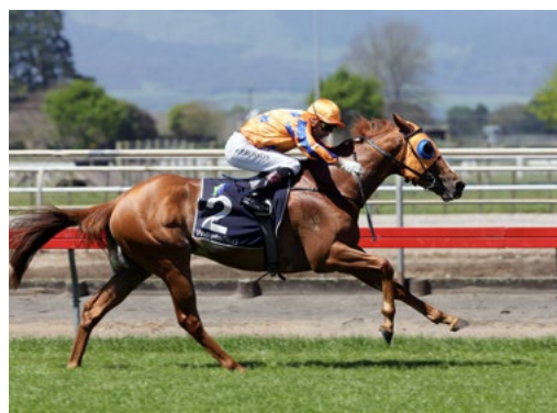
Te Akau Shark (NZ) (Rip Van Winkle)