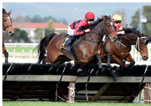
No Change (NZ) (Shinko King)