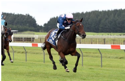
Wee Gilly (NZ) (Roc De Cambes)

Jon Snow (NZ) (Iffraaj) won the Gr.3 JRA Cup (2040m) and ran third in the Gr.1 Caulfield Stakes (2000m) before he finished less than five lengths off the winner Boom Time in the Gr.1 Caulfield Cup (2400m) at his last appearance.