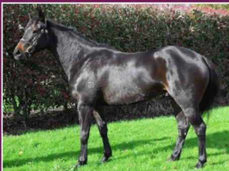
WELL-RELATED SO YOU THINK FILLY. RACE OR BREED.