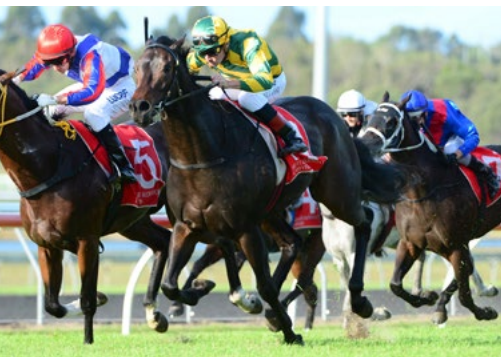
Time Lord (NZ) (Guillotine)

"It's a big test, but you've got to be in it to win it."