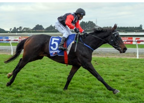
Shakti (NZ) (Duelled)

The lightly-raced six-year-old has won six of his 18 starts, all of them on slow or heavy tracks.