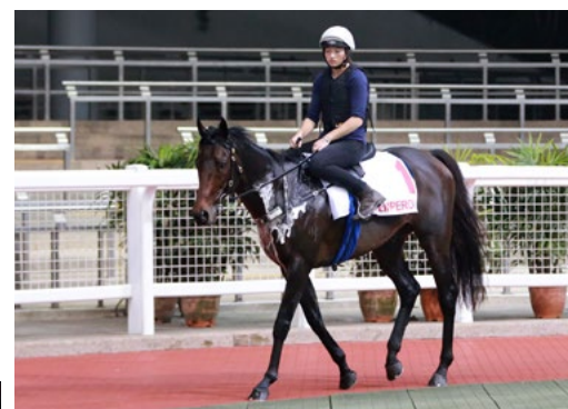
Ocean Emperor (NZ) (Zabeel)