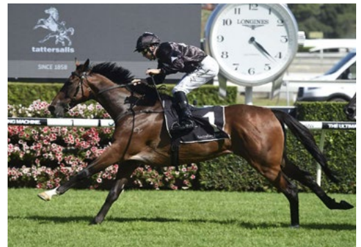
Ecuador (NZ) (High Chaparral)

A son of Windsor Park Stud stallion Shameexpress, Qiji Express is a graduate of the NZB Select Yearling Sale, where he was secured for $27,500.