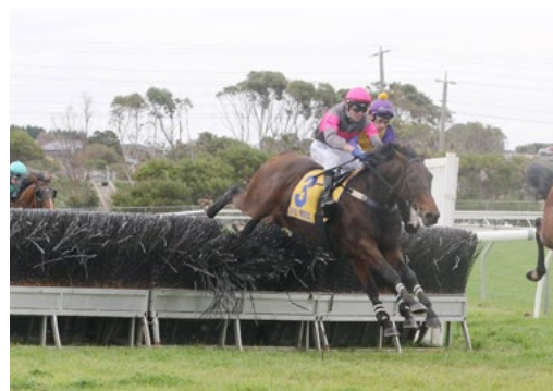
Gold Medals (NZ) (Elvstroem)

Australian Steeplechase wins and has already claimed Warrnambool's Brierly (3450m) and Grand Annual Steeplechase (5500m) at the start of May.