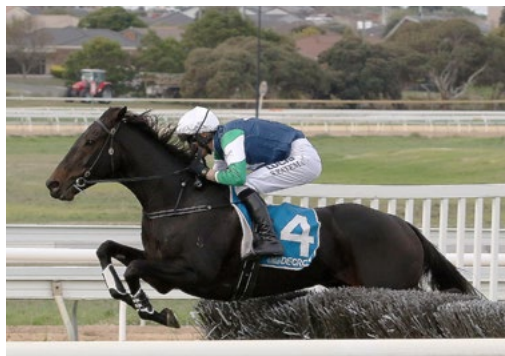
The Dominator (NZ) (The way you are)