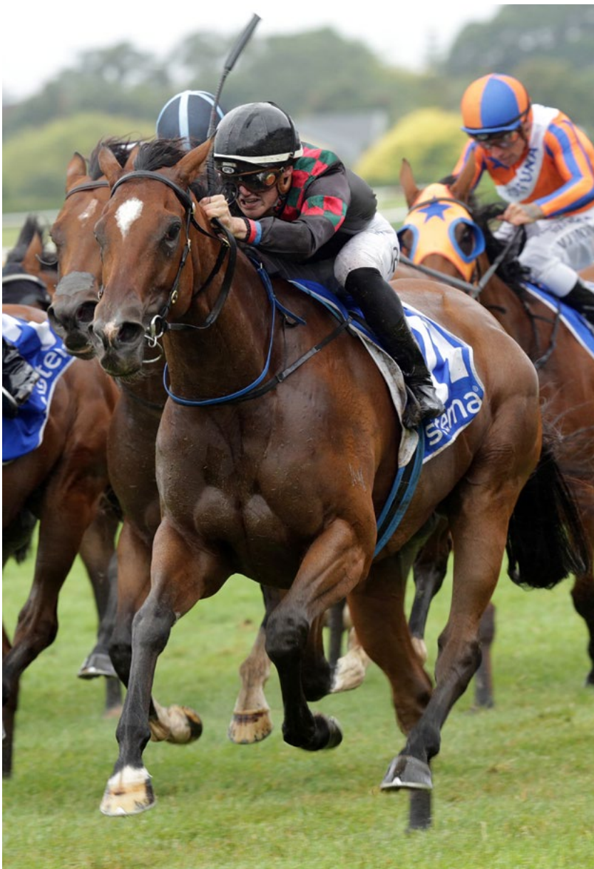
Volpe Veloce is ready to make her Australian debut in Saturday's Gr.1 Kingsford-Smith Cup at Doomben