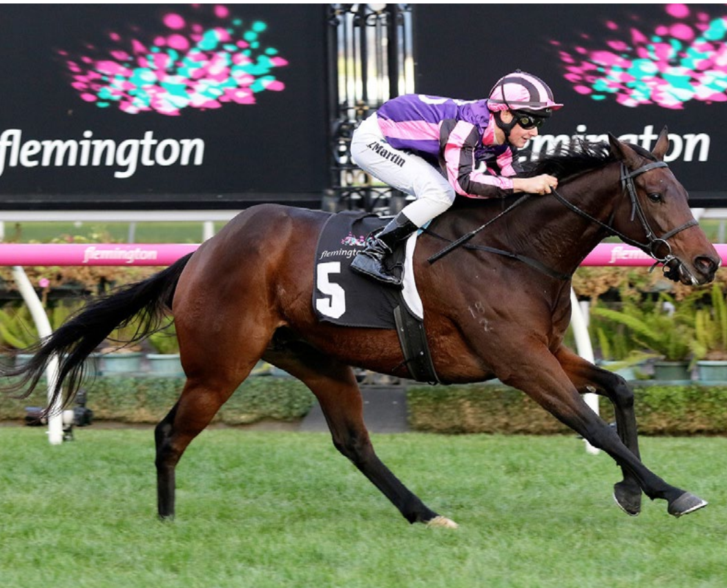
Moss 'N' Dale races to his eleventh victory