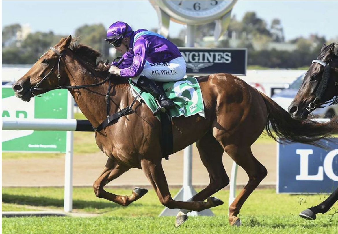
Lisdoonvarna bounces back to winning form at Rosehill

“We would like to go to Brisbane with her and just hope it rains up there.