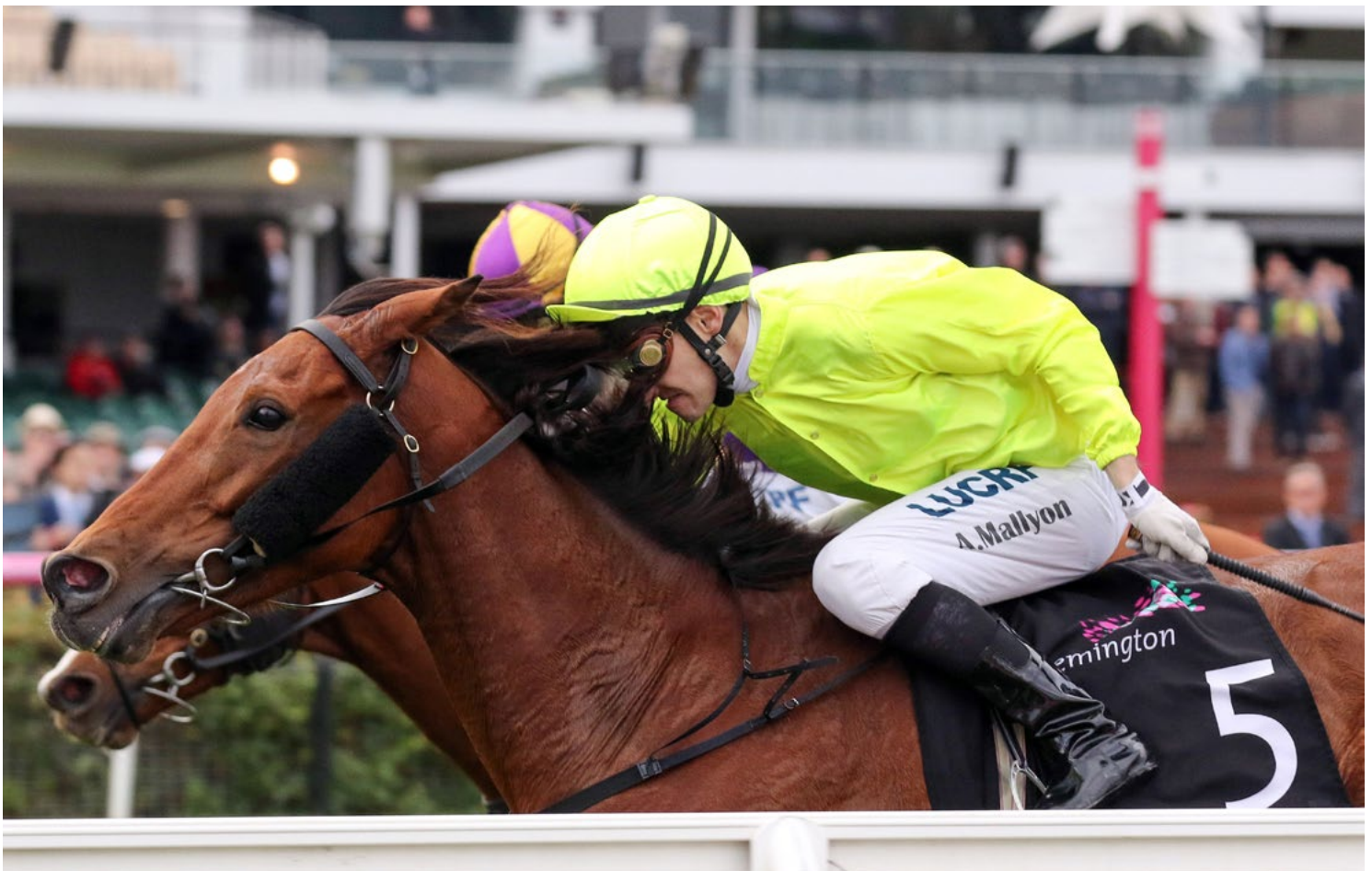
Sin to Win outstays his rivals

Former Kiwi galloper Sin To Win (NZ) (Sir Percy) put the misfortune of last start behind him when successful in the Listed Andrew Ramsden Stakes (3200m) at Flemington on Saturday.