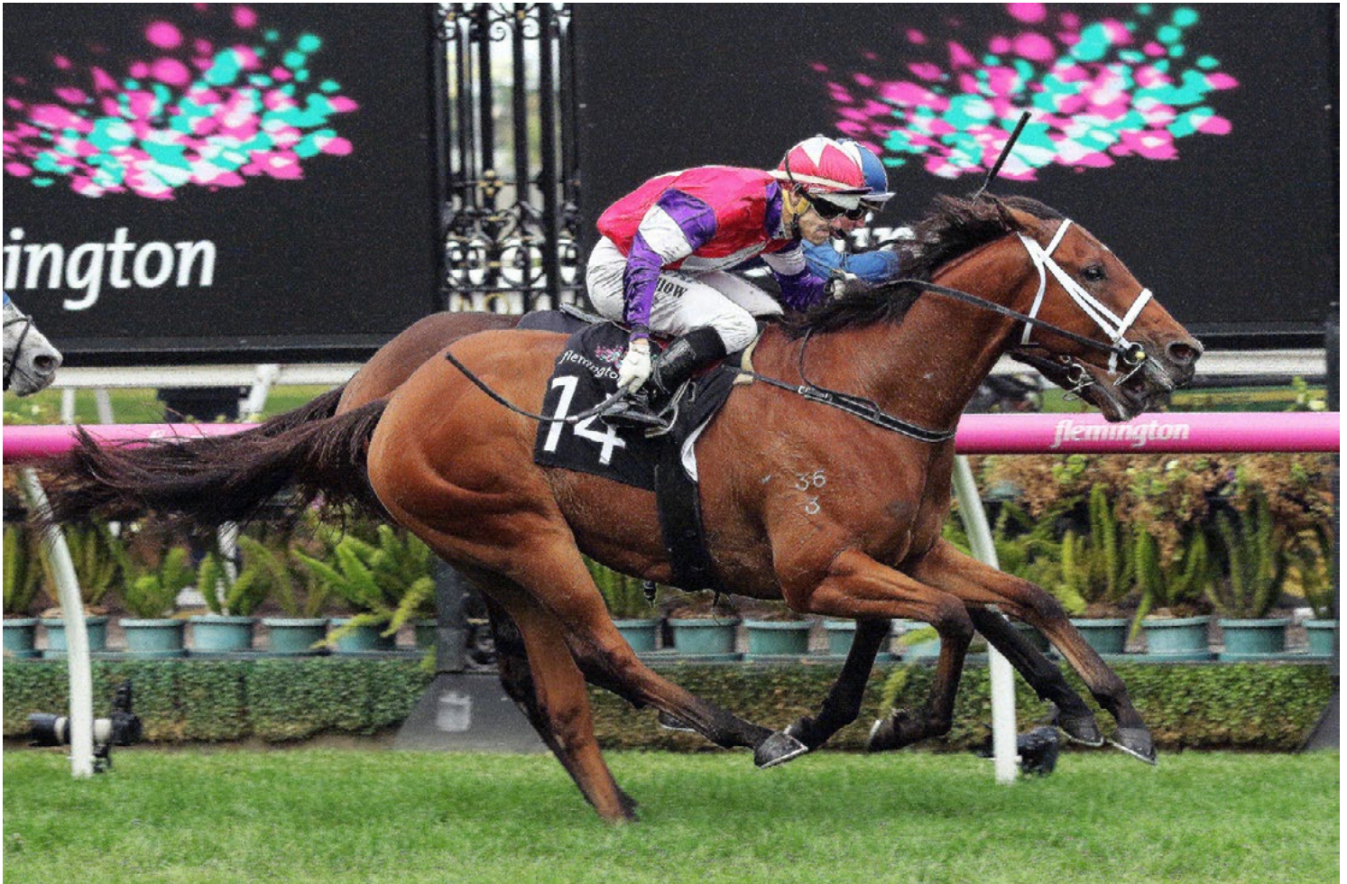
Éclair Calling edges out Boxachocolates