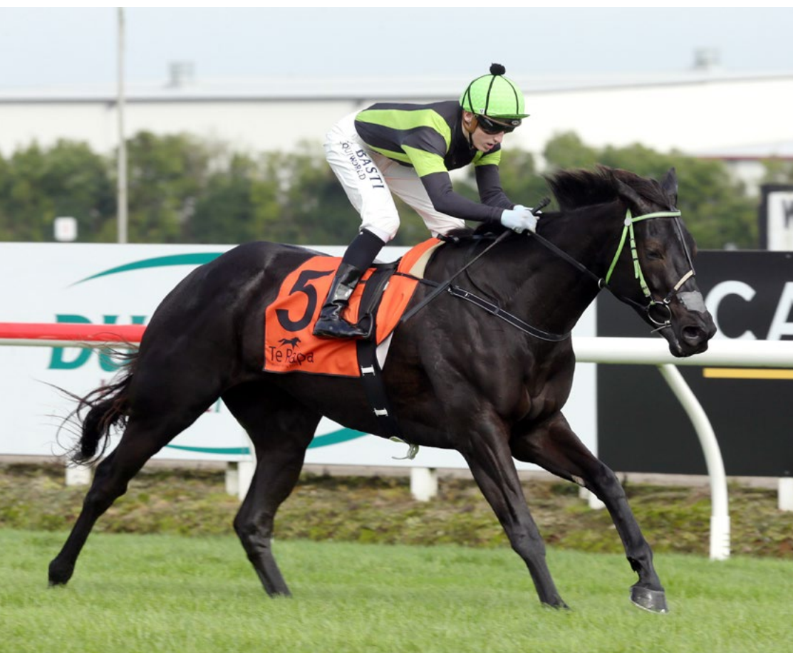
An easy victory at Te Rapa has Big Mike on target for Queensland