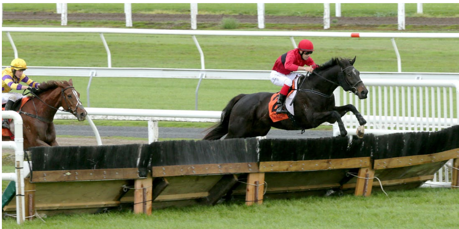
The Shackler shows his jumping style in the Te Rapa hurdle feature (Trish Dunell)