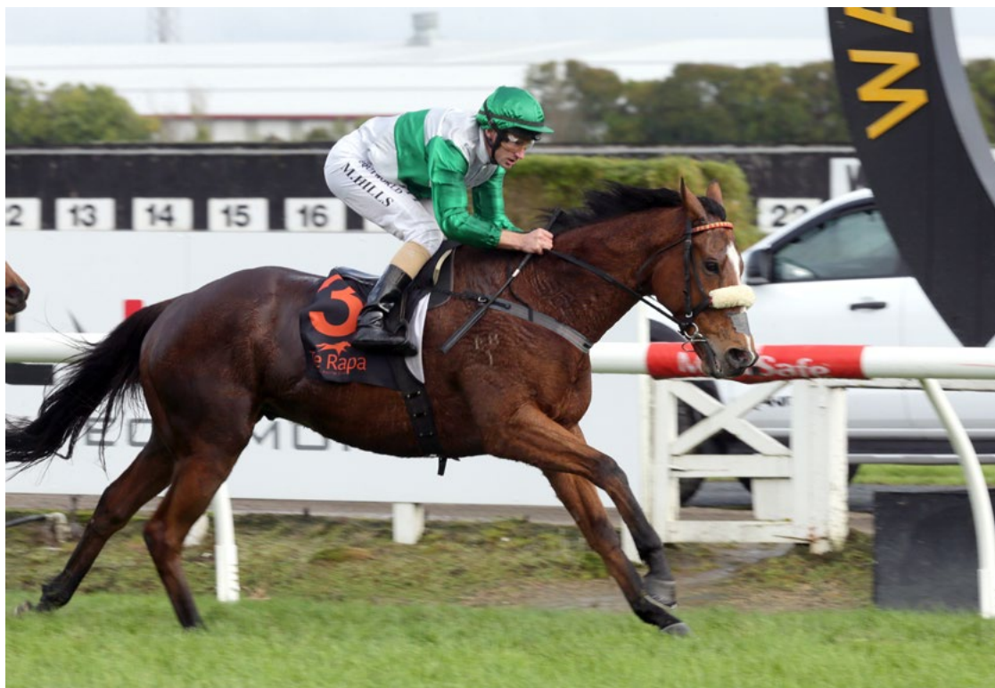
Southern Icon ran his rivals ragged in the open sprint at Te Rapa