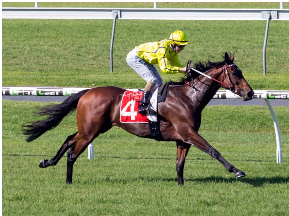
Yogi cruises to victory at Morphettville