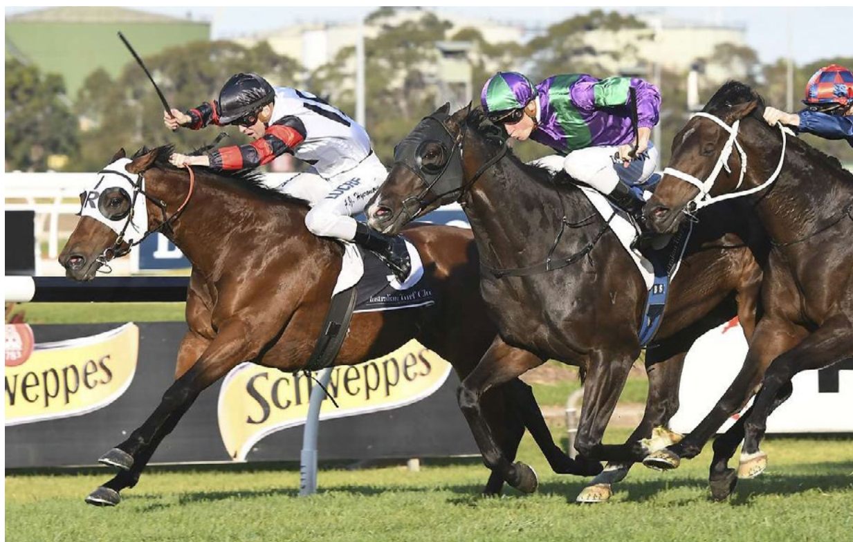
King Darci (on rail) bounces back to form at Rosehill