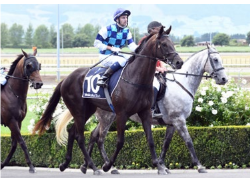
Here He Comes (Comin'through) (NZ) (Bullbars)