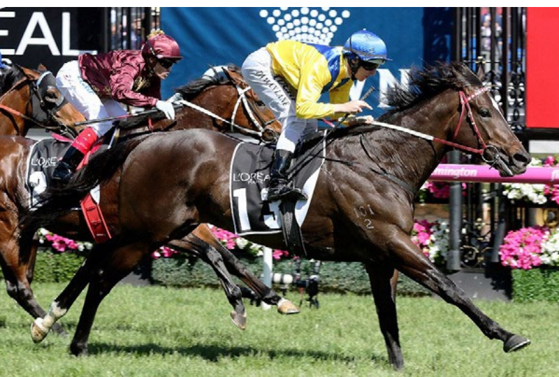
Rageese contests the Gr. 1 Goodwood at Morphettville tomorrow for master trainer Darren Weir