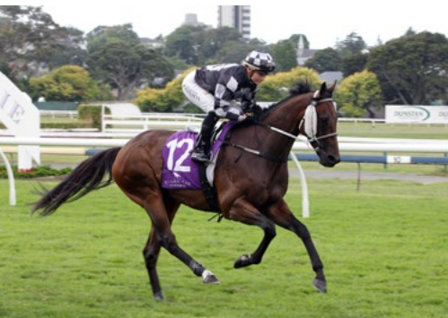
King Kamada (NZ) (Shinko King)