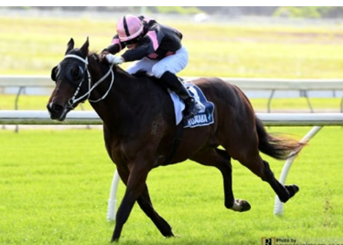
Smart Bronson (Smart Missile)

Bombard was subsequently put aside after he finished sixth at Ellerslie in January.