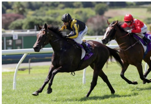
Elfee (NZ) (Iffraaj)

Flying Ibis was a winner on the course three runs back and then placed before he was out of the money in the Listed Great Easter Stakes. Full story here.