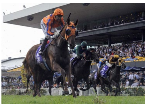
Gingernuts (NZ) (Iffraaj)