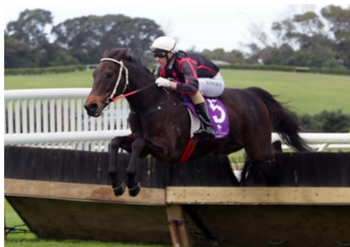
D'LLaro (NZ) (D'Cash)