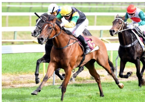
Electrode (NZ) (Pins)

Habit Plate winner Shocking Luck (NZ) (Shocking).