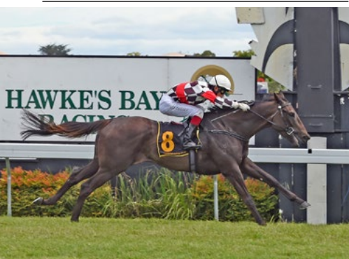
Savvy Dreams (NZ) (Savabeel)