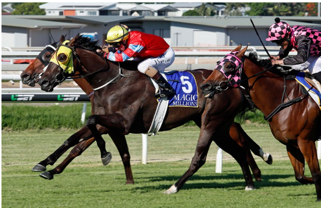
Cylinder Beach will have a large and emotional team cheering him on in the Gr. 1 Doomben Cup

Forster thinks a big plus for Cylinder Beach is jockey Jim Byrne, who takes the ride with huge confidence after winning