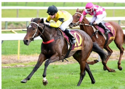
Inscription (NZ) (Cape Blanco)

"There's not a lot of her, so we will see how she comes through the run. She obviously gets through this ground alright, so we'll definitely look at black-type options with her in the coming months."