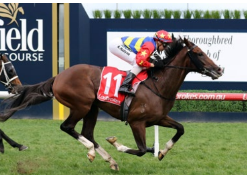
Odeon (NZ) (Zacinto)