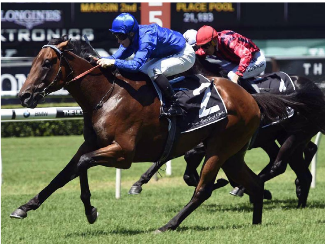
Street Cry's well-performed son Telperion has joined the stallion roster at Westbury Stud