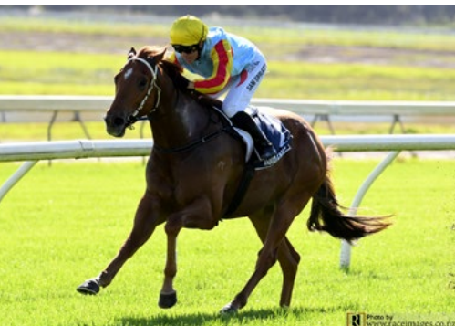
Bombard (NZ) (Dalghar)