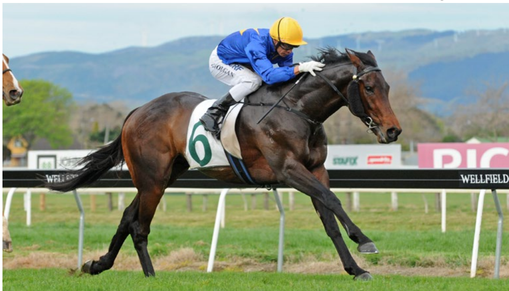
Former champion three-year-old Puccini will commence his stallion duties at Mapperley Stud this season

Next fortnightly online auction in New Zealand. ENTRIES CLOSE 7PM MONDAY 22 MAY