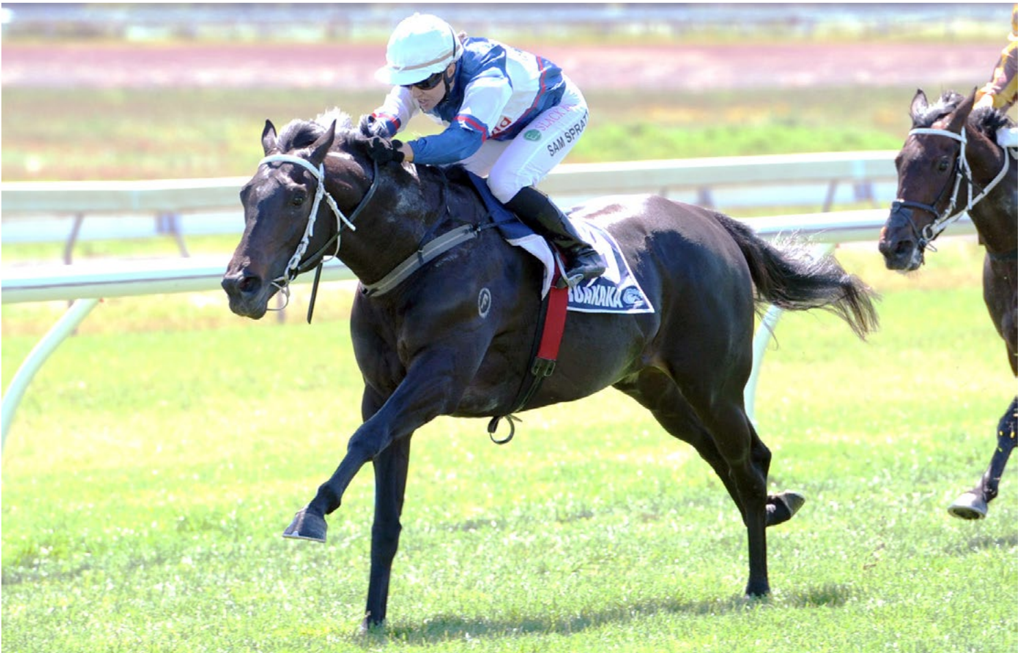
What's The Story, a Group One placed son of Savabeel, will commence stallion duties at Norwegian Park for the 2018 breeding season