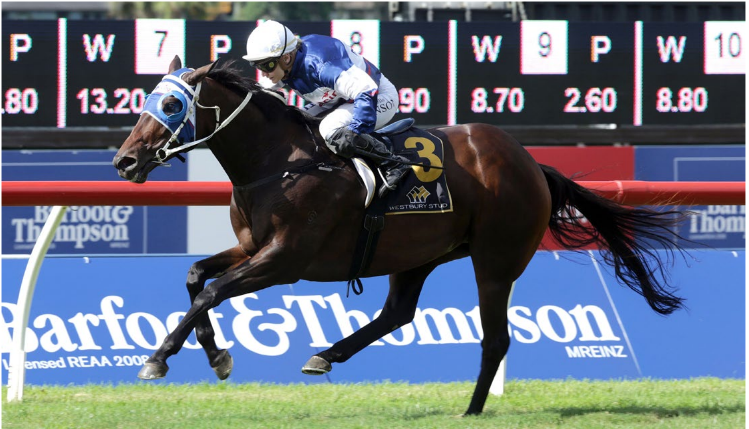
Ruud Not Too has settled in well ahead of her first Australian start at Doomben this weekend

Ruud Not Too (Bernardini) has settled in well in Queensland and will be given the opportunity to add Australian black type to her record.