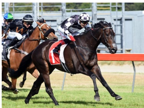
Kawi (NZ) (Savabeel)