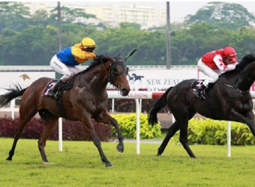
Magstock (NZ) (Tavistock)