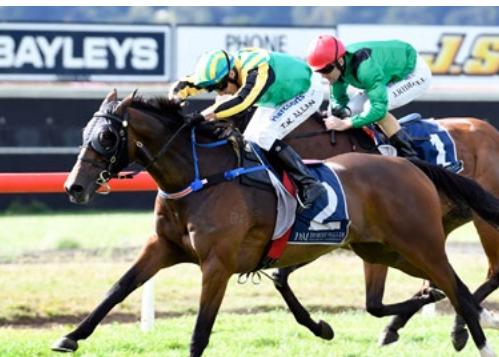
Aigne (NZ) (Sufficient)