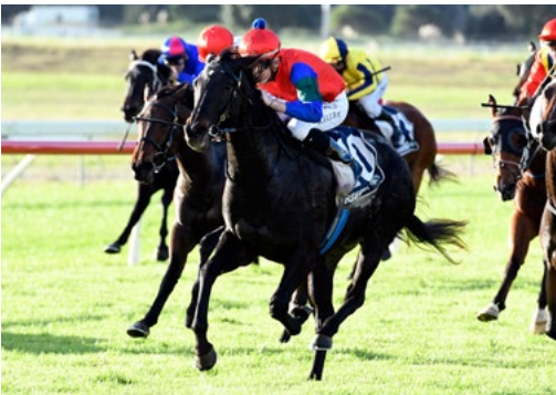
McCartney (NZ) (Alamosa)