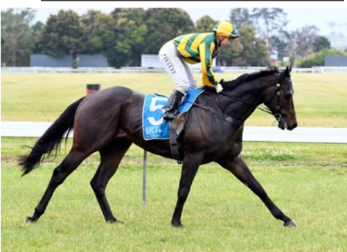
Time Lord (NZ) (Guillotine)