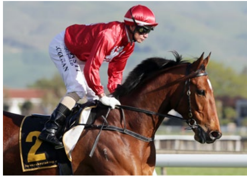
Volkstok'n'barrell (NZ) (Tavistock)