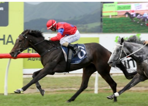
Miss Wilson (Stratum)