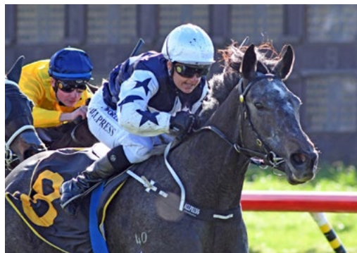
Devine Love (NZ) (Dalghar)

"She's always showed plenty of natural ability and she was good when winning her trial at Te Teko," the Cambridge horseman said. Full story here