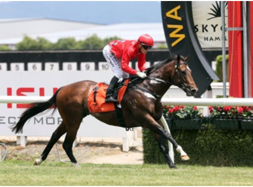
Ferrando (NZ) (Fast 'n' Famous)