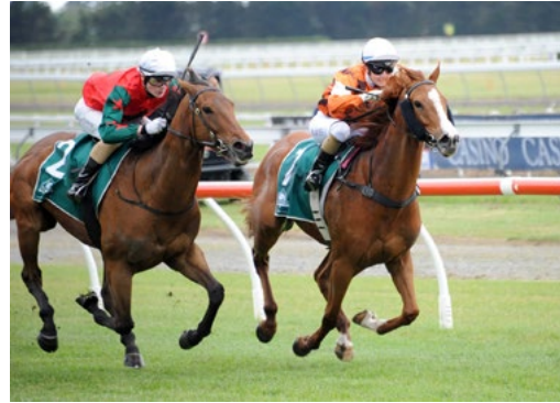
Dressedtokill (NZ) (Battle Paint)

Chequered Flag (NZ) (Raise The Flag) holds favouritism at $7.