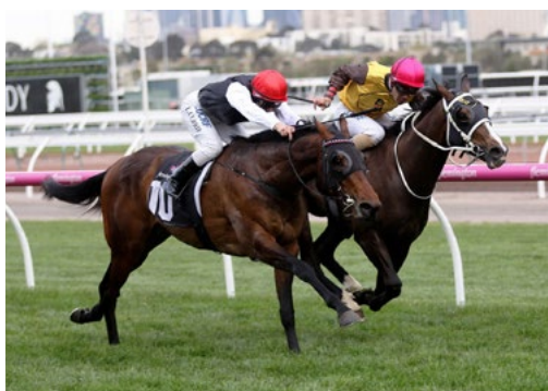
Tavistock Abbey (NZ) (Tavistock)

Kawi was side-lined by a fetlock issue in the summer while Ladies First was spelled after her courageous victory in the Gr.1 Auckland Cup (3200m), which prompted plans for a Gr.1 Melbourne Cup (3200m) campaign later this year.