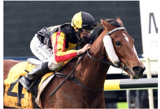
Art Deco (NZ) (Road To Rock)