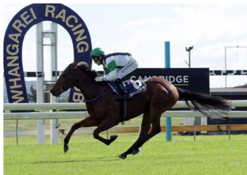
Wekaforce (NZ) (Showcasing)

Time Lord has now won two of his nine starts and booked his ticket to Brisbane when third in the Gr.2 Championship Stakes (2100m) on his home turf last month.