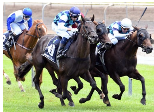
Comin'through (NZ) (Bullbars)

"He's in really good form and I've been very pleased with him. He's able to run on the pace and keep rolling along and 2000 metres will suit him on Saturday." Full story here.