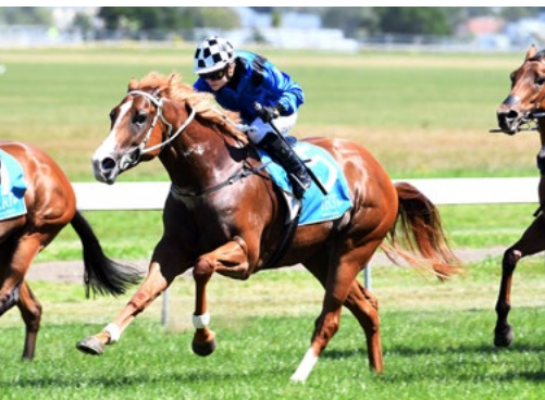
Mystery Show (NZ) (Sakhee's Secret)