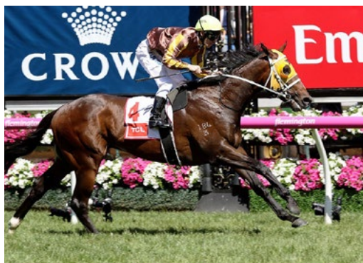
Anaheim (Fastnet Rock)

Savvy Dreams was required to trial in front of the stewards after she had flipped over before the start of last Saturday's Gr.1 Schweppes Oaks and was taken out of the race. Full story here.