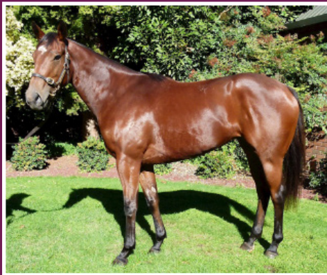
3YO FILLY BY BACHELOR DUKE. FULL TO GR.2 WINNER SINGLE MINDED.