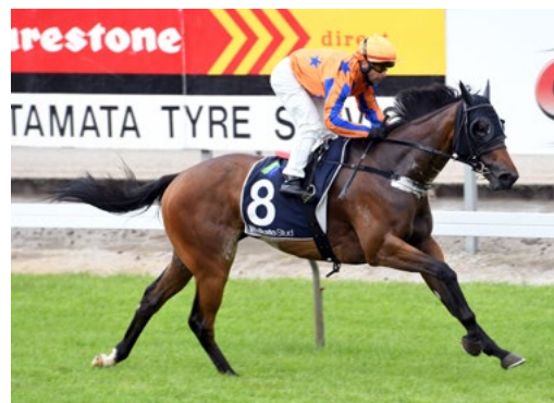
Shocking Luck (NZ) (Shocking)