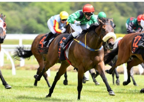
Let Her Rip (NZ) (Rip Van Winkle)

The Cambridge trainer believes the Rip Van Winkle mare performs best with her races spaced but he will produce her just two weeks after her previous start this weekend.