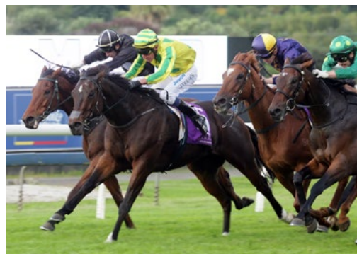
Seventh Up (NZ) (Shinko King)

"We have already had plenty of interest from what he has done this season. Hopefully he has another full book in-front of him."