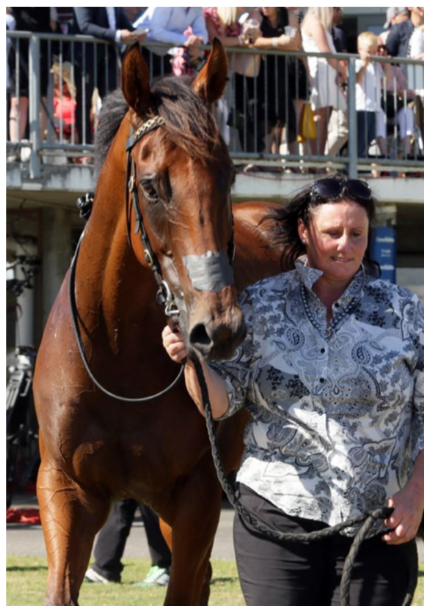
Start Wondering will look to add to an outstanding season with a victory in the Gr. 1 Doomben 10,000

Start Wondering is also likely to run in the Gr.1 Darley Kingsford Smith Cup (1300m) and could be a Stradbroke contender depending on what weight he is allotted. racenet.com.au