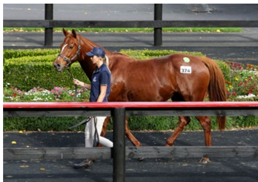
Lot 374 Fledgling