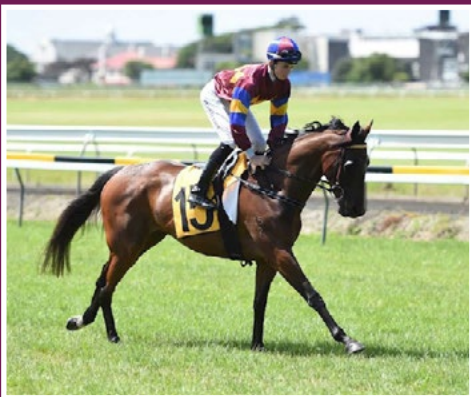
LIGHTLY RACED WINNING ENCOSTA DE LAGO MARE.

Featuring 21 Lots including young-stock, unraced and raced horses, and broodmares.