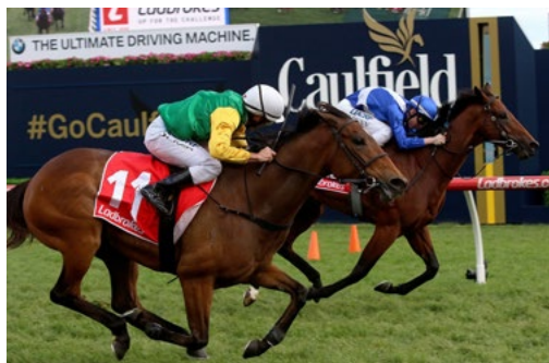
Shillelagh (NZ) (Savabeel)