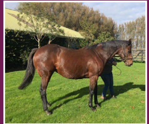
WINNING ZABEEL MARE. DAM OF TWO WINNERS.

NEXT AUCTION DATES • Accepting listings from Tuesday 16 May • Listings close 7pm Monday 22 May • Catalogue published online 5pm Tuesday 23 May • Bidding from 5pm Tuesday 23 May to close of auction on Monday 29 May • Lots close in sequential order from 7pm on Monday 29 May.