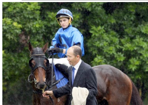
Endean Rose (NZ) (Savabeel)