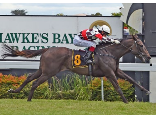
Savvy Dreams (NZ) (Savabeel)

A full brother to Group Two winning filly Volpe Veloce (Foxwedge), Raposa Rapida will make his debut in the NZB Insurance Pearl Series 1150 and has created a big impression at the trials. He has improved with each of his three trials, which included a victory over impressive debut winner Griffin (NZ) (Iffraaj). Full story here.