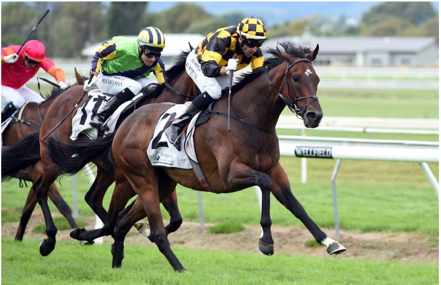
The lightly raced Sherrif tackles the Gr.1 South Australian Derby at just his fifth start tomorrow