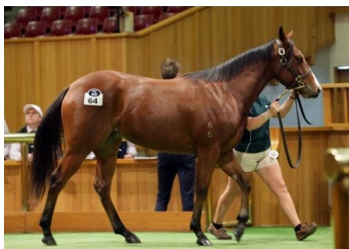
Lot 64 - Snitzel filly