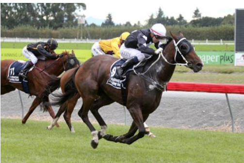
Longford (NZ) (Ceconi)