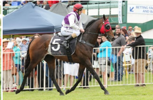
Ocean Emperor (NZ) (Zabeel)