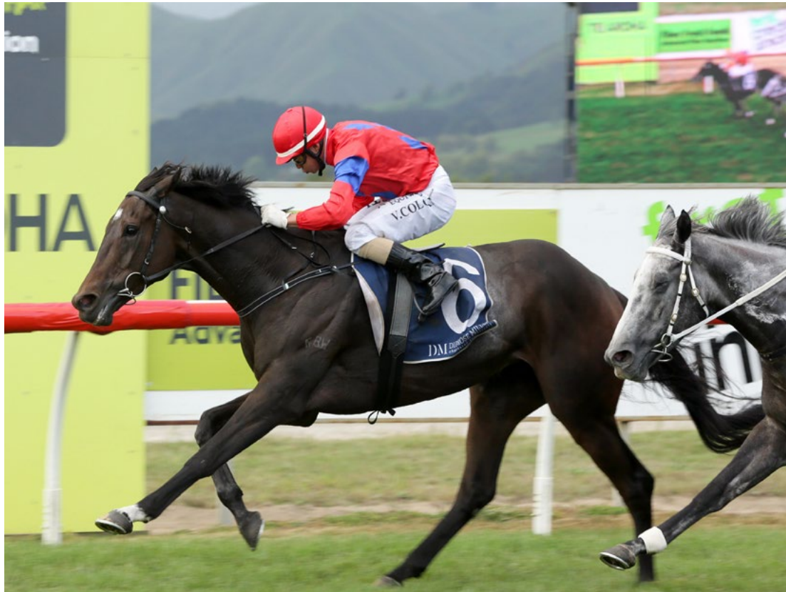
Miss Wilson is looking for a good winter surface to show her best at Rotorua on Saturday