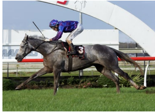
Megablast (NZ) (Shinko King)

The Pukekohe Park trainer has his versatile last-start Gr.2 Easter Handicap (1600m)