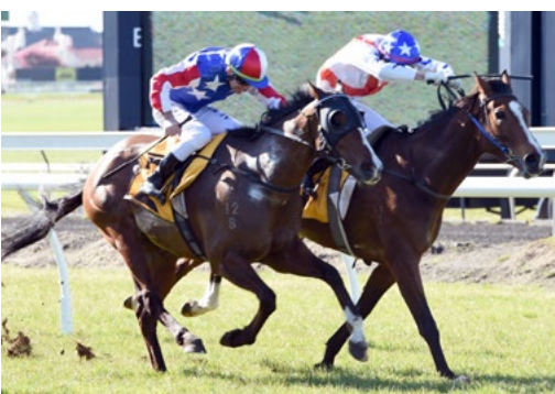
Taurus (NZ) (No Excuse Needed)