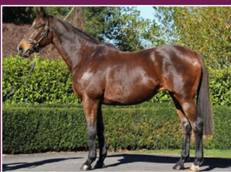
STAKES-WINNING & PRODUCING ZABEEL MARE.