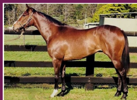
3 IN 1 LOT INCL. HIGH CHAPARRAL MARE WITH AN INTERNATIONAL PEDIGREE.