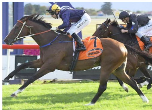
Kingsguard (NZ) (Rip Van Winkle)