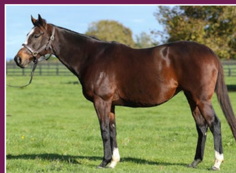
WINNING TAVISTOCK MARE IN FOAL TO PREFERMENT.