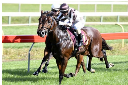
Cyber Attack (NZ) (Shamexpress)