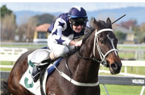
Mr Conductor (NZ) (Tickets)