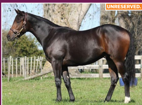
PROISIR YEARLING OUT OF STAKES PRODUCING MARE LIONSTAR.

Featuring 36 Lots including weanlings, yearlings, tried and untried racing stock and broodmares.