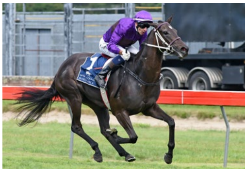
Dijon Bleu (NZ) (Burgundy)