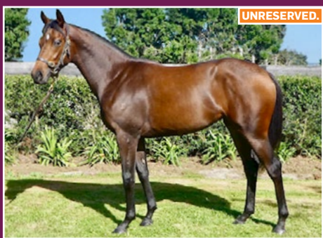
YEARLING IFFRAAJ FILLY. A HALF- SISTER TO STAKES PERFORMER NEW VISION.