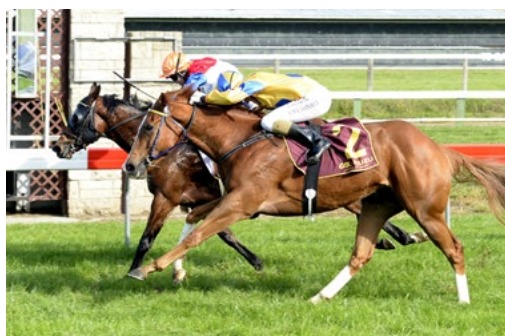
Pop Star Princess (NZ) (Makfi)

Put aside after two summer outings, the Shamexpress two-year-old resumed in fine style in Wednesday's Vilagrad Winery 1150m