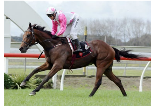
Blue Breeze (NZ) (Bullbars)

"If we can get nice and comfortable and he takes confidence from the other day I'm sure he'll run well."