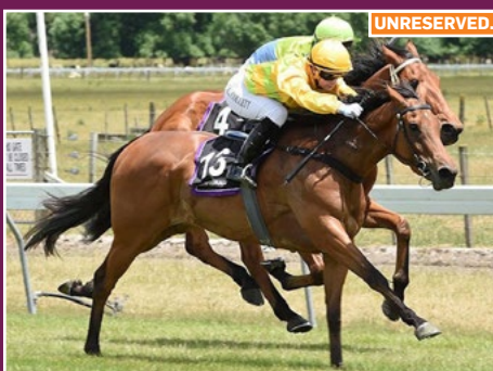
THREE-TIME WINNER BY STRAVINSKY. RACE OR BREED.