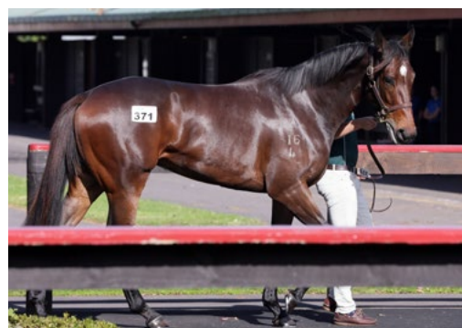
Lot 371 Mongolian Beauty