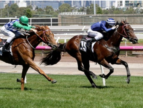
Civil Disobedience (NZ) (Raise The Flag)