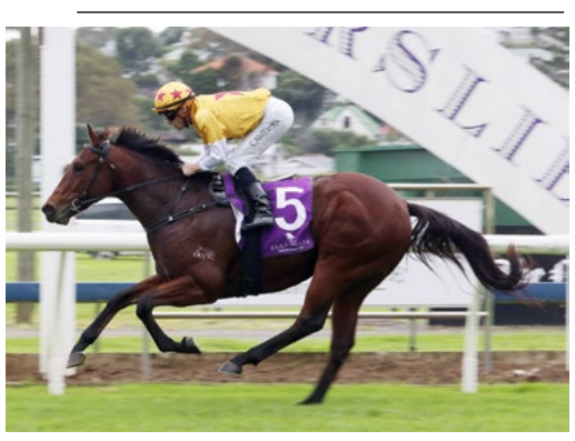
Not Usual Trip (Stryker)

Harlow Gold finished fourth last time out behind the New Zealand filly Bonneval (NZ) (Makfi) in the Gr.1 Australian Oaks.