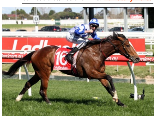
Harlow Gold (NZ) (Tavistock)

Trained by Martyn Meade, Eminent followed an easy 2 ¾-length debut win at Newmarket in maiden company with a 1 ¾-length win in the Gr.3 Craven Stakes at the same track last start over the 2000 Guineas distance of a mile. Full story here.