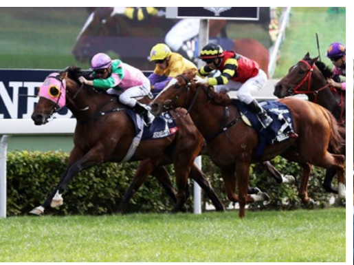
Aerovelocity (NZ) (Pins)