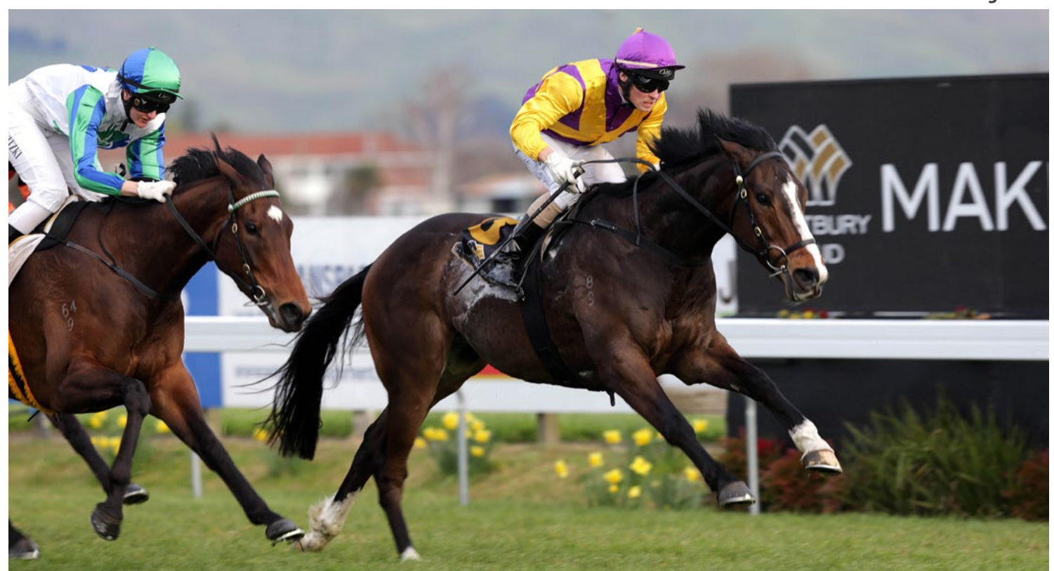
Group One winner Addictive Habit steps out at the Gold Coast this weekend after a 15 month absence from the track