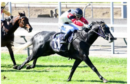
Blue Shadow (NZ) (Dalghar)

Lammas managed a winning treble taking out the NZB Insurance Pearl Series Race Rating 65 on Endean Express (NZ) (Fast 'N' Famous) and the Challenge Matamata 1600 on Tweedledee (NZ) (Zed).