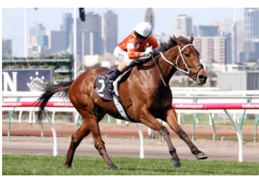
Who Shot Thebarman (NZ) (Yamanin Vital)

The durable New Zealand-bred and owned stayer has an outstanding record over the ultimate flat distance and one which he recently added to with his gallant second in the Gr.1 Sydney Cup.