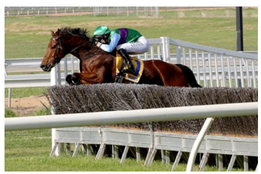
Zed Em (NZ) (Zed,

By Commands out of the dual Group One winner Katie Lee (NZ) (Pins), Legramor will be out to double her winning tally in the Topsoil & Sand Supplies 1200 tomorrow after breaking her maiden at her second start.