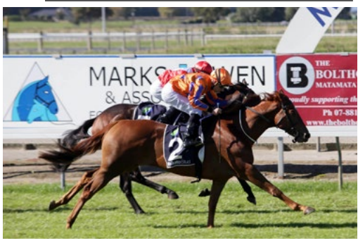
Griffin (NZ) (Iffraaj)

The Payne-Myers combination looked set to figure in yesterday's Grand Annual finish when Slowpoke Rodriguez (NZ) (Istidaad) loomed ominously before parting ways with rider Shaun Fannin at the last.