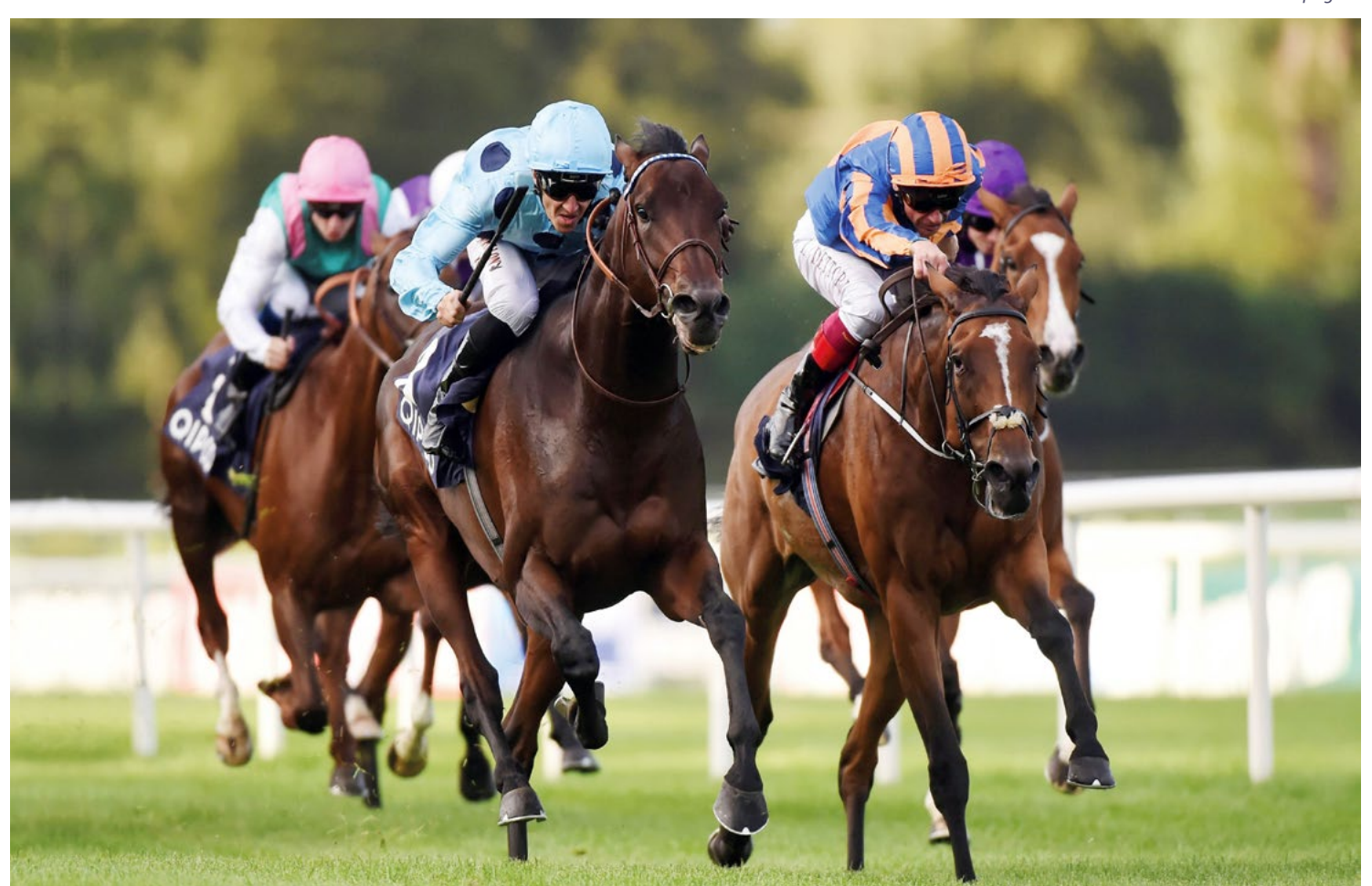
Multiple European Group One winner Almanzor will commence stallion duties at Cambridge Stud in 2018