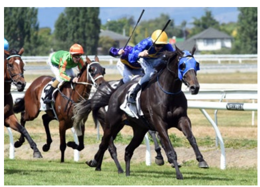
Clarify (NZ) (Savabeel)

The Group One performer has suffered a tendon injury and will return home immediately.