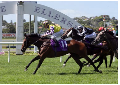
Sacred Master (NZ) (Mastercraftsman)

"I hadn't expected this race to come up such a strong race. We've taken weight off his back and we'll try and give him some confidence. He's an older horse now and he's better with the sting out of the ground. We'll just take each race as it comes with him this preparation."