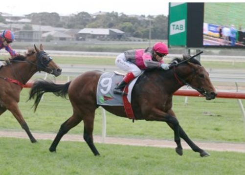
Tee Train (Savabeel)

grading system as well as possible, but I'll jump her up and see if we can get to a nice race as soon as possible."