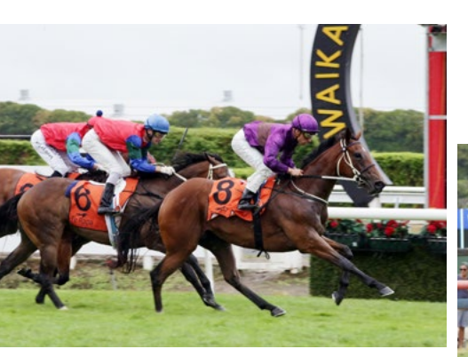
Secret Allure (NZ) (Zacinto)