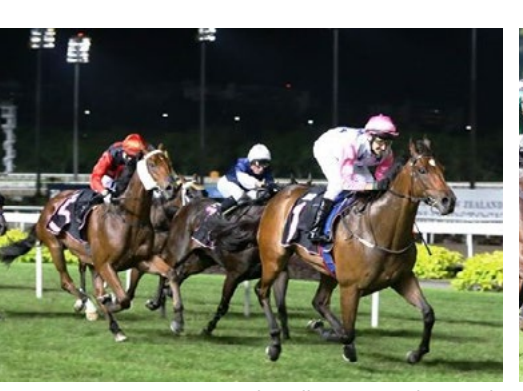
Debt Collector (NZ) (Thorn Park)