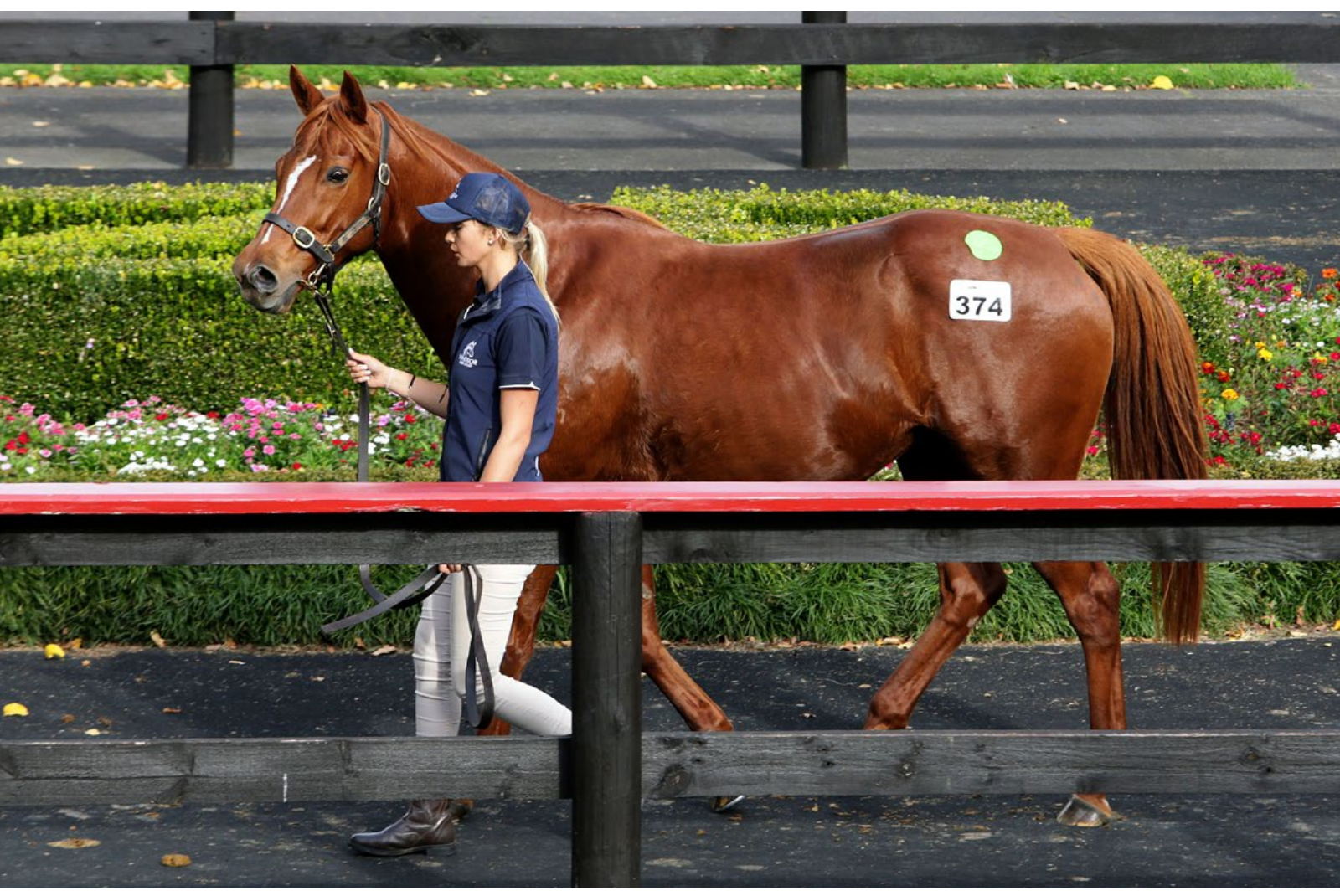
Lot 374 from the 2017 Sale – The broodmare Fledgling who topped her section of the Sale when knocked down for $87,500

ire power, impeccable female bloodlines and the enviable reputation of the New Zealand thoroughbred's performance on the track are set to combine in New Zealand Bloodstock's Karaka May Sale which commences on Monday, May 7.