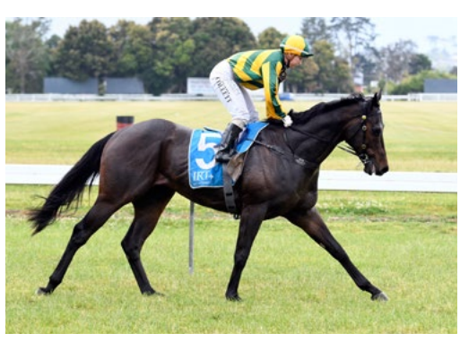
Time Lord (NZ) (Guillotine)

"He'll run in the Rough Habit Plate on Saturday week and, all going well, the Grand Prix Stakes and then into the Queensland Derby.