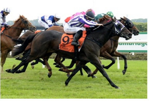
Fawn (NZ) (Savabeel)