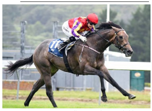
Belle Du Nord (NZ) (Reliable Man)

The association has had black type success in the past with No Tricks, also by Savabeel, winning the Listed Daybreak Lover (1800m) at the Gold Coast a couple of seasons back.