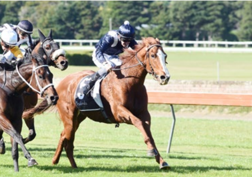
Rayas (NZ) (Rip Van Winkle)

She finished runner-up in last season's Gr.3 Wellington Stakes (1600m) and next month's Gr.3 ISCL Rotorua Stakes (1400m) is now the likely target for the daughter of Rip