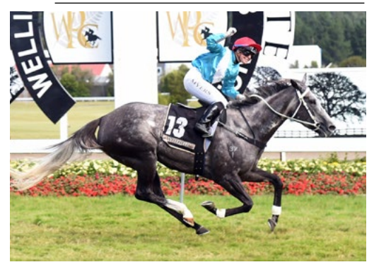
Thee Auld Floozie (NZ) (Mastercraftsman)

Plans for Azaboy have yet to be confirmed, although a spell is likely for the son of Azamour.