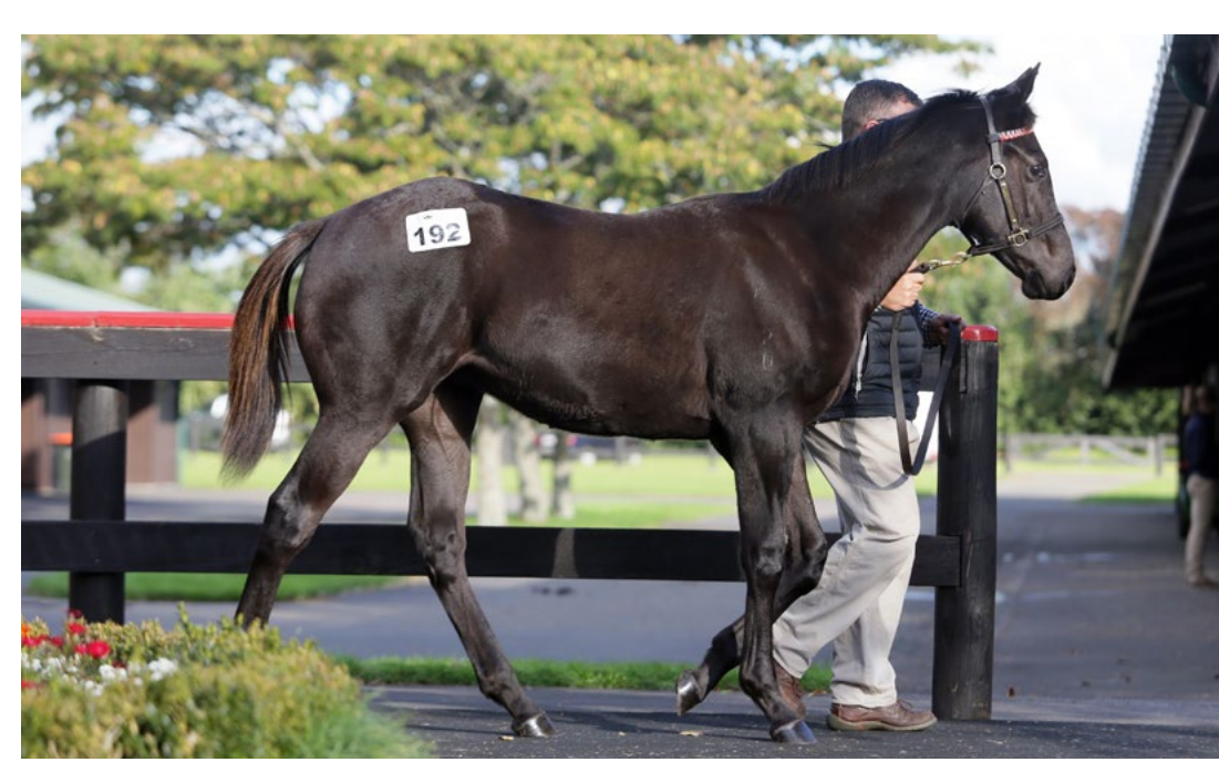
Lot 192 from 2017 – The Proisir – Nancho Bella weanling colt from the Haunui Farm draft sold for $65,000

Cunningham believes the catalogue is receiving better