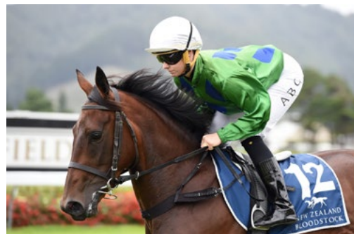
Aloisia (NZ) (Azamour)

Other prizes on the day, from a host of generous sponsors, include vouchers for a lunch at Mills Reef Winery, Mills Reef Wines, Fibre Fresh products, and Gavelhouse goodies.