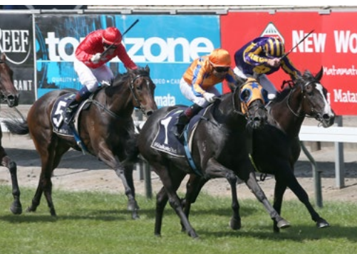
Gold Fever (NZ) (Savabeel)

Lago) are all in top order for Awapuni, according to co-trainer Stephen Autridge.