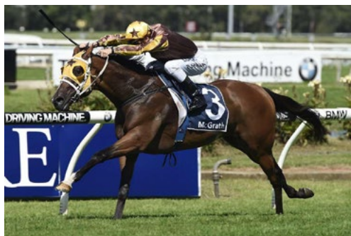
Tavago (NZ) (Tavistock)

in addition to Te Akau's four runners in the Gr.1 Courtesy Ford Manawatu Sires' Produce Stakes.