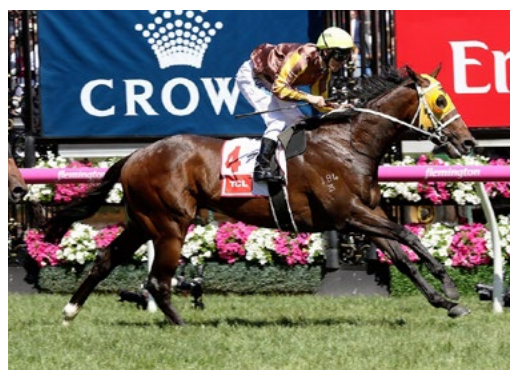
Anaheim (NZ) (Fastnet Rock)

"She'll just bounce and travel where she's comfortable and she'll quicken up and finish off strong, which will give her a chance to run in the money."