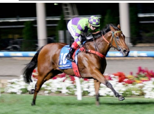
I Am A Star (NZ) (I Am Invincible)