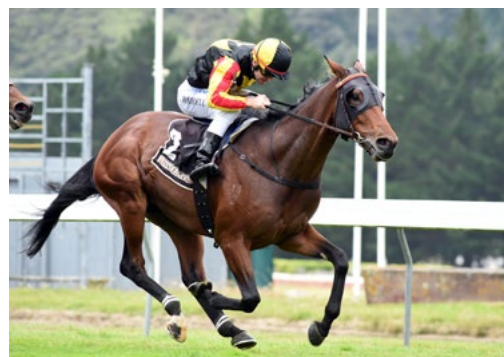
Rock On (NZ) (Road To Rock)