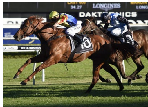
Spieth (NZ) (Thorn Park)