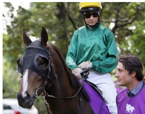
Benzini (Tale Of The Cat)

The dream long-term goal for Rock On is the Melbourne spring carnival.