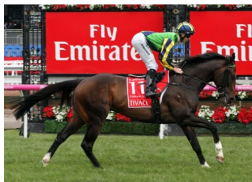
Tivaci (High Chaparral)