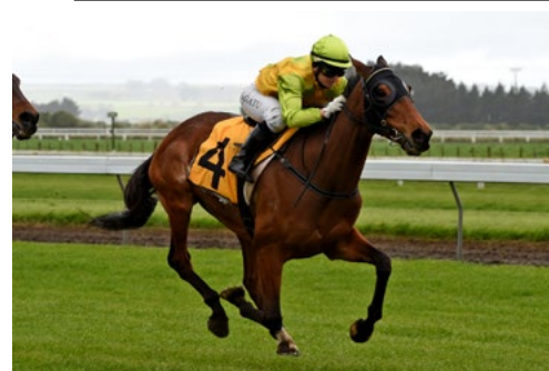
Pacorus (NZ) (Tavistock)

By Azamour out of the Group performer Queen Bourdicca (NZ) (Perfectly Ready), Aloisia finished fifth on debut before she rattled home to finish second at Trentham behind Gr.1 Courtesy Ford Manawatu Sires' Produce Stakes contender Belle du Nord (NZ) (Reliable Man).