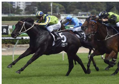
Dal Cielo (NZ) (Per Incanto)