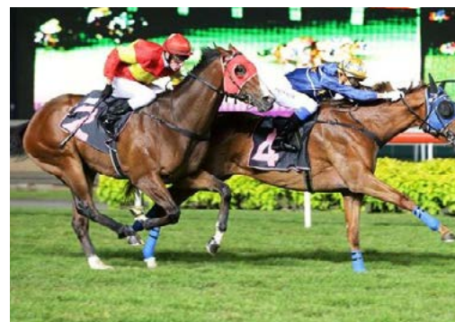
Be Bee (NZ) (Showcasing)

"I've been working him in the last two weeks, and I galloped him last Thursday. He is a very nice horse who does what he has to do," he said.