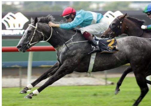
Thee Auld Floopie (NZ) (Mastercraftsman)

Stablemates Thee Auld Floopie (NZ) (Mastercraftsman) and Ruud Not Too