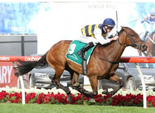
Aloisia (NZ) (Azamour)