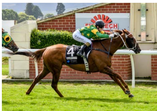
Coulee (NZ) (Gallant Guru)