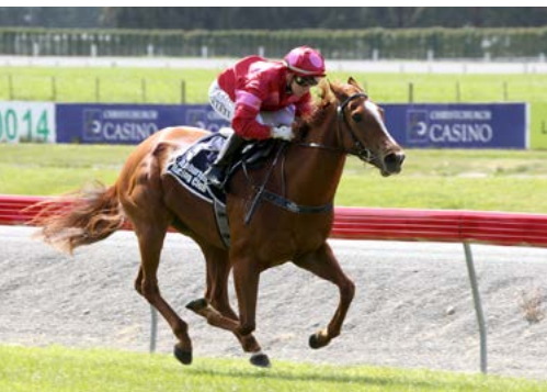
Prom Queen (NZ) (Super Easy)