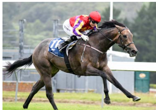
Belle Du Nord (NZ) (Reliable Man)

Belle du Nord (NZ) (Reliable Man) has headed to Australia with fresh legs for a