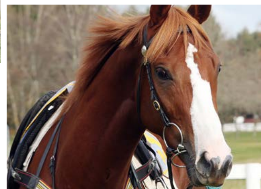
Bel Ragazzo (Helmet)