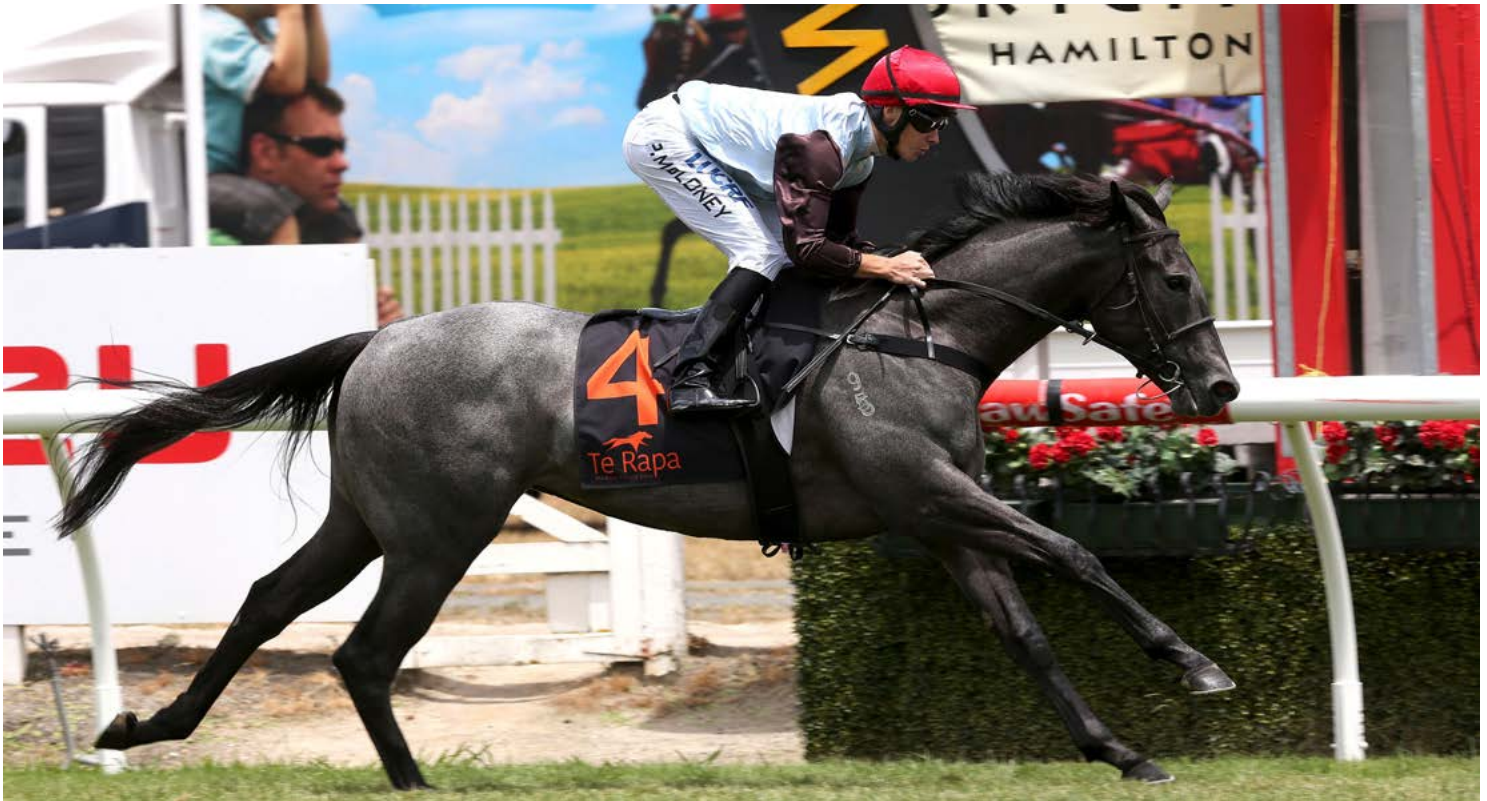
She's A Thief is a strong contender for Saturday's Gr.1 Courtesy Ford Manawatu Sires' Produce Stakes

The prospect of a step up in distance on a rain-affected track at Awapuni isn't expected to bother stablemates She's A Thief (NZ) (Showcasing) and Bocce (Foxwedge) on Saturday.