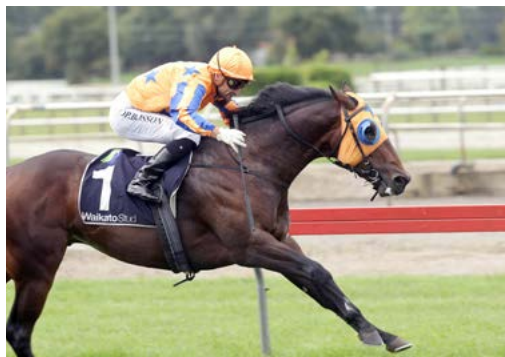
Byzantine (NZ) (Savabeel)

"The 1200m is a bit short for Best Tothelign, he prefers 1400m to a mile. But if they go along, he can finish in the first four with a bit of luck," Baertschiger said.