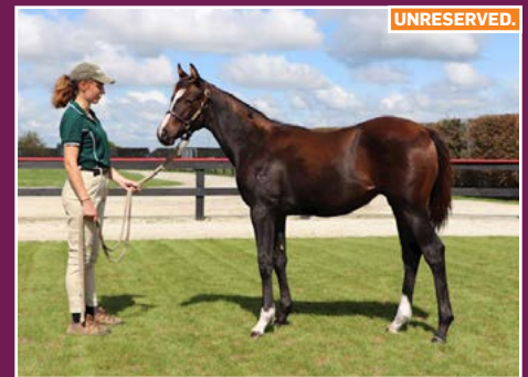
SHOWCASING FILLY FROM THE FAMILY OF CULMINATE, CAPTIVATE ET AL.