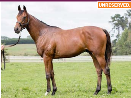
SUPER EASY COLT OUT OF A WINNING FLYING SPUR MARE.