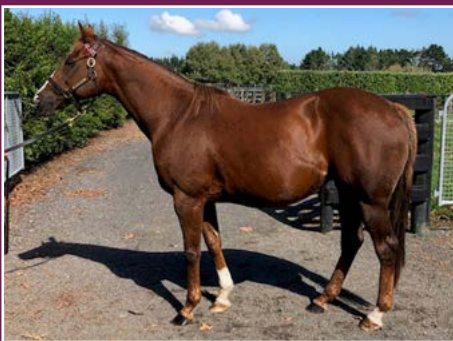
STAKES-PLACED AMERICAN MARE IN FOAL TO RELIABLE MAN.