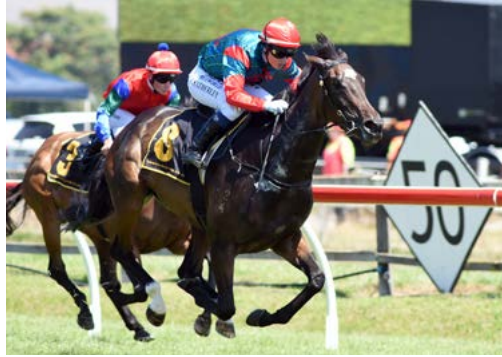
Milseain (NZ) (Tavistock)