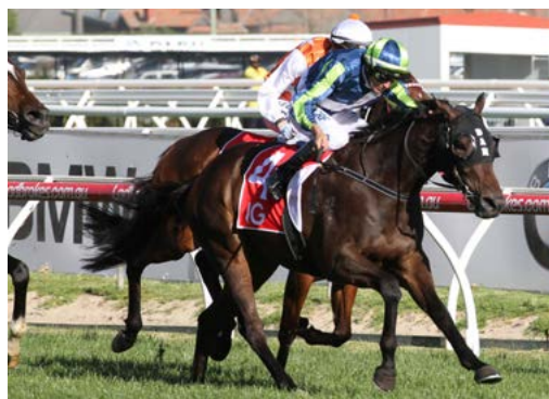
He's Our Rokkii (NZ) (Roc De Cambes)

Mongolian Marshall has won his last two starts at Avondale and Ellerslie while Weather With You finished fifth over a mile at Warwick Farm at his most recent outing.