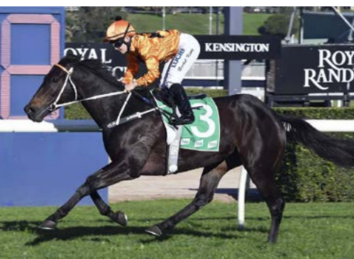
Sound Proposition (NZ) (Savabeel)

"[Barrier] 14 wasn't the number I wanted to see, but she's a horse who likes to race amongst horses competitively so there are options as to where we end up, we'll have to let Mark [Zahra] work that out."