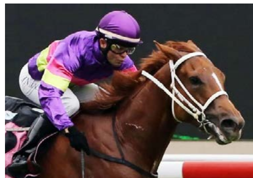
Yabadabadoo (NZ) (Makfi)