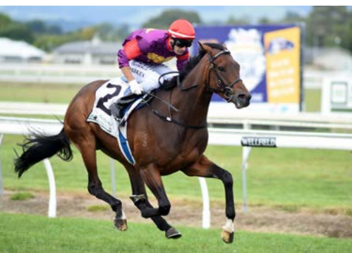
Darscape Princess (NZ) (Darci Brahma)

"After that we'll decide whether she goes to Brisbane. We need to make sure she's on target for a trip." Full story here