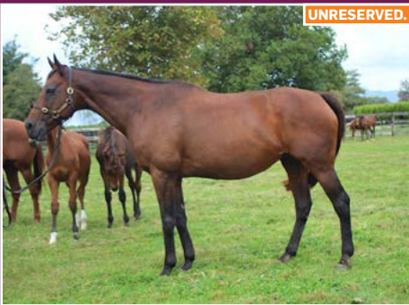
3 IN 1 LOT - ZABEEL MARE IN FOAL TO MONGOLIAN KHAN.

Featuring 86 Lots including weanlings, yearlings, racing stock, broodmares, the Gr.1 producing stallion Rios and a share in Reliable Man.