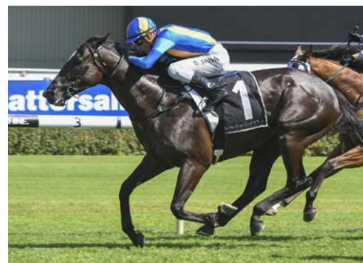
Music Magnate (NZ) (Written Tycoon)

"One thing I would say is that he's probably needed a couple of runs now that's he's got older."