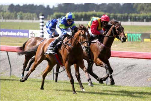
Larrikin (NZ) (Raise The Flag)