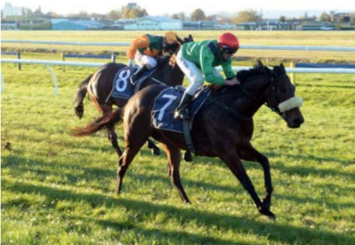
Let Her Rip (NZ) (Rip Van Winkle)

"He copped all the interference available, but he learned a lot so we'll see what happens on the weekend."