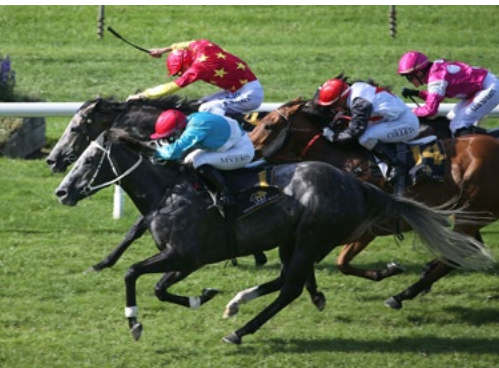
Thee Auld Floozie (NZ) (Mastercraftsman)