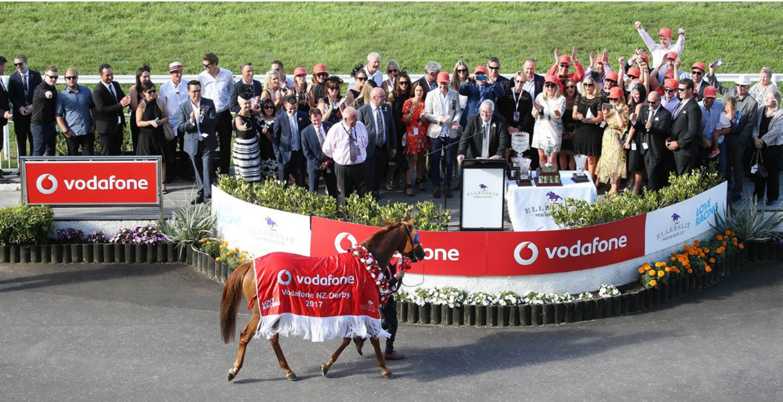
Gingernuts parades while his huge support crew celebrates during the presentation ceremony for the Vodafone New Zealand Derby

Another chapter will be added to a remarkable story when 2017 New Zealand Derby winner Gingernuts (NZ) (Iffraaj) tackles the Gr.1 Rosehill Guineas in Sydney this weekend.