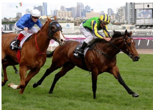
Saracino (NZ) (Per Incanto)

"He jumped out better, but he wandered around a bit so he'll have the blinkers back on to keep him a bit more focussed," he said.