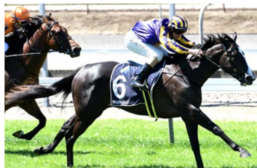
Joyfilly (NZ) (Highly Recommended)

"We'd like to get him into a race like the Easter, although he'd have to win another one between now and then."