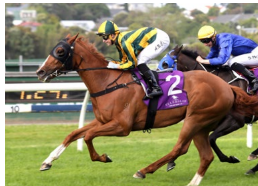
Top Prospect (NZ) (Swiss Ace)