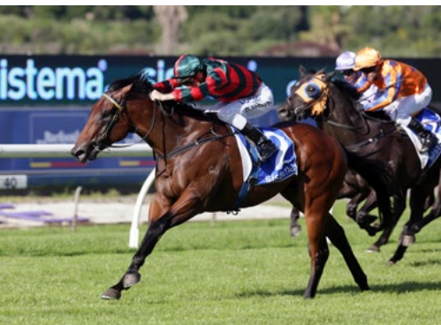
Summer Passage (Snitzel)