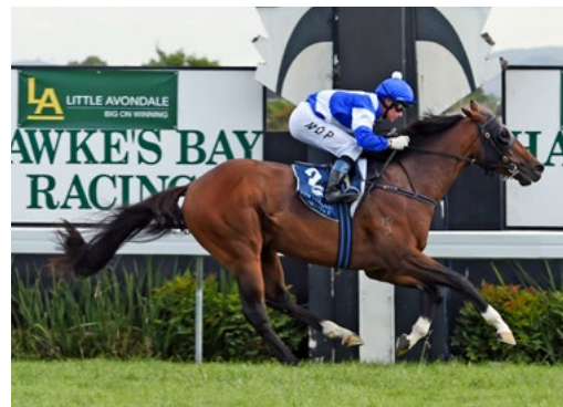
Cut Me Loose (NZ) (Swiss Ace)