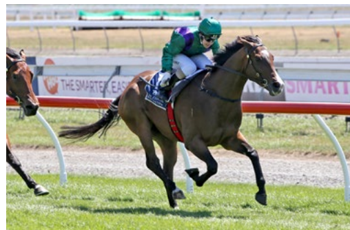
Don Carlo (NZ) (Per Incanto)