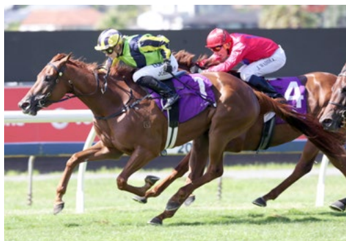
Eleonora (NZ) (Makfi)