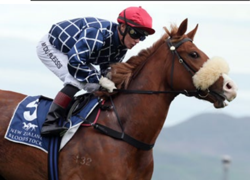
Mystery Show (NZ) (Sakhee's Secret)

Last-start New Plymouth winner Let Her Rip was also entered for the Gr.2 Westbury Classic (1400m) at Ellerslie but Ritchie was keen to test her over 1600m with an eye towards the Gr.1 Fiber Fresh New Zealand Thoroughbred Breeders' Stakes (1600m) at Te Aroha on April 8. Full story here.