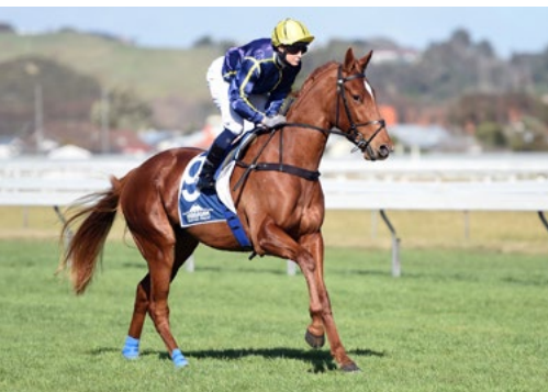
Euphoria (NZ) (Rip Van Winkle)