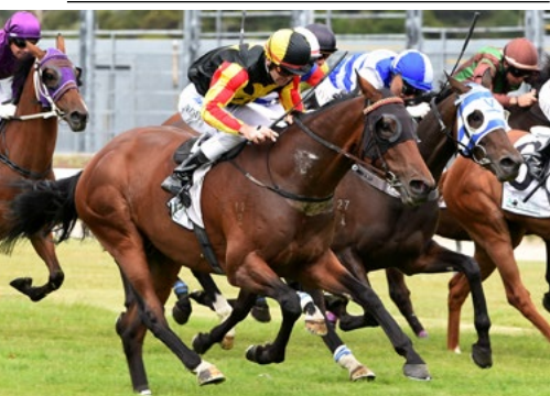
Rock On (NZ) (Road To Rock)