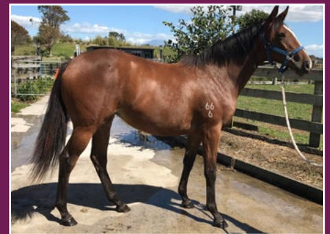
HALF-SISTER TO TRIPLE GROUP ONE WINNER GINGERNUTS.