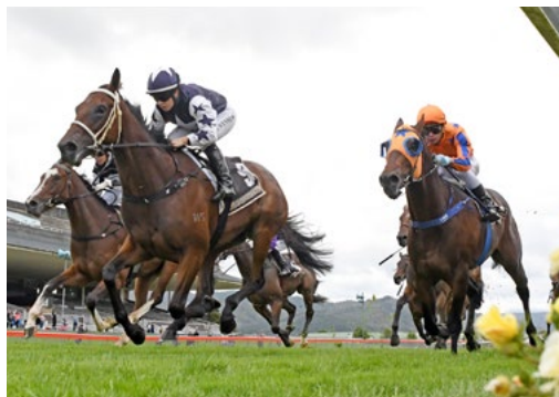
Miss Valencia (NZ) (Ocean Park)

"She'll have a good break and hopefully, all going well, we can get her back to the track in the spring."