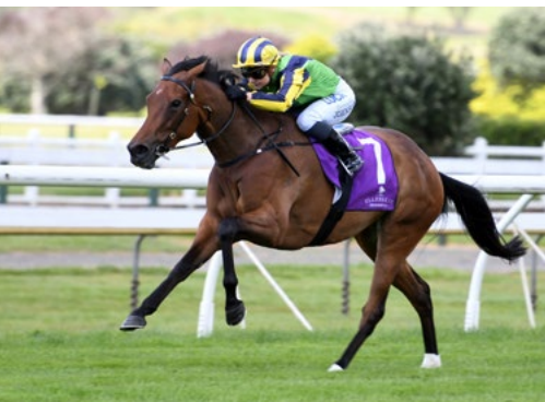
Francaletta (High Chaparral)