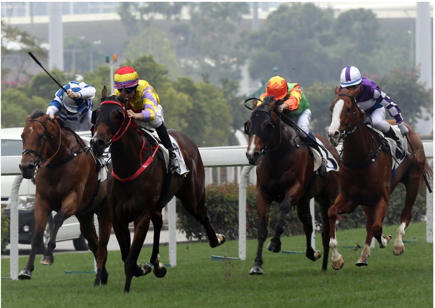
Ping Hai Star looms as a serious challenger for Sunday's Gr.1 BMW Hong Kong Derby