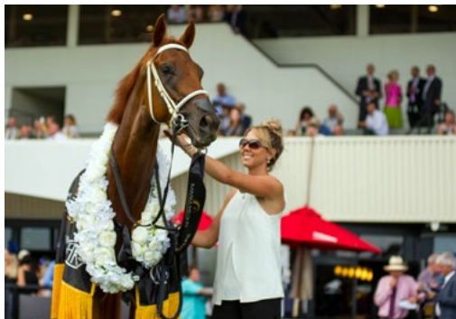
Scott Base (NZ) (Dalghar)