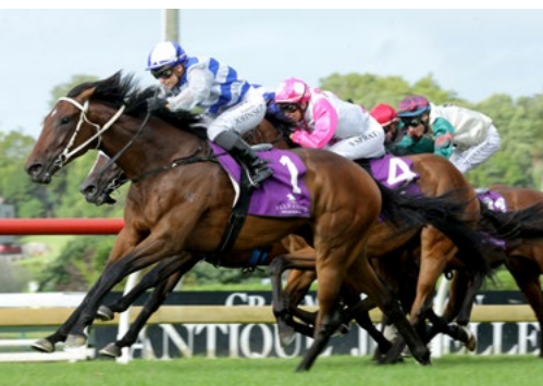
Felaar (NZ) (Ekraar)