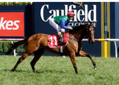
Bonneval (NZ) (Makfi)