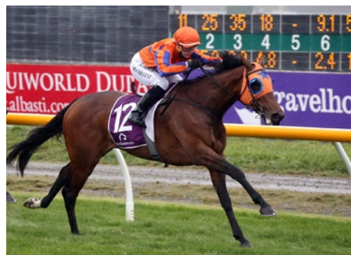
Swing Note (Encosta De Lago)

"Both Bonneval and Sophia Rosa ran in the Lowland Stakes, the Oaks here and then won the Australian Oaks – it's the right way to go."