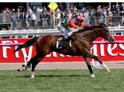
Odeon (NZ) (Zacinto)