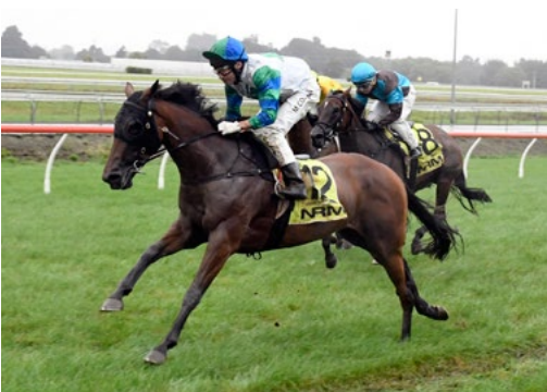
Gold Spice (NZ) (Rock 'n' Pop)

Salsamor has met with support for the Sky High Stakes and sits on the fifth line of betting at $9.50.