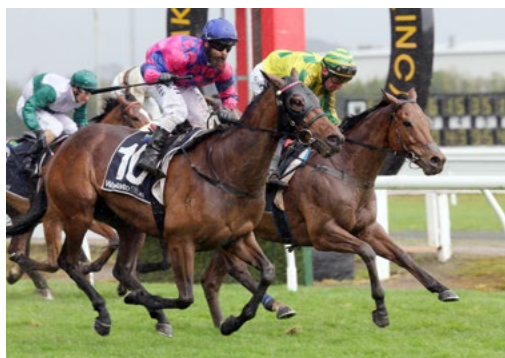
Underthemoonlight (NZ) (El Hermano)

"After protracted negotiations we have managed to buy him outright," he said. Full story here