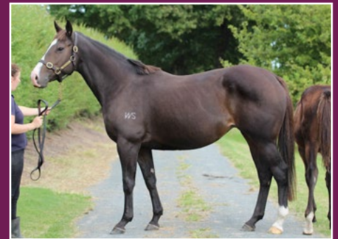
UNRESERVED 3 IN 1 LOT - O'REILLY MARE IN FOAL TO OCEAN PARK.