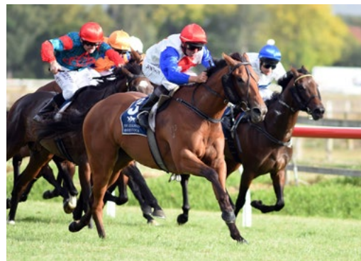
Savvy Coup (NZ) (Savabeel)