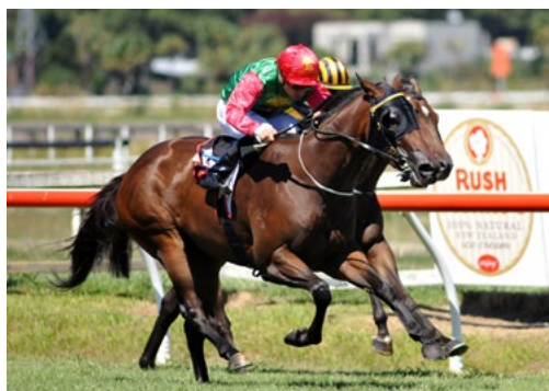
Perroquet (NZ) (Ocean Park)