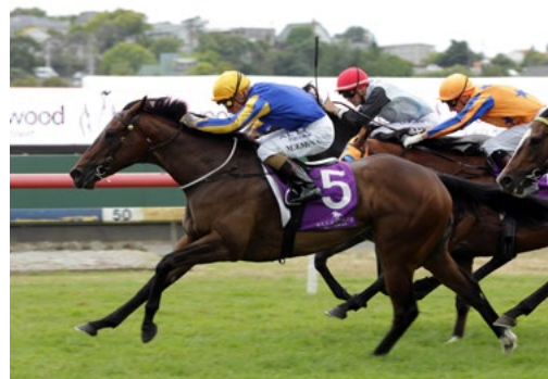
Melt (NZ) (Iffraaj)

Pukekohe two-year-old Melt (NZ) (Iffraaj) is to be given her shot at Group One redemption.