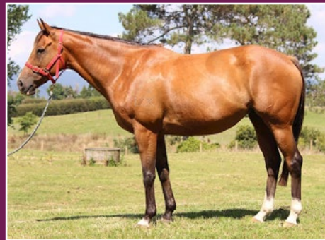
UNRESERVED STRAVINSKY MARE CARRYING AN EL ROCA COLT.