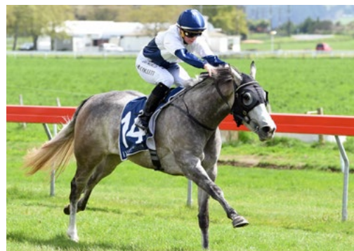
Kapoor (NZ) (Reliable Man)