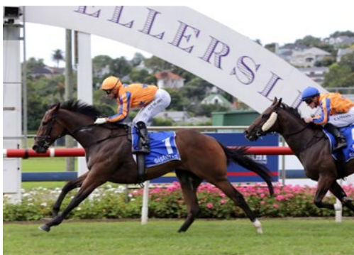
Sword Of Osman (NZ) (Savabeel)

The talented two-year-old stablemates are confirmed runners in the Courtesy Ford Manawatu Sires' Produce Stakes (1400m) on March 31.