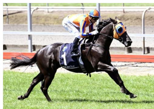
Handsome Rebel (Denman)