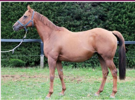
3 IN 1 LOT - IN FOAL TO ZACINTO WITH A ZACINTO COLT AT FOOT.

Featuring 54 Lots including yearlings, racing stock and broodmares.