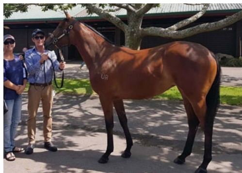
Jakkalberry ex Double Elle filly