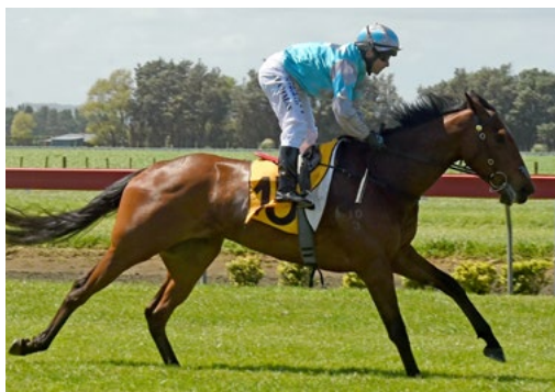
Hello M'Lady (NZ) (Shocking)

"He's nice and fresh and he's drawn well, he's got a good turn of foot and Trentham