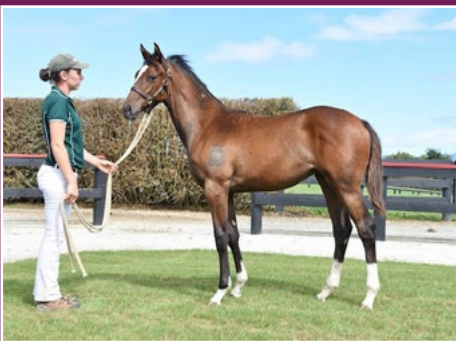
UNRESERVED SHOWCASING FILLY OUT OF STAKES WINNER SARAJAY.