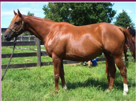
UNRESERVED 3 IN 1 LOT - VOLKSRAAD MARE IN FOAL TO MONGOLIAN KHAN.