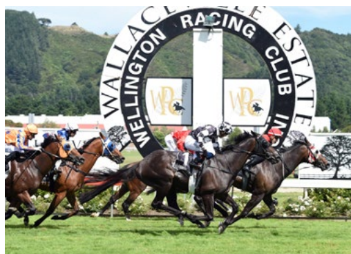
Enzo's Lad (Testa Rossa)

Odeon, winner of six of his 18 starts, was placed in the Gr.1 South Australian Derby (2500m) last year while in the spring he was tested at Group One weight-for-age level in the Emirates Stakes (2000m) at Flemington, finishing 2-1/2 lengths from the winner, Tosen Stardom (Deep Impact) who also runs in the Blamey, in eighth.