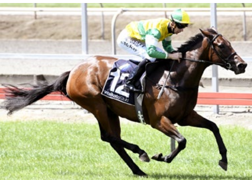
Concert Hall (NZ) (Savabeel)