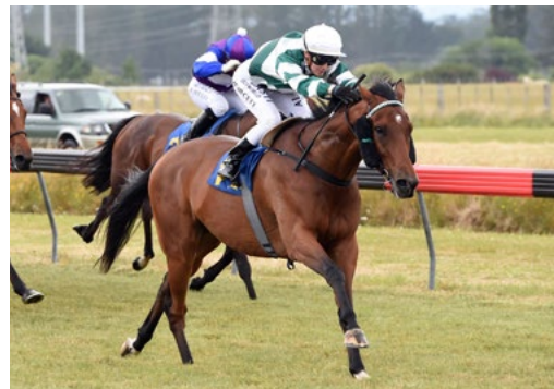
Bizzwinkle (NZ) (Rip Van Winkle)

"He's come back nicely, but we're not expecting much. He hasn't had a lot of pressure put on him and as long as he gets around safely and pulls up well we'll be happy."