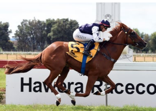
Boss (NZ) (Towkay)

"She's been handled patiently and, as long as she comes through each run well, I don't see any reason why we won't push on with her."