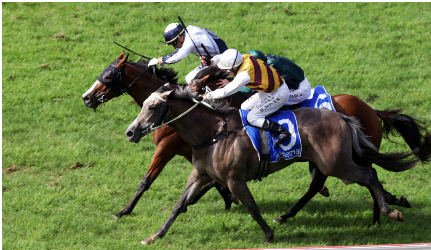
Yourdeel (inner) beats Aalaalune and the partially obscured Aretha (middle) to win the Gr.1 Sistema Stakes