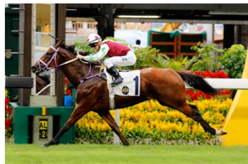
Fabulous One (NZ) (Elusive City)