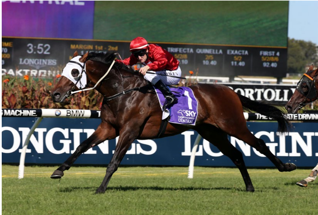
Tarzino, the outstanding son of Tavistock, will commence stallion duties at Westbury Stud this season

Tarzino hails from a pedigree that New Zealand breeders are familiar with, being by Cambridge Stud's headline act