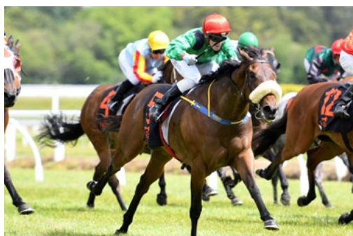
Let Her Rip (NZ) (Rip Van Winkle)

Rising Shot has been freshened since finishing a solid fourth in the Gr.2 Rich Hill Mile at Ellerslie on New Year's Day. Beforehand she was runner-up in the Gr.2 Cal Isuzu Stakes at Te Rapa.