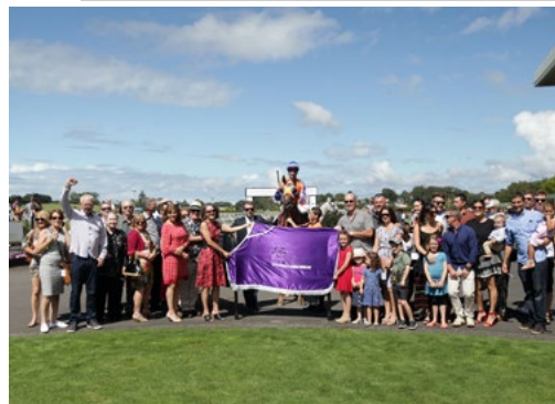
Gingernuts (NZ) (Iffraaj)