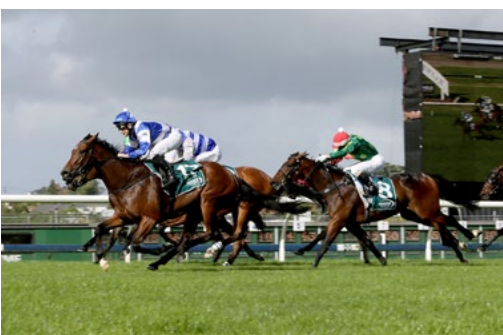
Rising Shot (NZ) (Red Giant)