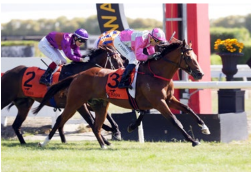
Wyndspelle (NZ) (Iffraaj)

while a tendon problem has ruled St Jean (Teofilo) out of the Gr.1 $500,000 Barfoot & Thompson Auckland Cup and ended his racing career.