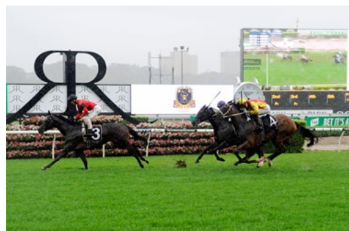
La Bella Diosa (NZ) (So You Think)

"Anyway, it's the owner's decision in the final analysis so we're staying here to target the QE II Cup and Champions & Chater again."