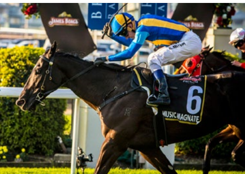
Music Magnate (NZ) (Written Tycoon)