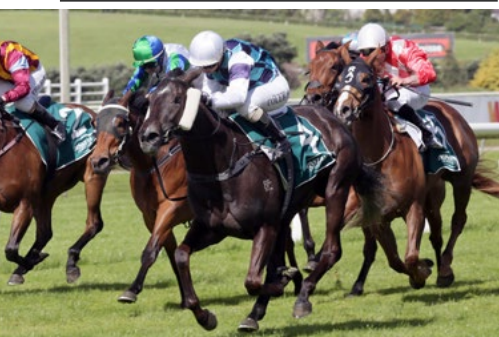
Astara (NZ) (Dalghar)

The well-regarded son of Smart Missile was subsequently found to be sore behind and will not race again this season.