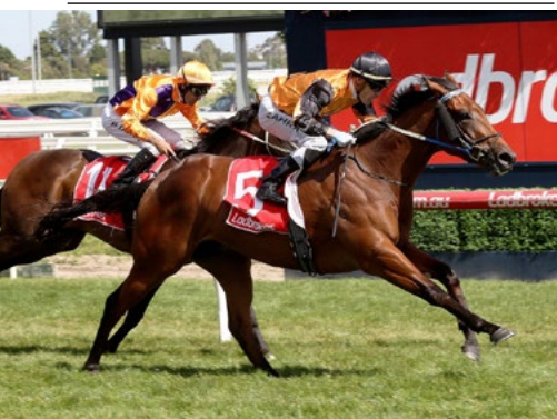
Legless Veuve (NZ) (Pins)