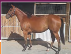
QUALITY SHAMEXPRESS FILLY OUT OF A WINNING PINS MARE.