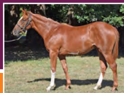
YEARLING FILLY BY ZACINTO OUT OF A GROUP PERFORMER.