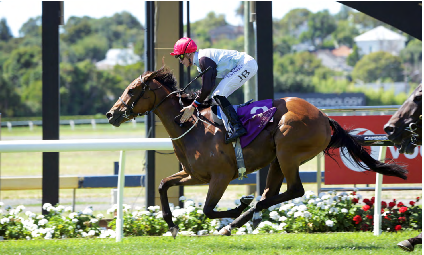
Pinmedown dashes clear at Ellerslie to score handsomely in the Gr.3 McKee Family Sunline Vase