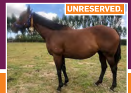
UNRESERVED. REDOUTE'S CHOICE MARE WITH A SHAMEXPRESS FILLY AT FOOT.

BIDDING CLOSSES FROM 7PM TOMORROW NIGHT - REGISTER ONLINE NOW TO BID.