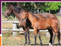
TAVISTOCK MARE FROM THE FAMILY OF SAVVY COUP.