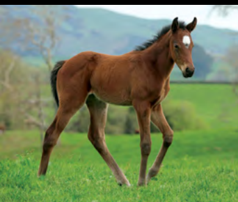
Ex Preloved (TEOFILO)