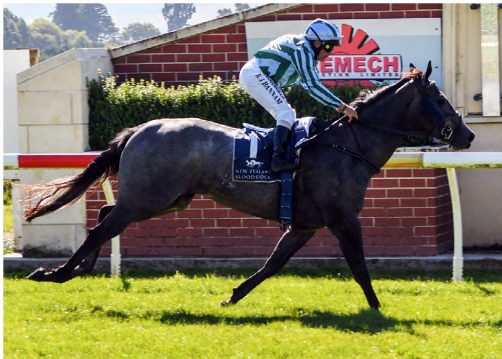
Emily Margaret winning the Listed NZB Insurance Stakes (1400m)

"She seems to have come through the race very well and we will have a look at the Wellington Guineas. The travel doesn't seem to worry her,"