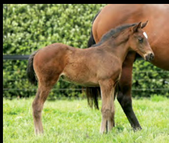
Ex Moodhilla (EXCEED & EXCEL)