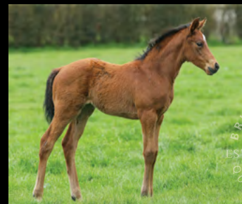
Ex Keep Smiling (STRAVINSKY)