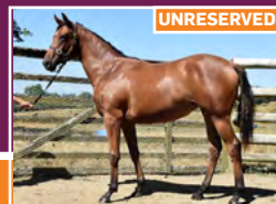
UNRESERVED. YEARLING IFFRAAJ FILLY OUT OF A STAKES PERFORMER.