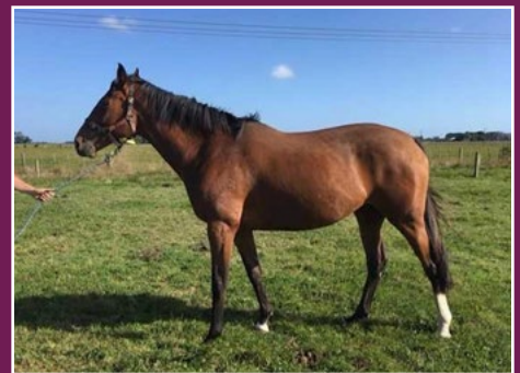
UNRESERVED FULL SISTER TO A DUAL AUSTRALIAN GROUP ONE WINNER.