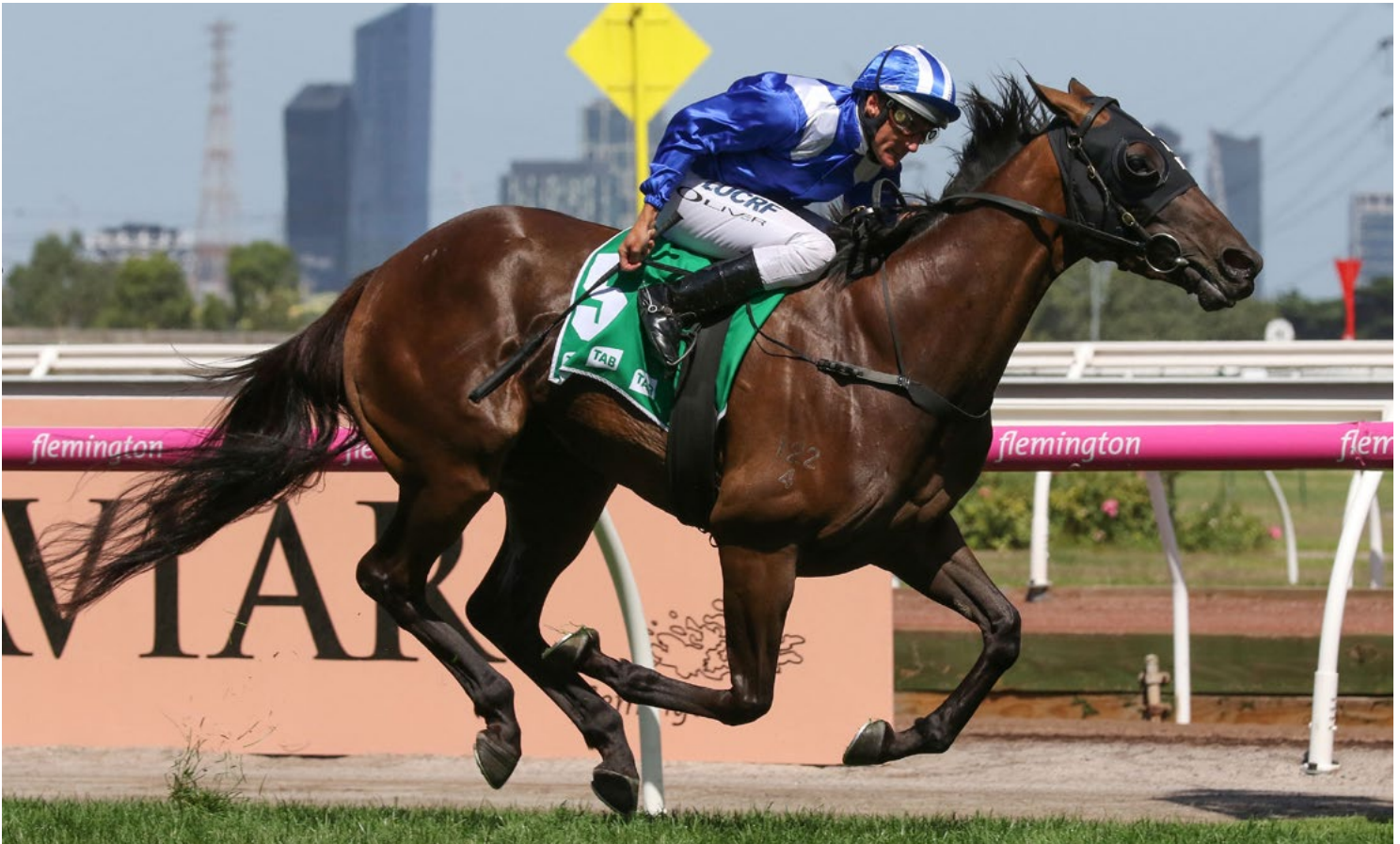
Rimraam will tackle the Gr.1 Surround Stakes (1400m) at Randwick on Saturday

A new Group One race on the Australian calendar may have come at an opportune time for Lindsay Park filly Rimraam (NZ) (Commands).