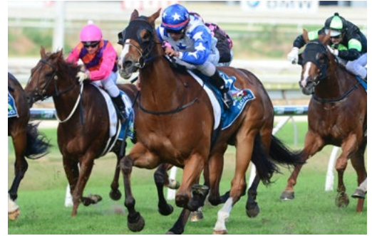
Crack Me Up (NZ) (Mossman)

Bjorn Baker will oversee Crack Me Up's (NZ) (Mossman) Gr.1 Doncaster Mile (1600m) campaign following Racing NSW's decision to bar Brisbane trainer Liam