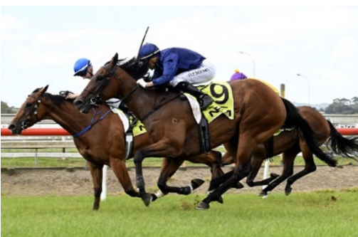
Paulownia (Fastnet Rock)