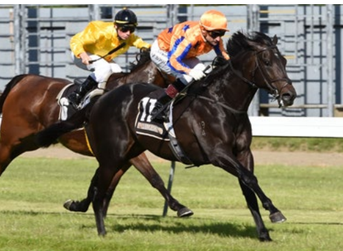
Embellish (NZ) (Savabeel)