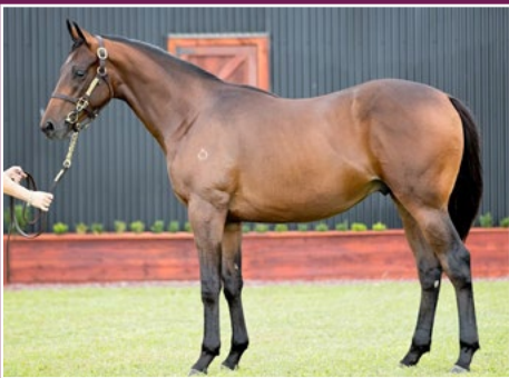
MAKFI COLT OUT OF A STAKES-WINNING O'REILLY MARE.

Featuring 36 Lots including yearlings, racing stock and broodmares.