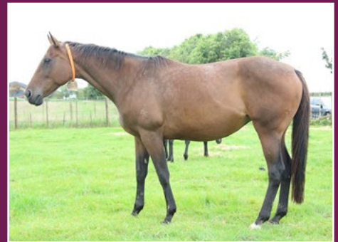
UNRESERVED RESET MARE IN FOAL TO PINS.