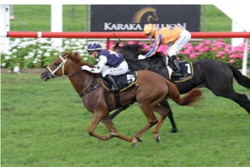
Scott Base (NZ)