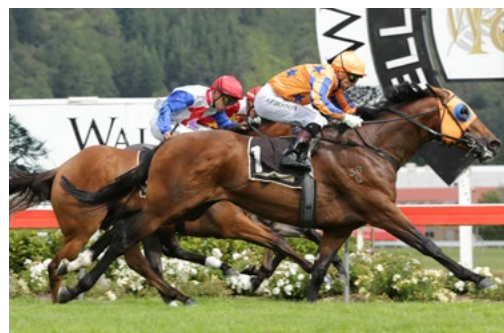
Age Of Fire (Fastnet Rock)

The Fastnet Rock colt's trip was sealed by his effort to come from last to finish third over 1400m at Matamata last Saturday, his