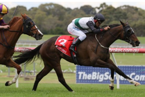
Fanatic (NZ) (Shocking)