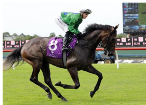
Joe's Legacy (NZ) (Guillotine)

"For such a cheap filly, and cheap doesn't reflect her pedigree, to do what she has already done is amazing and it's only the beginning." Full story here