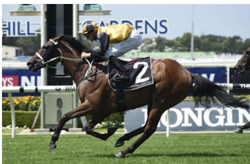
Antonio Giuseppe (NZ) (Shocking)