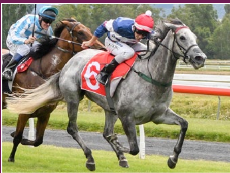
UNRESERVED WINNING IFFRAAJ MARE - RACE OR BREED.