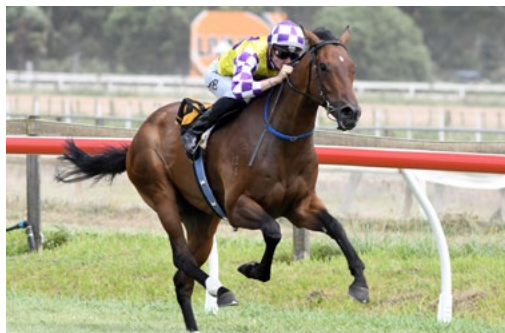
Sacred Day (NZ) (Azamour)

Talented three-year-old Sacred Day (NZ) (Azamour) is in line for a trip across the Tasman.