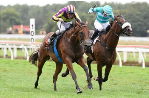
Start Wondering (NZ) (Eighth Wonder)