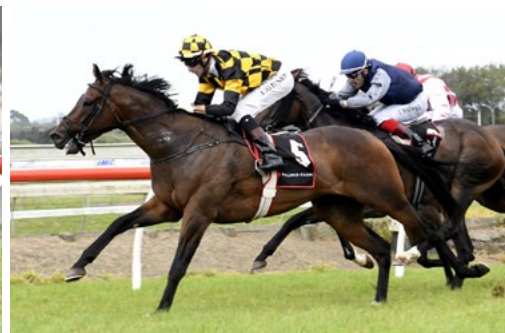
Sherrif (NZ) (High Chaparral)