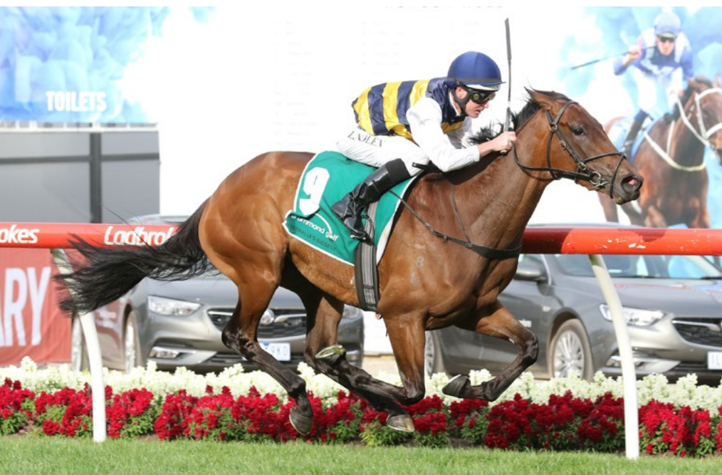
Aloisia looks a top chance in Saturday's Gr.1 Australian Guineas (1600m) at Flemington