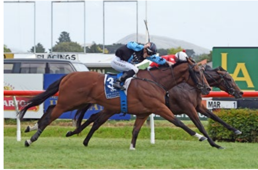
Montoya Star (High Chaparral)