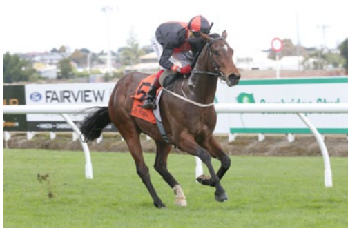
Xbox (NZ) (Niagara)