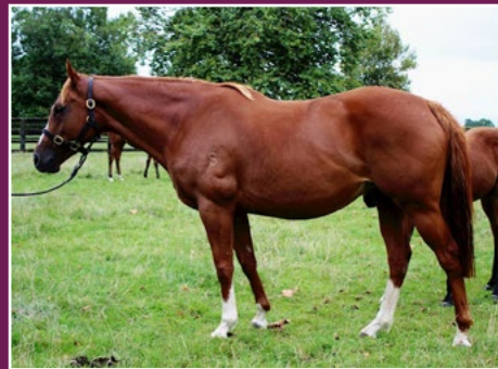
3 IN 1 LOT. UNRESERVED MARE IN FOAL TO MONGOLIAN KHAN.