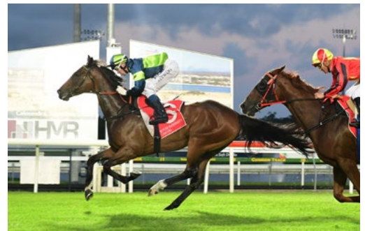
Toni May (NZ) (Tavistock)

Crack Me Up secured a ballot exemption for the A$3 million Doncaster Mile on April 7 by winning the Gr.2 Villiers Stakes (1600m) at Randwick in December.