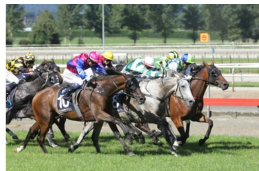
Show The World (NZ) (High Chaparral)

Age Of Fire has won three of his seven starts and also finished runner-up in the Gr.1 New Zealand 2000 Guineas (1600m) in the spring.