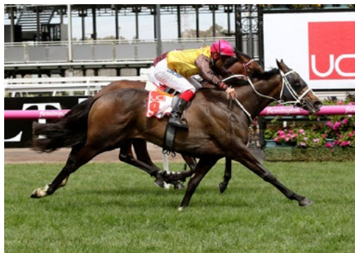
Main Stage (NZ) (Reliable Man)

"He's also showed he likes Flemington and he will relish the 1600 metres and is even looking for further."