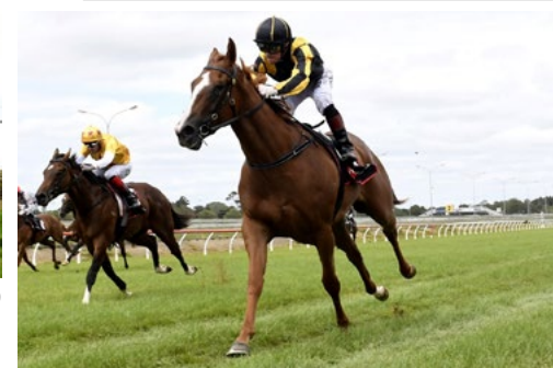
Stolen Gem (Snitzel)