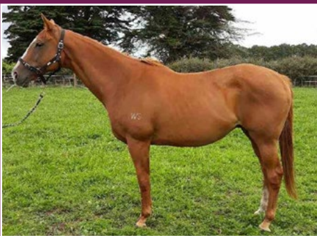
UNRESERVED PINS MARE - DAM OF TWO WINNERS IN FOAL TO PROISIR.