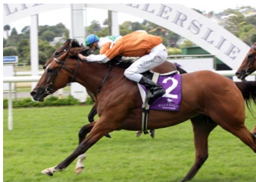
Rising Romance (NZ) (Ekraar)

A win would also help Darci Brahma retain his crown as Singapore's champion sire. The Oaks Stud stallion has reigned supreme in recent years, winning the title in four of the last five seasons. Full story here