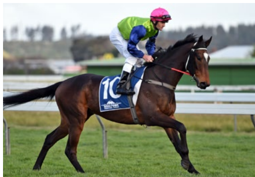
Gobstopper (NZ) (Tavistock)

Her performances will determine whether she earns a crack at the Gr.1 Tarzino Trophy on the opening day of the Hawke's Bay carnival.