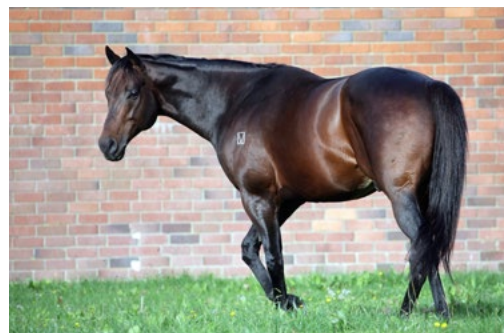
Darci Brahma (NZ) (Danehill)

"She's always been quite physically and mentally backward and she will get better as she matures. She's a horse we've got a bit of time for."