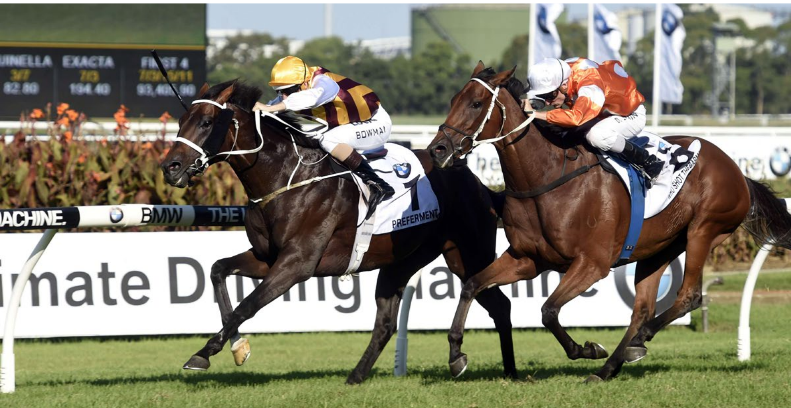
Multiple Group One winner Preferment will stand at Brighthill Farm during the 2017 Breeding season

A champion son of the legendary Zabeel (NZ) has been secured for stud duty by Brighthill Farm.