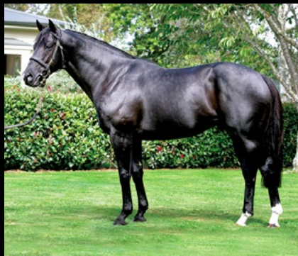
PERFECTLY READY (Aus) More Than Ready - Elle Duccio, Danehill

One of New Zealand's proven Group I sires, leaving winners worldwide.