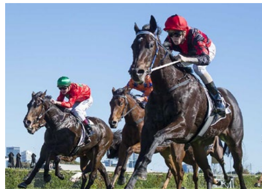
Ocean Jewel (Ocean Park)

Yogi beat fellow Kiwi import The Willybee (NZ) (Alamosa) in his latest win.