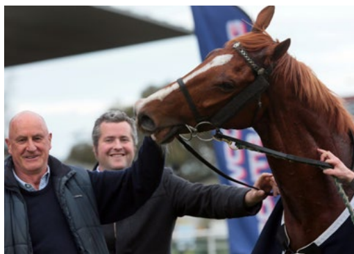
Thorn Prince (NZ) (Thorn Park)

"He's tough enough and the only slight question mark will be the step up in company, but he should cope with that," he said. Full story here