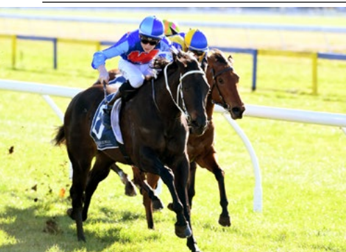
Malambo (NZ) (Duelled)