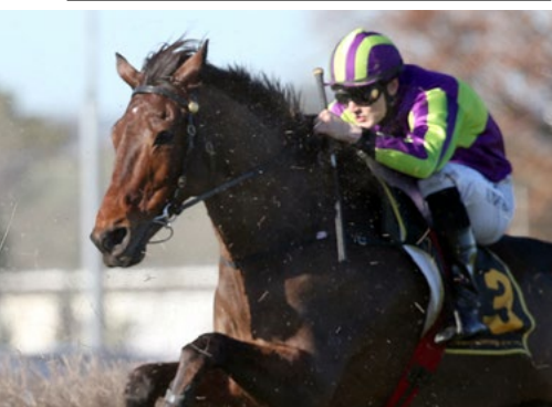
Mr Mor (NZ) (Corrupt)

"The handicap race we're in has fallen away a bit and she is a very good chance to run in the first three. If she does, we'll stay on and run her in a Listed race in three weeks' time at Doomben, but if she can't then she will come home." Full story here.