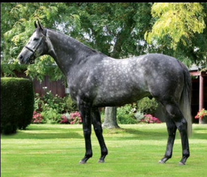
DALGHAR (Fr) Anabaa - Daltawa, Miswaki

Exciting young sire. Huge Karaka Sales series, selling up to $220,000 & overall sales average of $53,000.