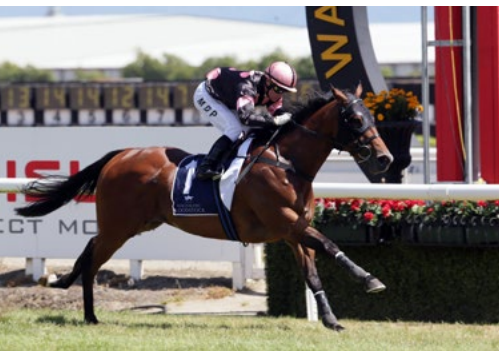
Pinzalot (NZ) (Pins)

Both Bonneval and Jon Snow returned to their Cambridge quarters at the beginning of this month.