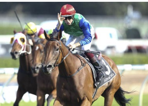
Bonneval (NZ) (Makfi)