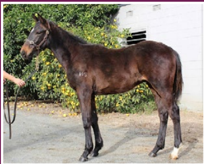
COLT BY SACRED FALLS. OUT OF LADY LIKE (SAVABEEL).