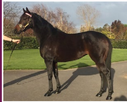
QUALITY FILLY BY IFFRAAJ. BROKEN IN.