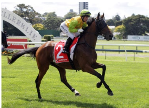
Pacorus (NZ) (Tavistock)