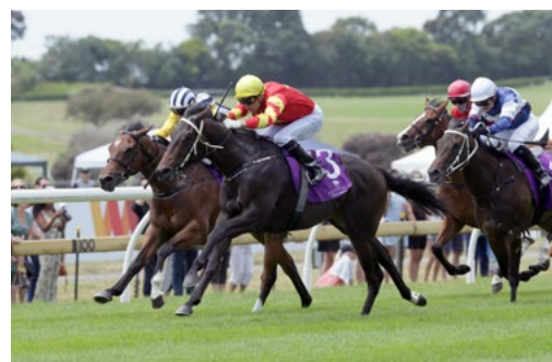
Star Treasure (NZ) (Lonhro)