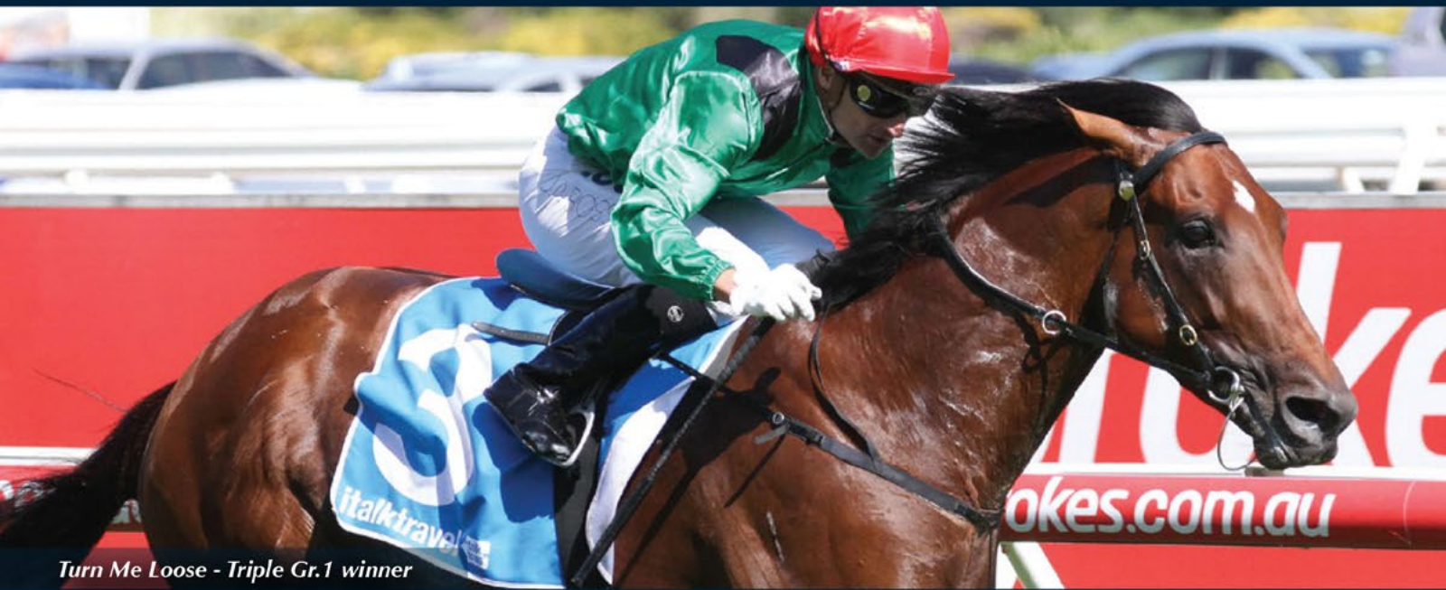
Turn Me Loose - Triple Gr.1 winner