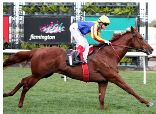
Spieth (NZ) (Thorn Park)