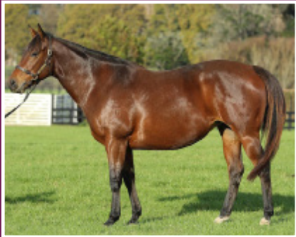
YOUNG PINS MARE. IN FOAL TO BURGUNDY.