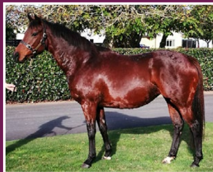
YOUNG DARCI BRAHMA MARE. IN FOAL TO PER INCANTO.