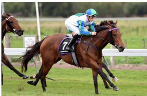
Flamingo (NZ) (Pins)

Raced by breeders Waikato Stud, Checkout is a daughter of Savabeel and the Group Two winner Shopaholic.