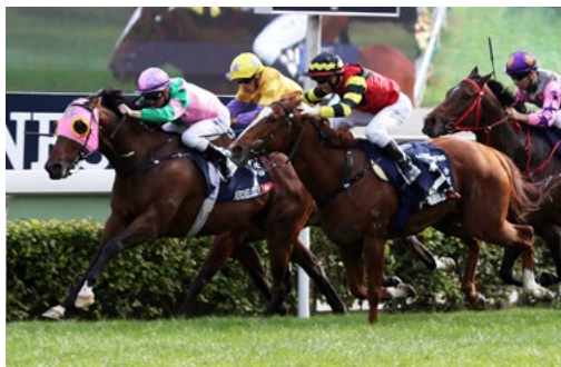
Aerovelocity (NZ) (Pins)

Aerovelocity to get Sha Tin send off Star Hong Kong sprinter Aerovelocity