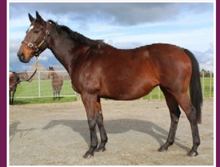
WINNING O'REILLY MARE. IN FOAL TO OCEAN PARK.