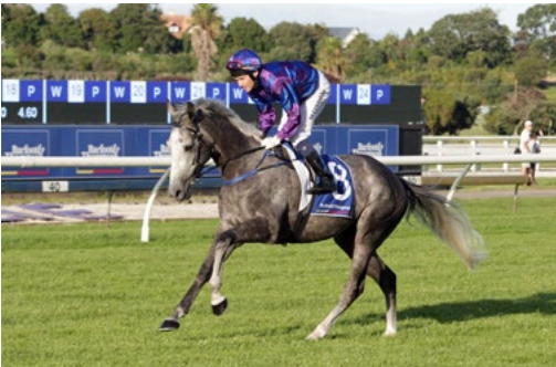
Megablast (NZ) (Shinko King)