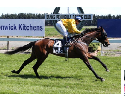
Tessastock (NZ) (Tavistock)