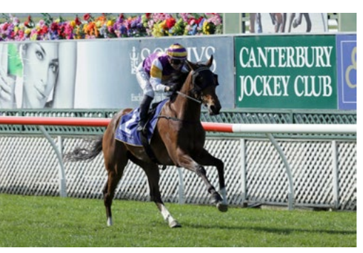
Nymph Monte (NZ) (Tavistock)

Nymph Monte hasn't raced since he finished at the tail of the field in the Gr.2 Auckland Cup.