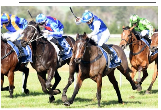
Style By Design (NZ) (Iffraaj)

The Stallion Register is available from the NZTBA at a cost of $150 + GST, but is free to members of the association.