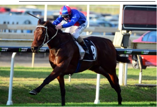
Chocante (NZ) (Shocking)

Victorious in Group One races on both sides of the Tasman as well as success in Hong Kong earlier in the season, Bosson rode 52 domestic winners for stake earnings of $2,341,705 in 2016-17.