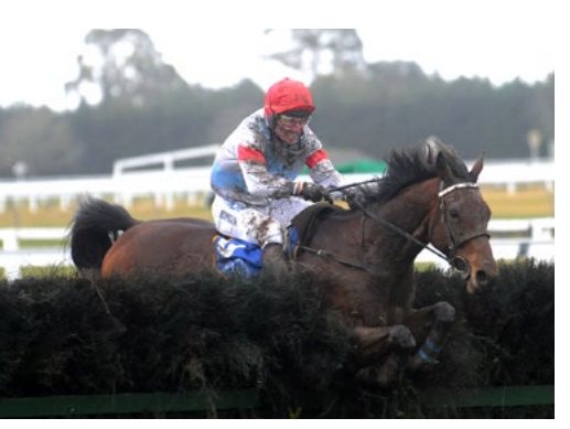
Upper Cut (NZ) (Yamanin Vital)