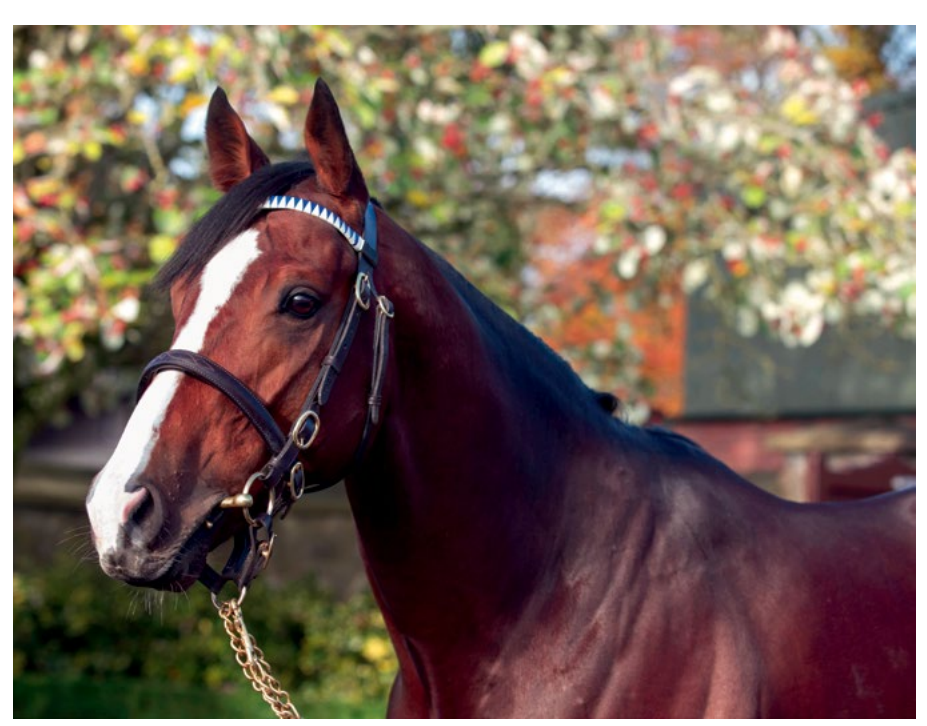
Belardo is a newcomer to the New Zealand stallion ranks who will stand his first season at Haunui Farm this year