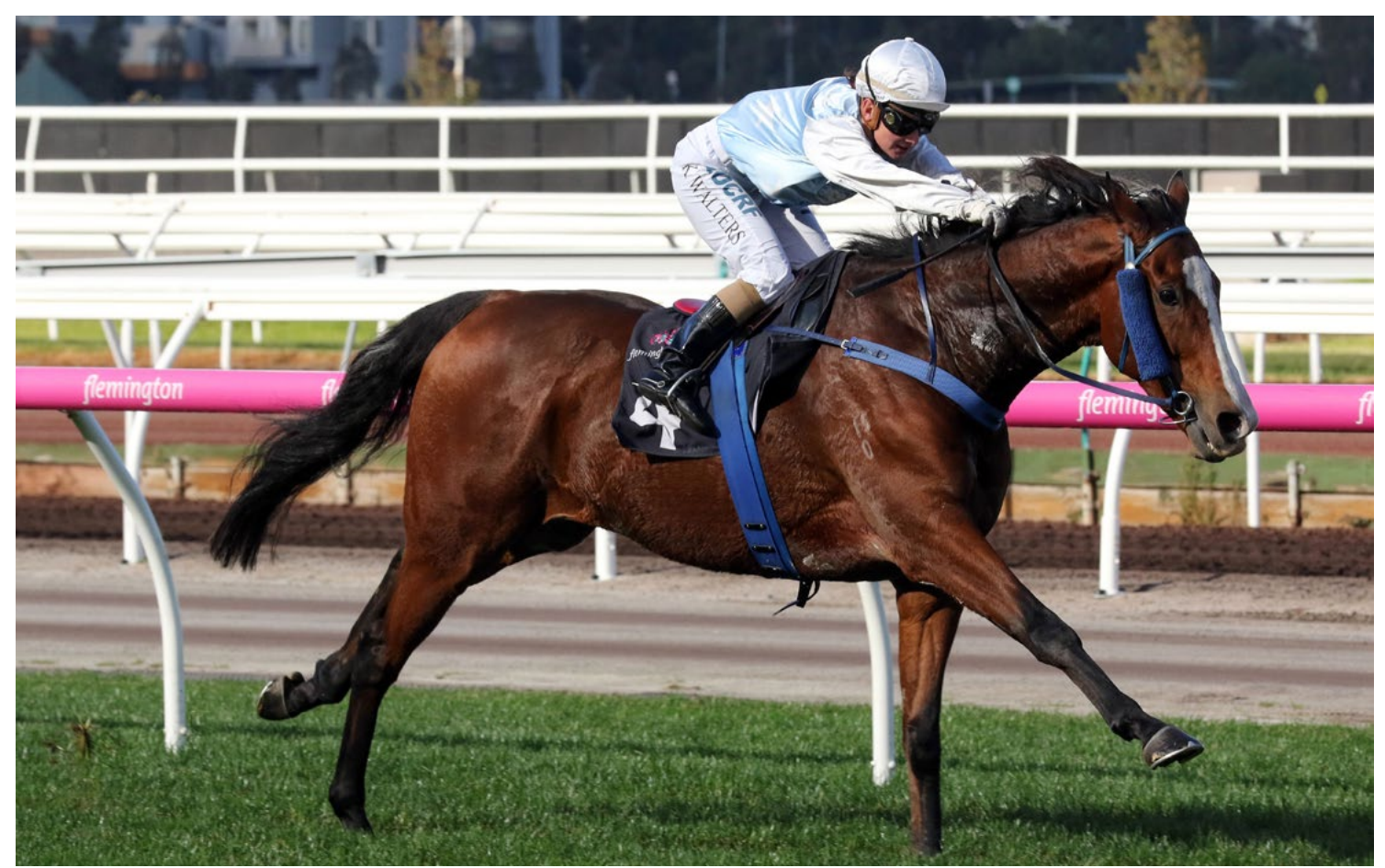
Choysa wins at Flemington in a daring front-running display