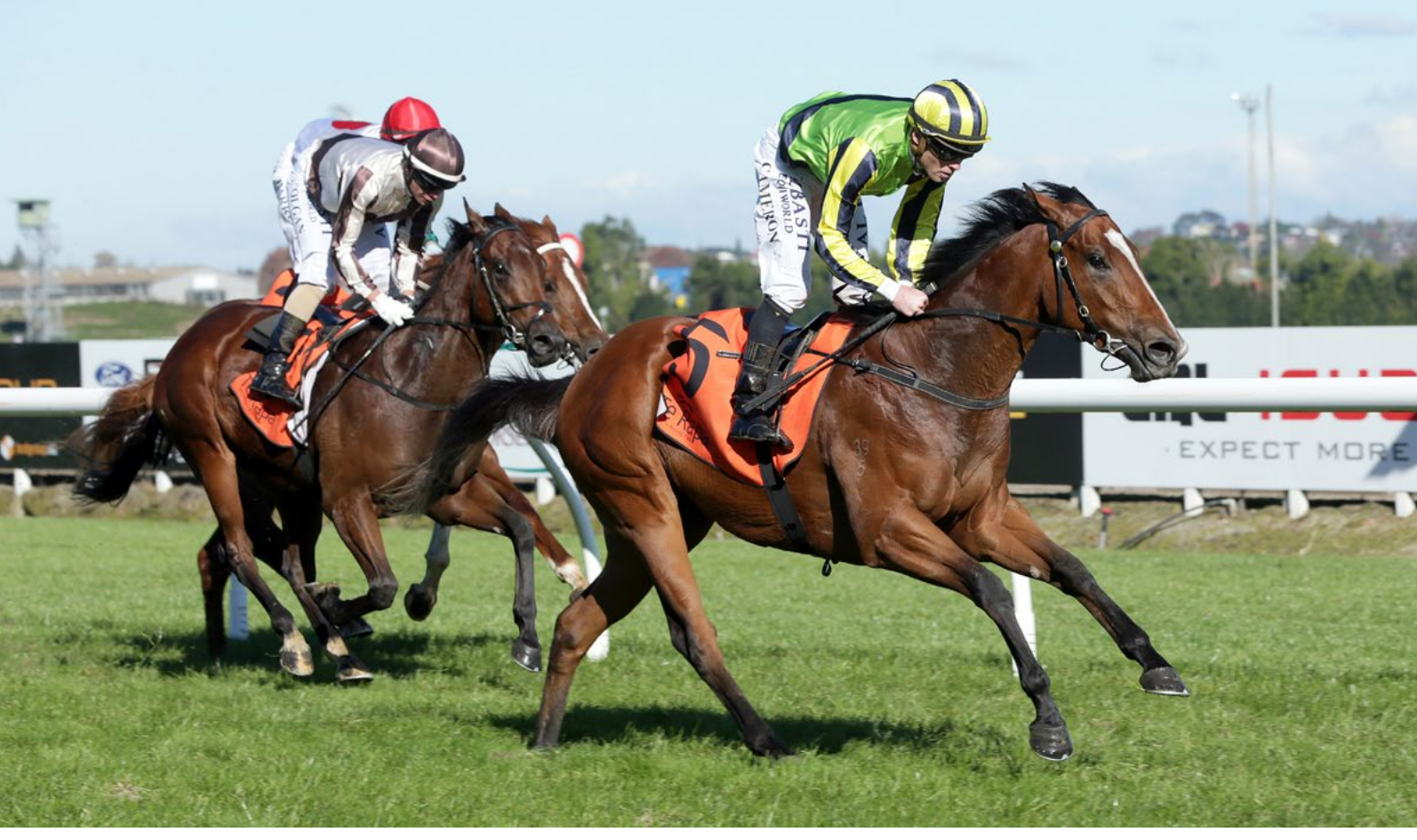
Smart filly Peaceful claims top black type honours at Te Rapa

urray Baker and Andrew Forsman won't be in any hurry to press the promising Peaceful (NZ) (Savabeel) into action in her classic season.