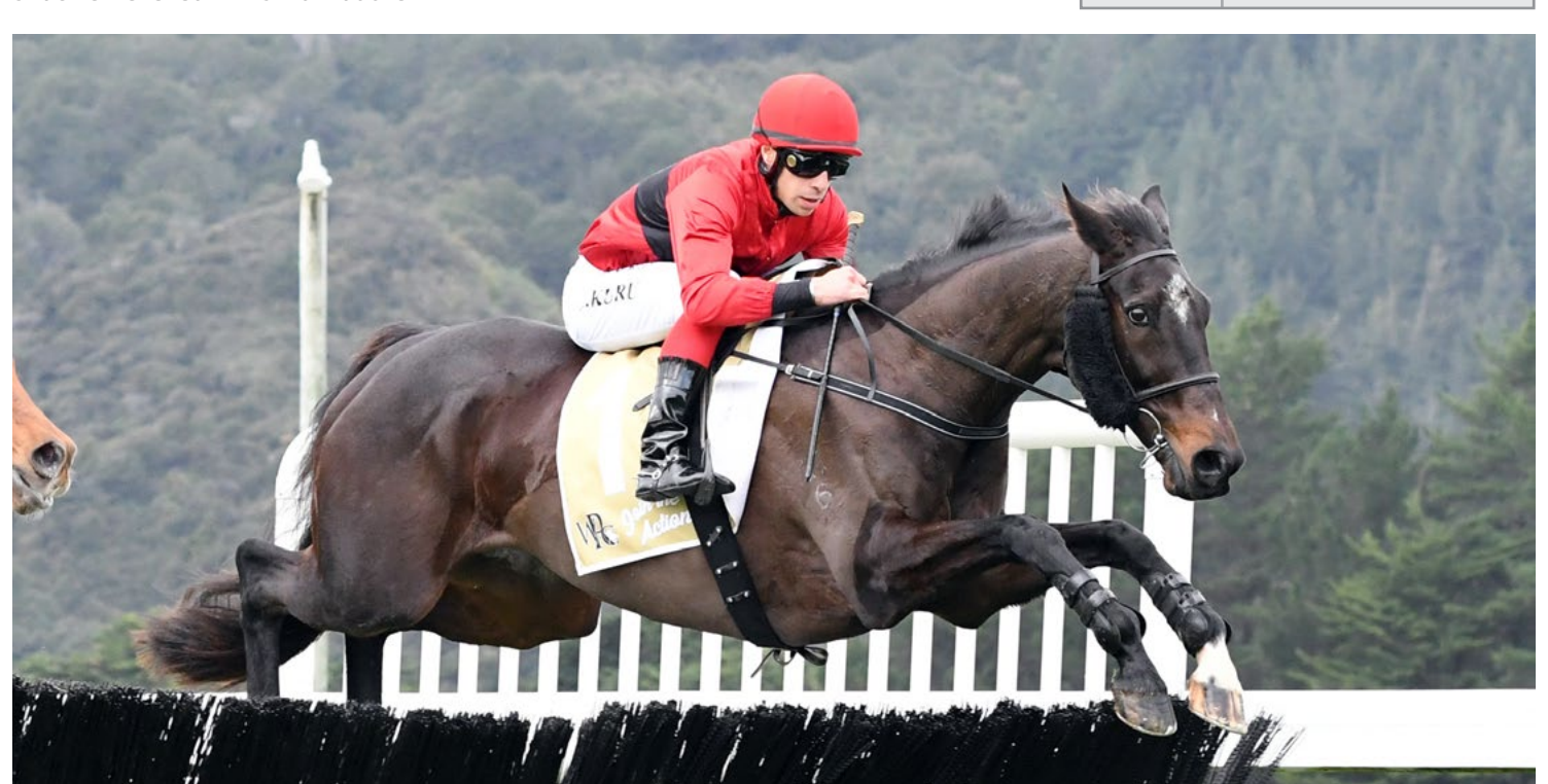
The Shackler on his way to victory at Trentham