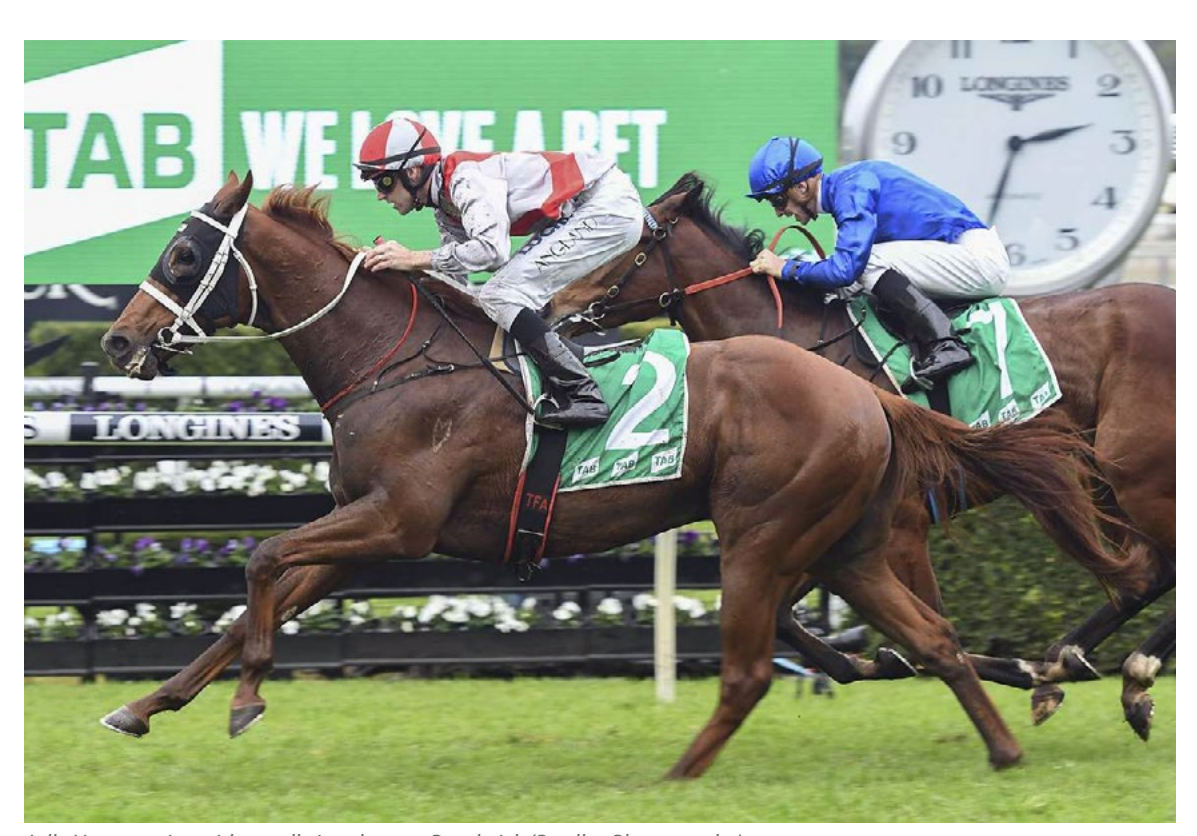
Jolly Honour wins with a well-timed run at Randwick

Jolly Honour is trained by champion ex-pat Kiwi conditioner