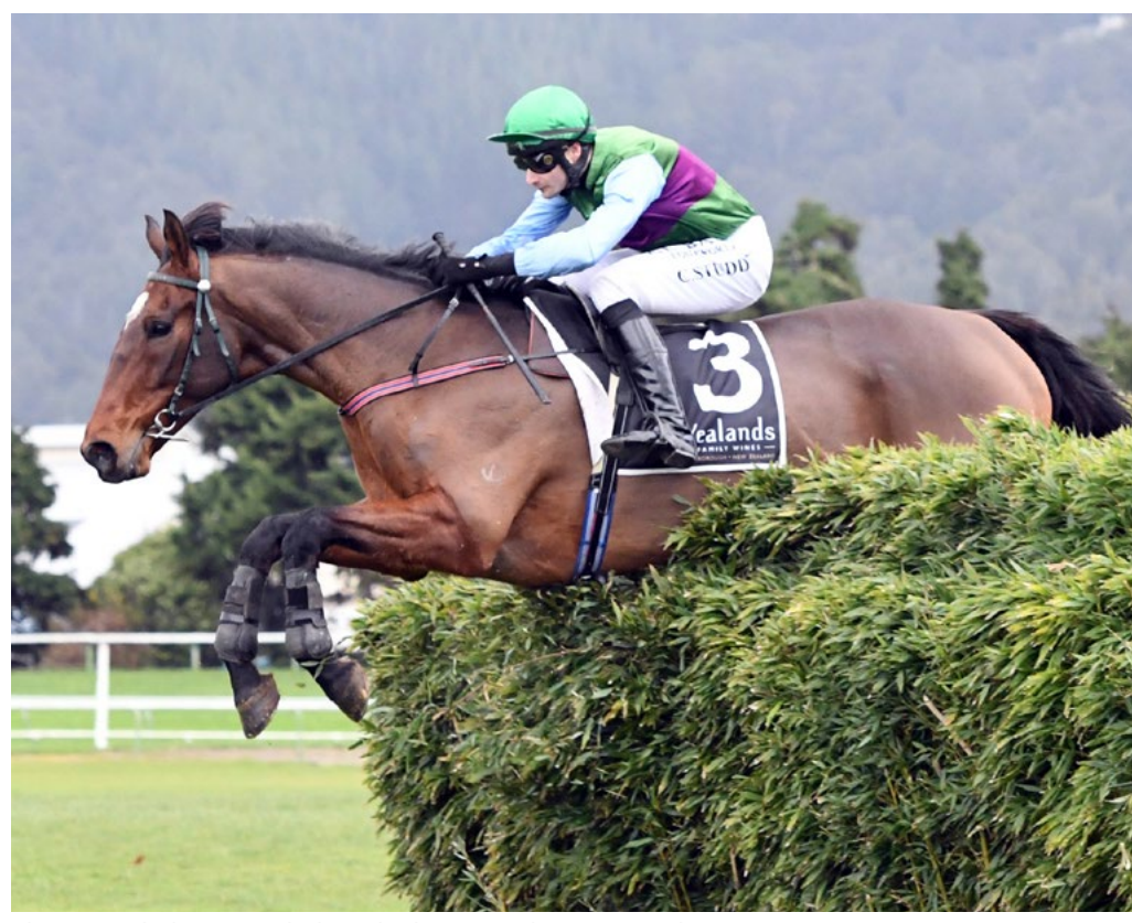
The Big Opal who gave a dashing display at Trentham

flat and once over hurdles and has found the big fences much more to his liking.