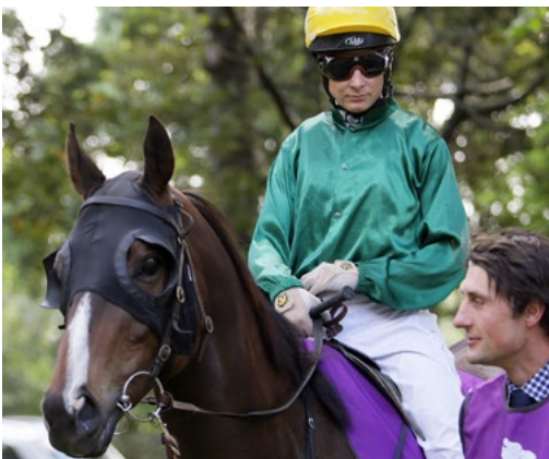
Benzini (Tale Of The Cat)