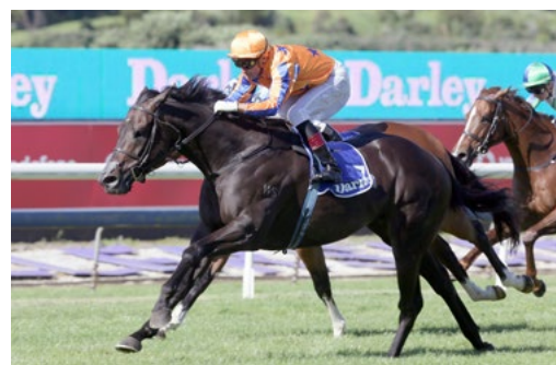
Splurge (NZ) (Savabeel)

On his return home, the son of Pour Moi had a further three starts culminating in his fifth placing in the Gr.1 New Zealand Derby.