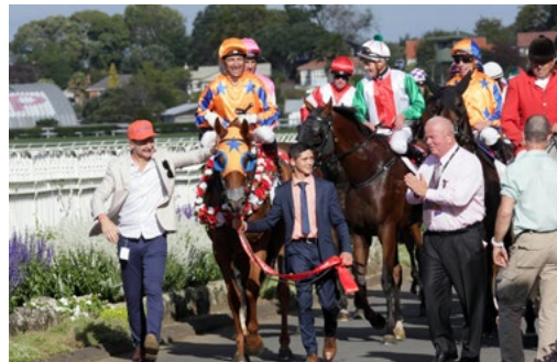
Gingernuts (NZ) (Iffraaj)

The Ellerslie deeds of the outstanding three-year-old Gingernuts (NZ) (Iffraaj) were acknowledged at the Ellerslie Awards ceremony held during their Queen's Birthday meeting.