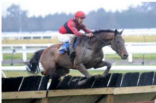
Second Innings (NZ) (Yamanin Vital)

The winner of four races on the flat and placed in the Listed Tamarunui Cup,