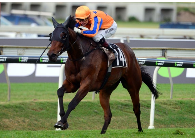
Shocking Luck is one of the headliners from the Te Akau Racing team in action at Doomben tomorrow

the Listed Daybreak Lover (1200m) and Jimmy Rea (NZ) (Thewayouare) in the Listed Mark Hinkler Handicap (1200m).