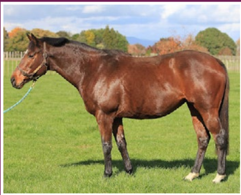
STAKES WINNING IFFRAAJ MARE. IN FOAL TO OCEAN PARK.

Including quality weanling colts by Savabeel and Ocean Park and breeding prospects as part of the Gartshore Bloodstock Unreserved Dispersal Sale.