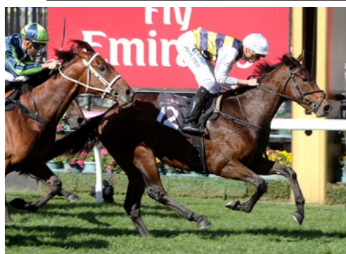
Aloisia (NZ) (Azamour)