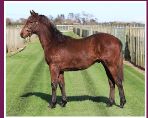
QUALITY COLT BY SAVABEEL. PIN HOOKING PROSPECT.

NEXT AUCTION DATES • Accepting listings from Tuesday 13 June • Listings close 7pm Monday 19 June • Catalogue published online 5pm Tuesday 20 June • Bidding from 5pm Tuesday 20 June to close of auction on Monday 26 June • Lots close in sequential order from 7pm on Monday 26 June.