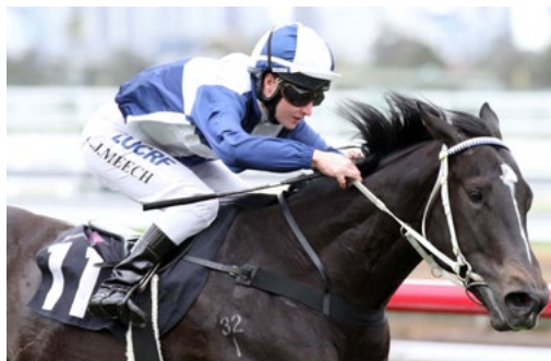
Zebulon (NZ) (All American)