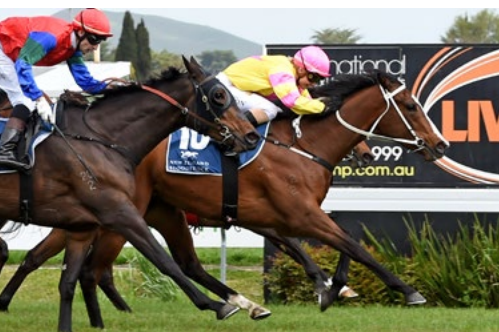
Serious Satire (More Than Ready)

"We'll probably look for something soft first-up to give her some confidence and I've got no doubt she is a Hawke's Bay carnival horse, but we'll just see what happens later on."