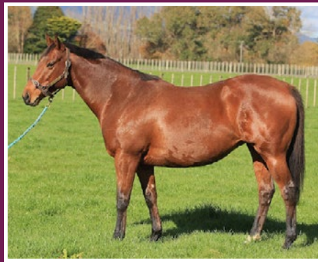
YOUNG PINS MARE. IN FOAL TO SAVABEEL.