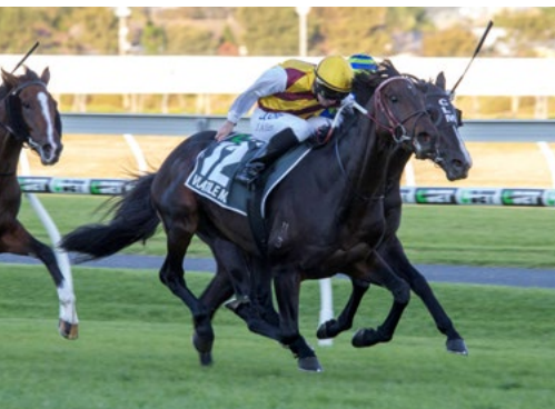
Volatile Mix (NZ) (Pentire)