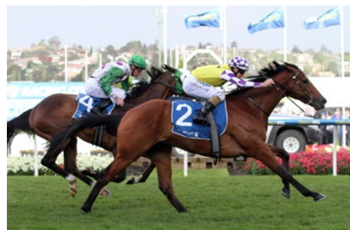
Sacred Elixir (NZ) (Pour Moi)