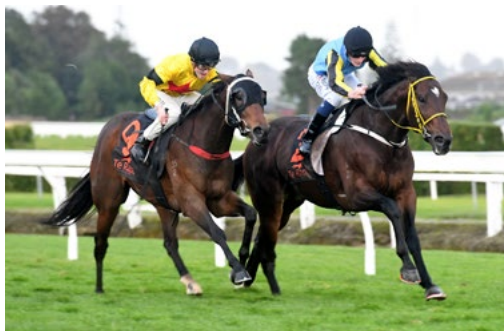
Thunder Down Under (Street Sense)

Second Innings claimed two easy wins over fences at the Grand National meeting at Riccarton last year before he beat Danza Lad (NZ) (Woodbury Lad) at Te Aroha in his only other jumping appearance.