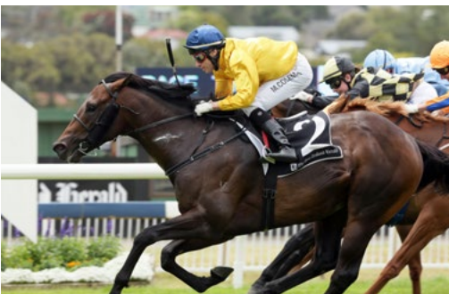
Savile Row (NZ) (Makfi)

Plans for Hall Of Fame and Splurge next season have yet to be determined.