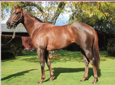
PEARL SERIES ELIGIBLE RACE FILLY OUT OF A HALF TO TAVISTOCK.

Featuring 44 Lots including weanlings, yearlings, tried and untried racing stock and broodmares.