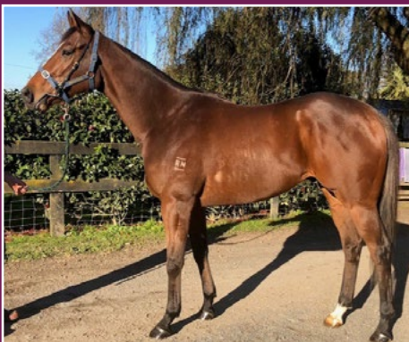
RECENT TRIAL WINNER.