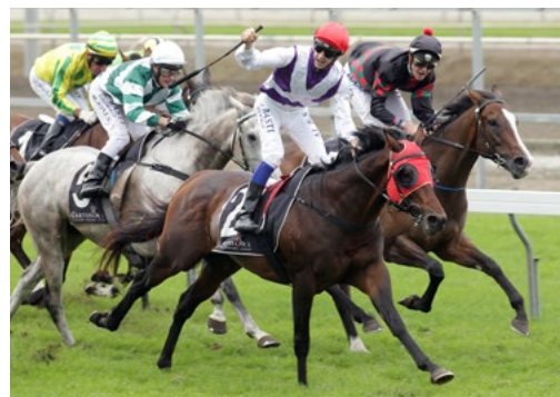
Ocean Emperor (NZ) (Zabeel)

Ocean Emperor's (NZ) (Zabeel) New Zealand future is likely to focus on weight-