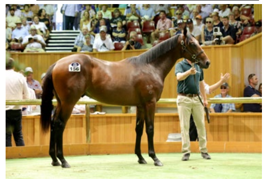
Lot 156 Karaka 2018