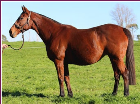
CITY WINNING ANABAA MARE IN FOAL TO PREFERMENT.