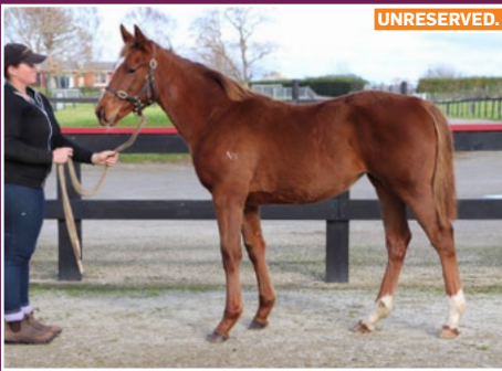
WEANLING FILLY BY SUPER EASY.