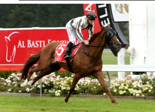
Daytona Red (NZ) (Sebring)

For further information and to purchase tickets (on-sale mid-June), visit www.nzracing.co.nz/awards