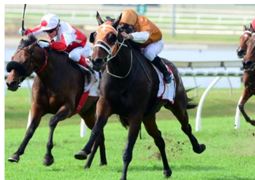
Rising Red (NZ) (Redwood)