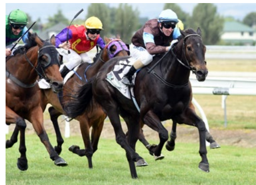
Dolcetto (NZ) (Per Incanto)

All roads will lead to the Hawke's Bay carnival for the Per Incanto five-year-old, who will resume in Saturday's Randwick Meats Handicap (1200m) at Trentham.