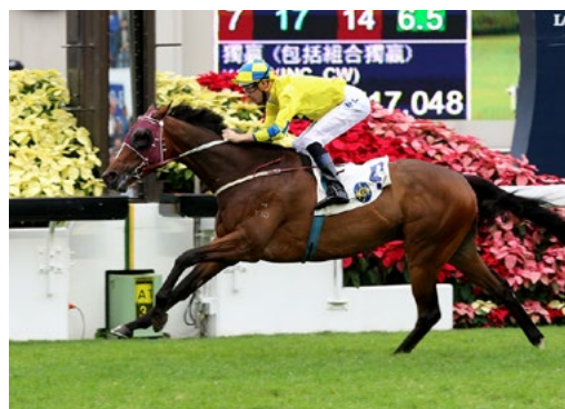
Werther (NZ) (Tavistock)

final on Saturday and he is much better off at the weights."