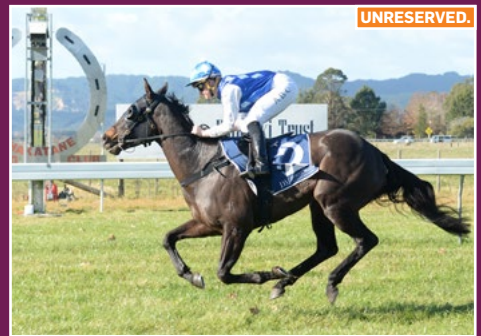
LIGHTLY RACED WINNER. WOULD SUIT SOUTH ISLAND RACING.