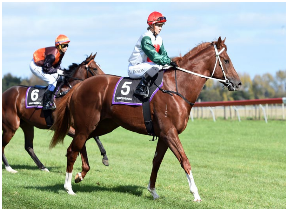
Sol Invictus will attempt to break his maiden status in Saturday's Listed Ssanyong Auckland Futurity Stakes