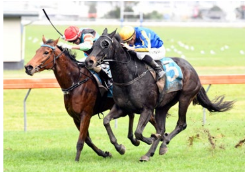
Switch In Time (NZ) (Remind)