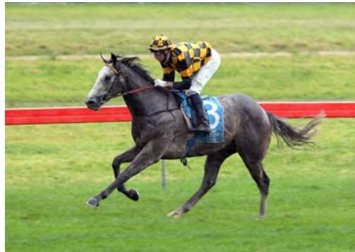
Reevederci (NZ) (Reliable Man)

They had concerns about the heavy going on Monday, but rolled the dice and the grey coasted to a debut victory in the New Zealand Bloodstock Insurance Pearl Series Race (1200m).