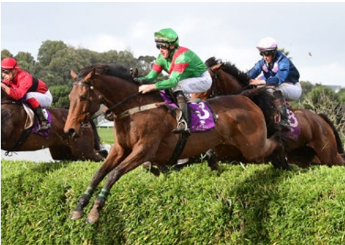
Wise Men Say (NZ) (Yamanin Vital)

However, the Wanganui farmer admits 4000m around Trentham's figure-eight steeplechase course might be a bit sharp for his jumps star.