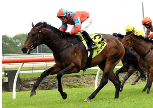
Demonetization (All Too Hard)