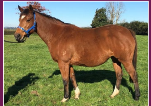
WELL-RELATED REDOUTE'S CHOICE MARE IN FOAL TO TURN ME LOOSE.