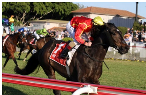
Iggi Pop (NZ) (Savabeel)