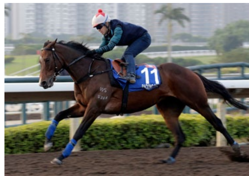
Packing Pins (NZ) (Pins)