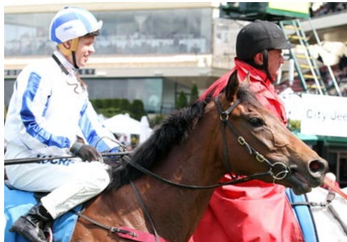
Nurse Kitchen (NZ) (Savabeel)

the New Zealand Derby, New Zealand Stakes, Ranvet Stakes and The BMW at Group One level.