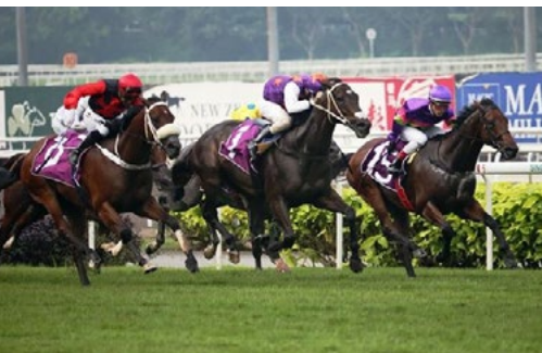
War Affair (NZ) (O'Reilly)

By High Chaparral out of an Encosta de Lago mare, Tiffany's has won five races and is a half-sister to the Gr.2 Wellington Guineas winner Neo (NZ) (One Cool Cat).