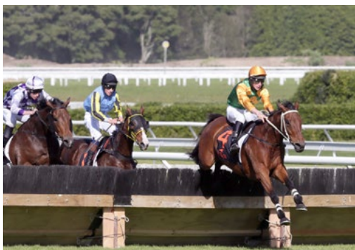
Danza Lad (NZ) (Woodbury Lad)