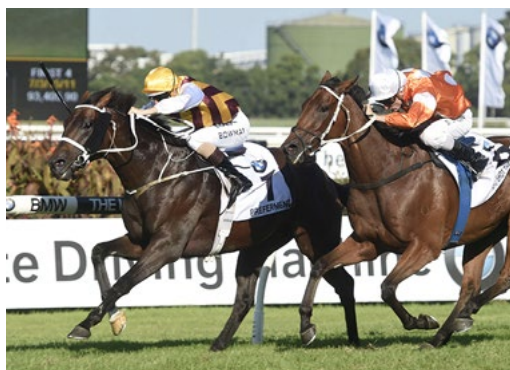
Preferment (NZ) (Zabeel)

"But I am hopeful rather than confident."