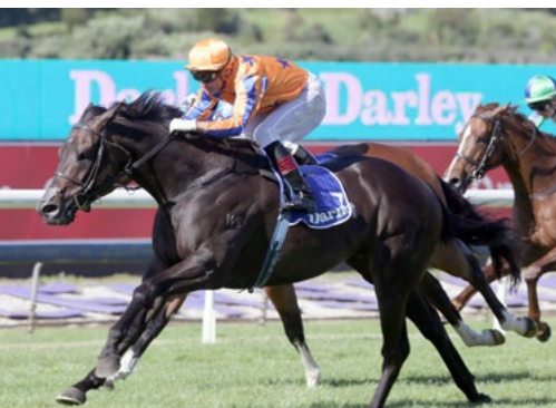
Splurge (NZ) (Savabeel)

Isn't She Elegant was purchased for $30,000 from Rich Hill Stud's 2015 NZB Select Sale draft.