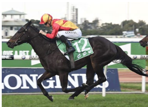
Bonny O'Reilly (NZ) (O'Reilly)

The New Zealand-bred Cylinder Beach (NZ) (Showcasing) has drawn barrier five for jockey Jim Byrne in the A$200,00 race.