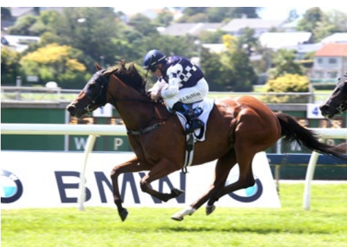
El Pistola (NZ) (El Hermano)