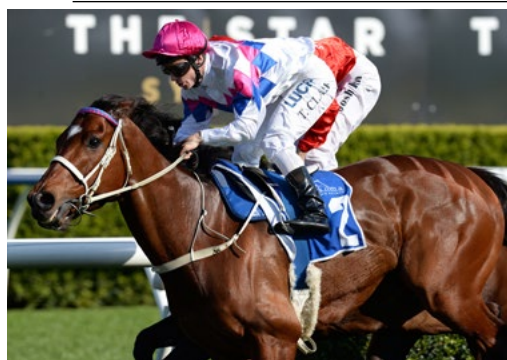
Famous Seamus (NZ) (Elusive City)