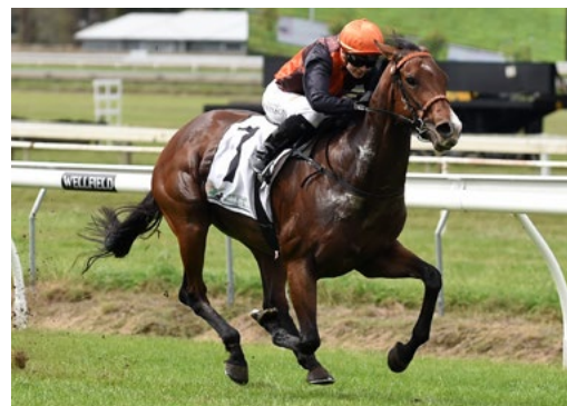
Slimline (NZ) (Castledale)