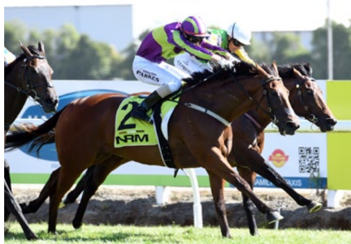
Start Wondering (NZ) (Eighth Wonder)