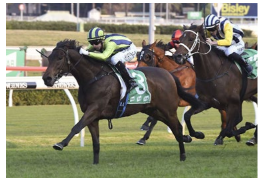
Live And Free (NZ) (Savabeel)