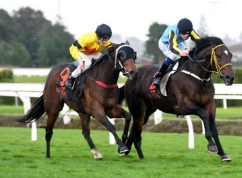
Thunder Down Under (Street Sense)