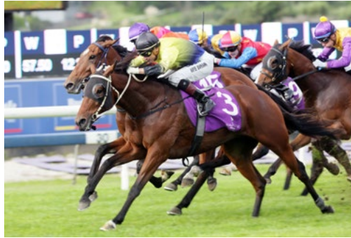
Doiknowyou (NZ) (Keeper)