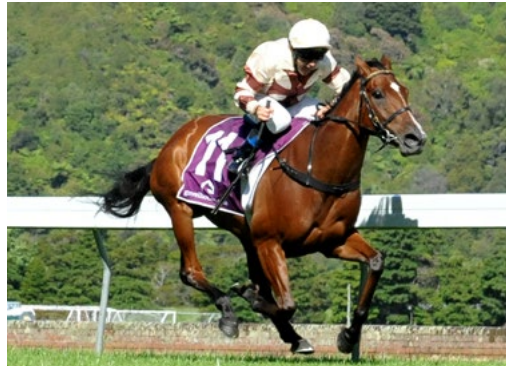
Aide Memoire (NZ) (Remind)

A likely soft track rating is expected to help