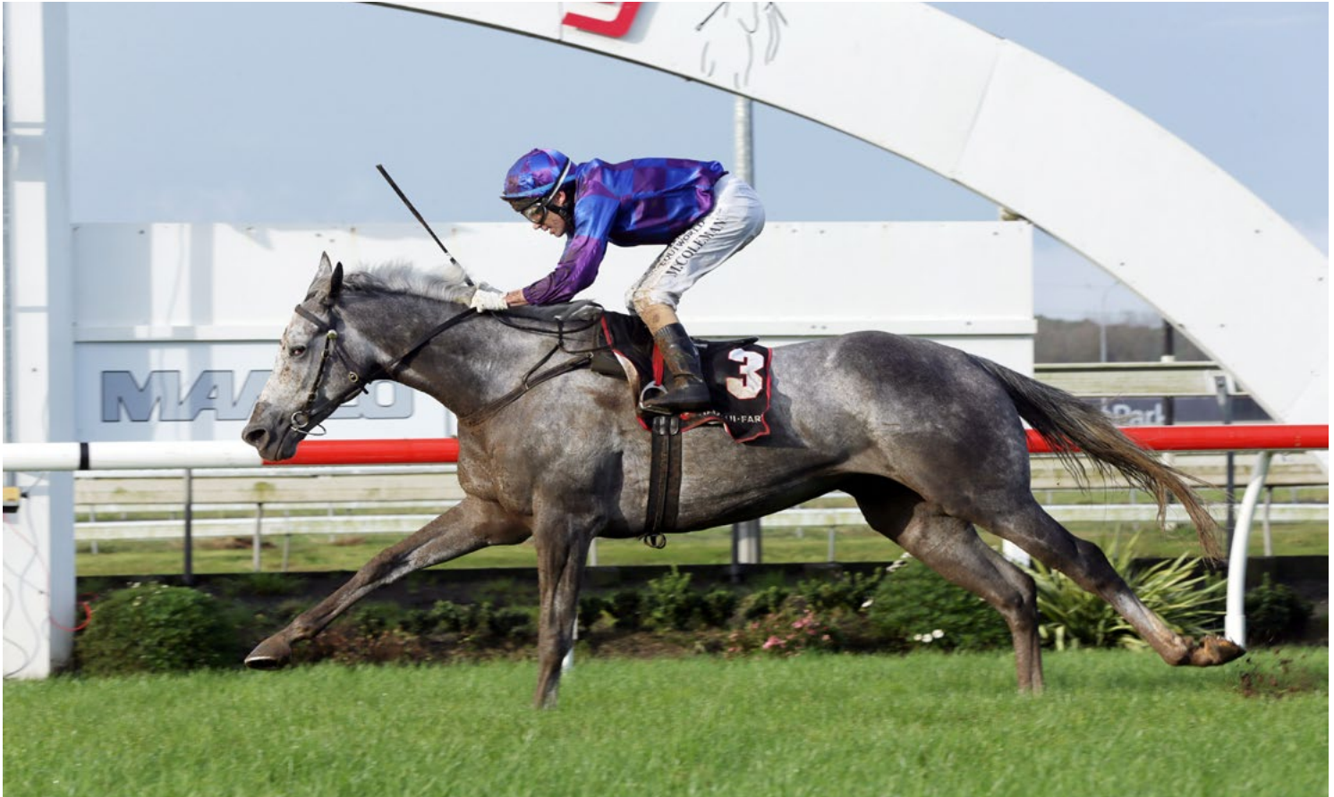
Megablast may get the wet track he needs when he races at the Sunshine Coast on Saturday