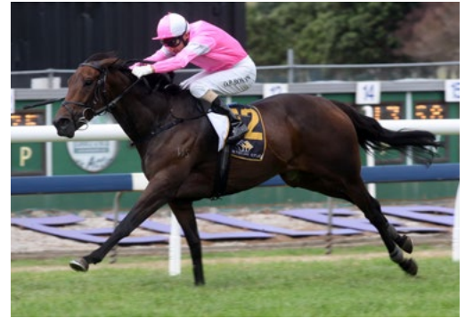
Diademe (NZ) (Savabeel)

The Savabeel mare, who has been served by Vancouver, was sold for A$1.7 million at the Gold Coast on Wednesday to the China Horse Club.