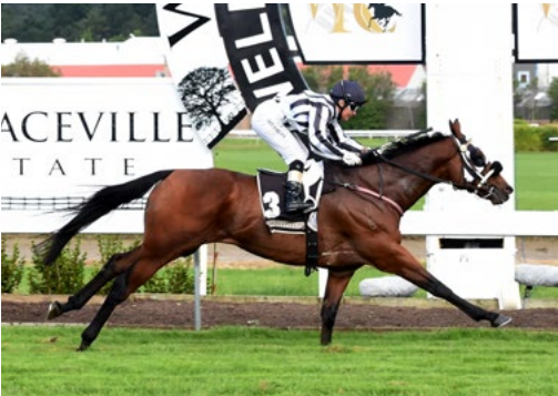
Ballybay (NZ) (Sandtrap)

The Washdyke trainer has recently taken charge of the former North Island sprinter and will know a lot more about the Sandtrap gelding after his southern debut in the Supreme Equine Feeds Handicap (1200m).