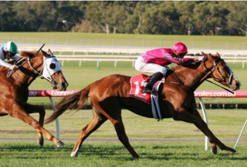
Mazzuro (NZ) (Rip Van Winkle)