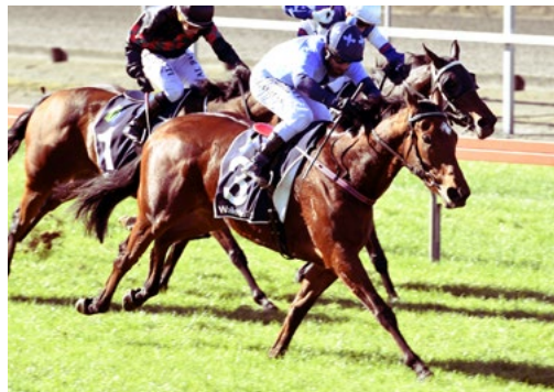
Velveteen (NZ) (Makfi)

"I think we will put him away now and we will look at next season."