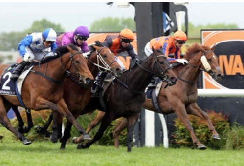
Hard Merchandize (NZ) (Burgundy)

Mazzuro finished runner-up in a maiden at Moe before he was successful over 2200m at Geelong and at Sandown on Saturday he won a A$120,000 three-year-old handicap (2100m). Full story here