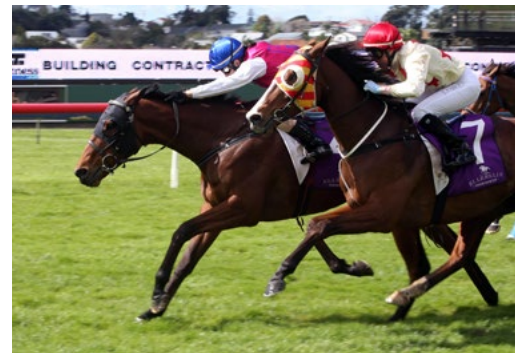
No Need (NZ) (No Excuse Needed)

The fifth and final Leg is the Golden Horseshoe (1200m) to be run on July 13.