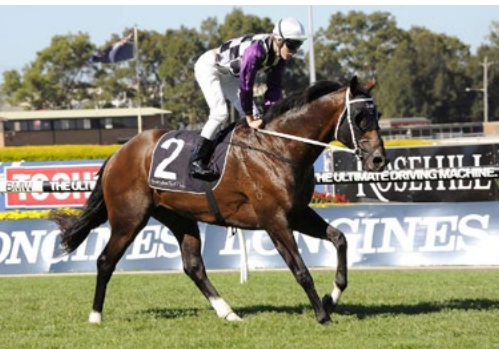
El Doute (Redoute's Choice)