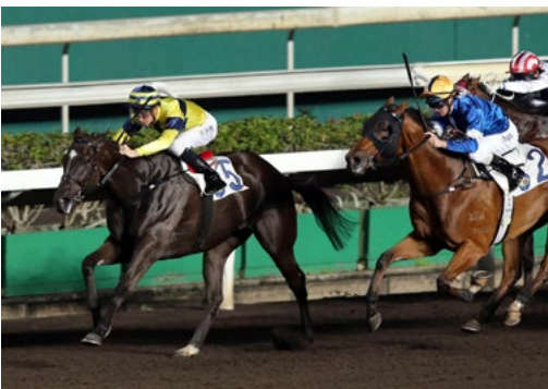
Shimmer And Shine (NZ) (Showcasing)