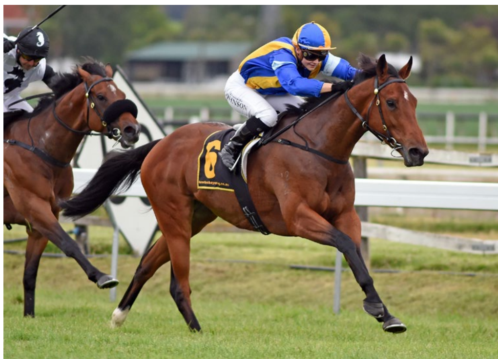
Tomelilla will strive for successive stakes victories at Wanganui tomorrow