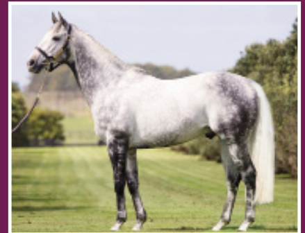
NOMINATION TO MULTIPLE GR.1 WINNER RELIABLE MAN.