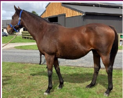
WINNER & GR. PERFORMER IN FOAL TO POWER.