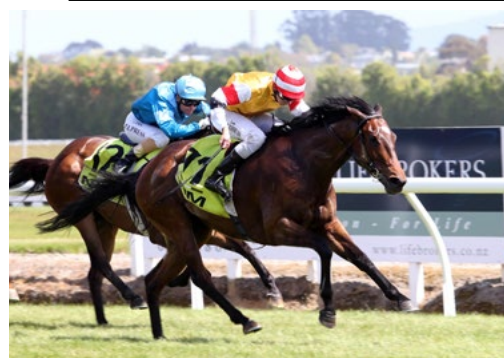
Stolen Dance (NZ) (Alamosa)