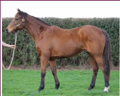
GR.2 WINNER. DAM OF TWO STAKES PERFORMERS.