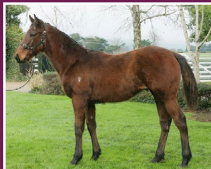
QUALITY WEANLING COLT BY YOUR SONG.