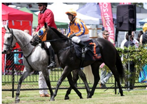
Gold Fever (NZ) (Savabeel)