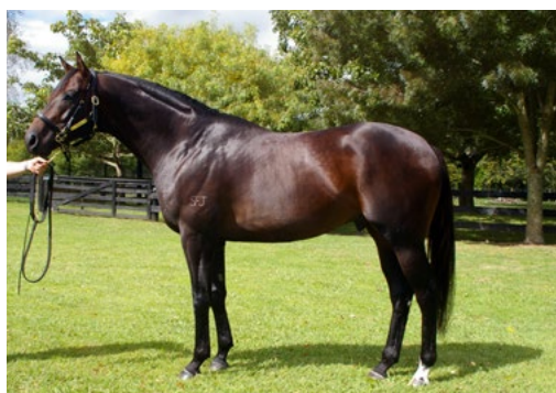
Duelled (Redoute's Choice)

Gold Fever has won three of her six starts, including the Gr.2 Matamata Breeders' Stakes and she ran third in the Gr.1 Diamond Stakes.