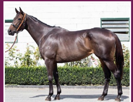
YOUNG O'REILLY MARE READY FOR EARLY SERVICE.

Featuring 49 Lots including 12 weanlings, eight yearlings, three 2YOs, two unraced horses, three raced horses, 20 broodmares, and one stallion nomination. Covering sires include Complacent, Highly Recommended, Keeper, Power, Pure Champion, Swiss Ace, and Vespa.