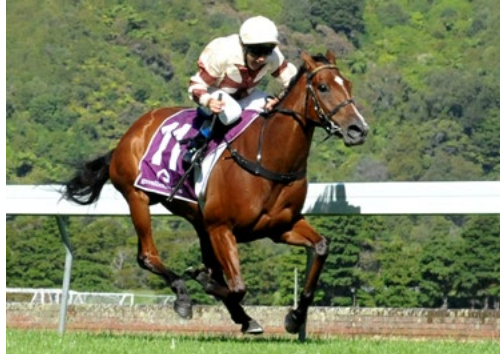
Aide Memoire (NZ) (Remind)

The Marton trainer has the lightly-raced five-year-old back in work after a lengthy spell following her breakthrough success at the top level in the Captain Cook Stakes last December.