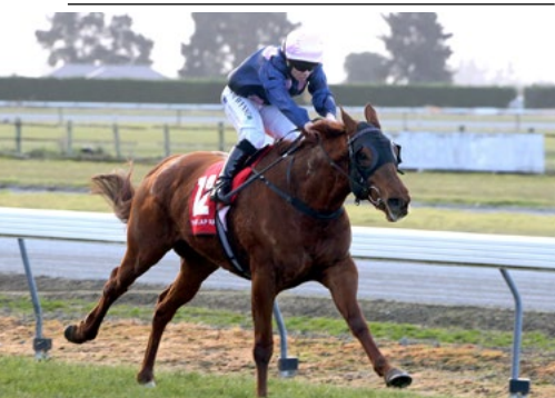
Stumblin In (NZ) (Makfi)