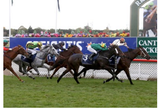
Authentic Paddy (NZ) (Howbaddouwantit)

Awapuni warhorse Authentic Paddy (NZ) (Howbaddouwantit) has returned to