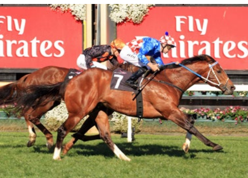
Il Cavallo (Choisir)

In a three-year agreement, the Gr.1 Al Basti Equiworld NZ 2000 Guineas held at Riccarton Park in November and the Gr.1 Al Basti Equiworld NZ Oaks at Trentham in March will be run for $500,000 and $400,000 respectively. Full story here