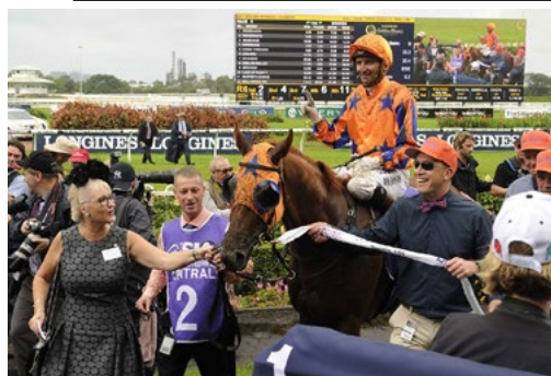
Gingernuts (NZ) (Iffraaj)

"He's raced in a couple of open handicaps and gone well but he comes up against some pretty handy ones in that race and it will be a test for him but hopefully he can be a nice lightweight chance," he said.