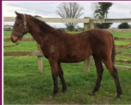
WELL-RELATED WEANLING COLT BY TAVISTOCK.