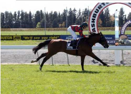
Cha Siu Bao (Smart Missile)

"Whether we go back for the 2000m (Livamol Classic) I'm just not sure yet. I don't think we've ever had him better, he's in beautiful order."