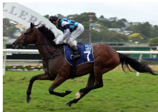
Hasselhoof (NZ) (Tavistock)

The Road To Rock gelding subsequently finished runner-up in the Gr.2 Rich Hill Mile before he won the Gr.2 Japan-New Zealand International Trophy. His last appearance resulted in a close sixth in the Gr.2 Easter Stakes.