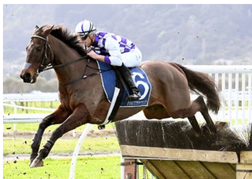
Fast Catch (NZ) (Faltaat)

"Fillies like this only come around every couple of years and I think she is top class," he said.