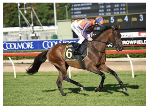
Chance To Dance (Teofilo)