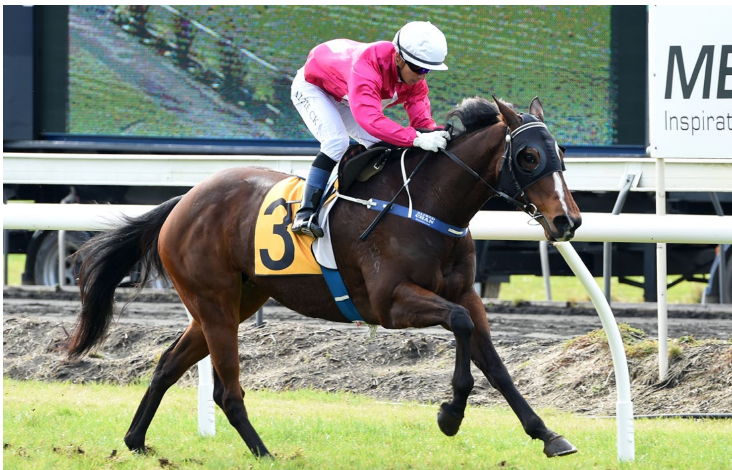
Katie McKeen will have her final career start in the Listed Woods Contracting Taumarunui Gold Cup at Rotorua