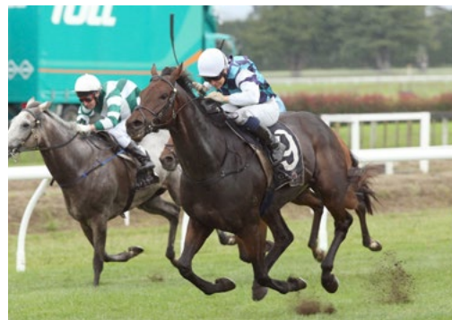
All Roads (NZ) (Road To Rock)

The progressive five-year-old has enjoyed