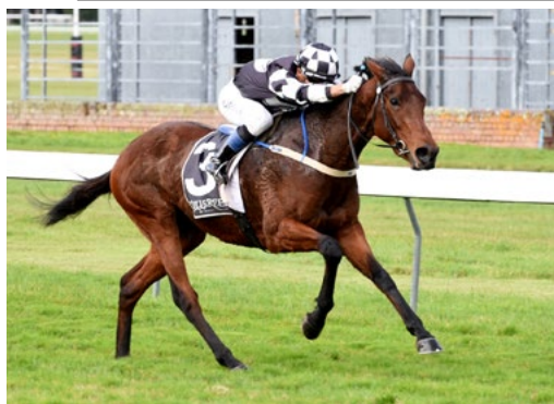
Gypsy Fair (NZ) (Falkirk)