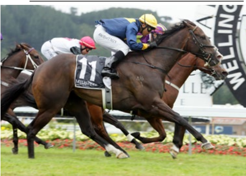
Signify (NZ) (Perfectly Ready)