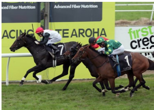
Perfect Fit (NZ) (Elusive City)