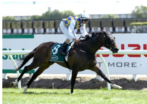
Fanatic (NZ) (Shocking)