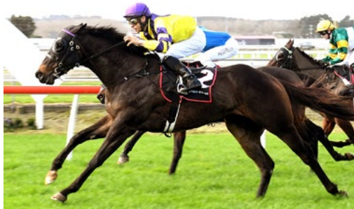
Manhattan Flame (Manhattan Rain)