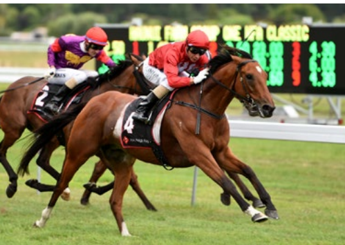
Volkstok'n'barrell (NZ) (Tavistock)

Last year's Captain Cook Stakes at Trentham had loomed as Rasa Lila's big opportunity to break through at the highest level, only to have it snatched away days before the event. Full story here