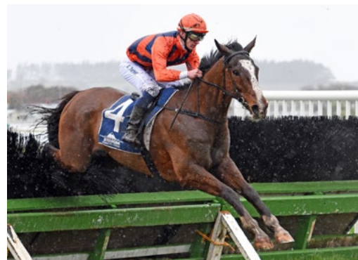
The Fox (NZ) (Desert Fox)