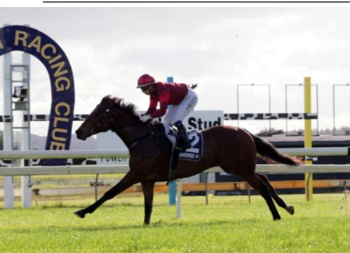
Kaharau (Ad Valorem)

The Listed Haunui Farm Karaka Classic at Pukekohe in September is being eyed as Chance To Dance's only appearance before the Gr.1 Livamol Classic at Hastings on October 7. Full story here