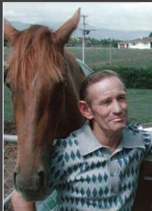
CLICK TO PLAY