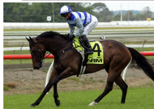
Cote D'Or (NZ) (Makfi)