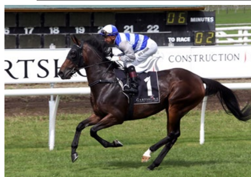
Wildflower (NZ) (Keeper)