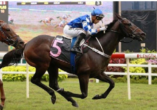
Song To The Moon (NZ) (Savabeel)