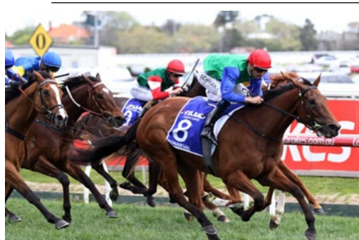
Bonneval (NZ) (Makfi)