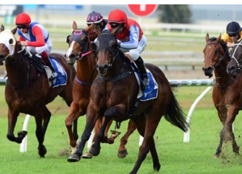
Gold Ambition (NZ) (Savabeel)

The consistent galloper has now won eight of his 20 starts. Full story here