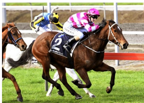
Imblaze (NZ) (Battle Paint)

"He will improve. He's not top class, but hopefully we can get him to the city and build on that win today."