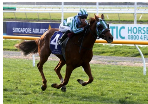
Son Of Zac (NZ) (Zacinto)