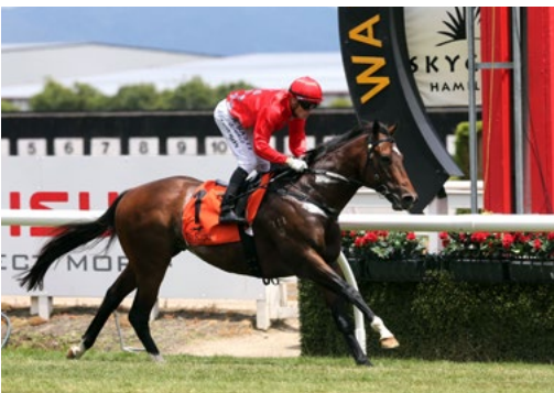
Ferrando (NZ) (Fast 'N' Famous)