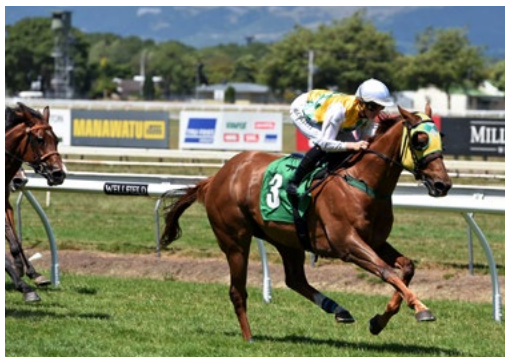
Shadows Cast (NZ) (Per Incanto)

The Awapuni trainer has entered his stakes winner in both the Gr.1 Tazino