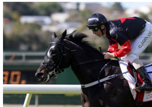
Gentil Tonton (Yeats)