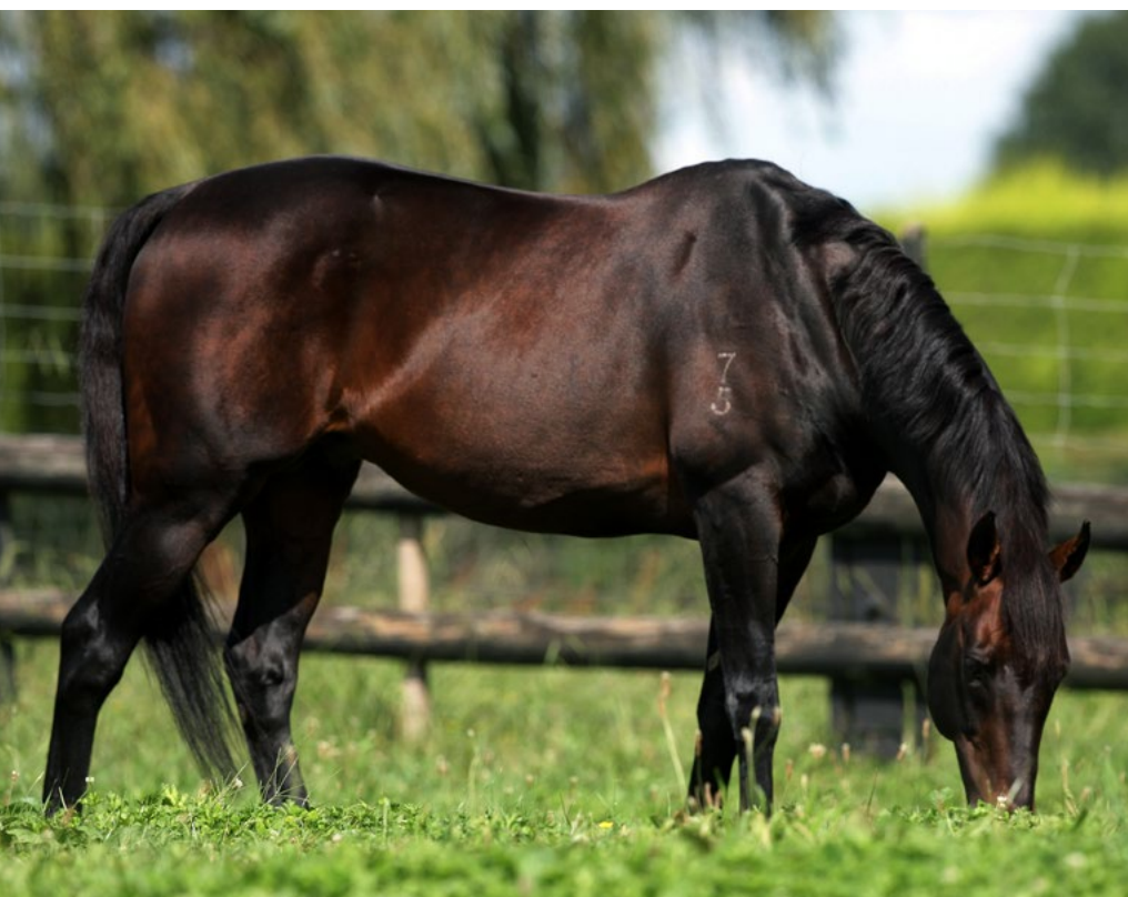
Cambridge Stud stallion Tavistock was represented by impressive winner Tavisan at Cranbourne on Thursday