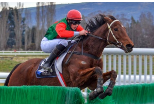
Go Go Gonzo (NZ) (Golan)

"He's trotting five minutes a day on the treadmill and we'd expect him to be racing around Anniversary time next year."