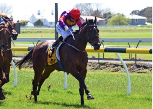
Sensible Princess (NZ) (Street Sense)