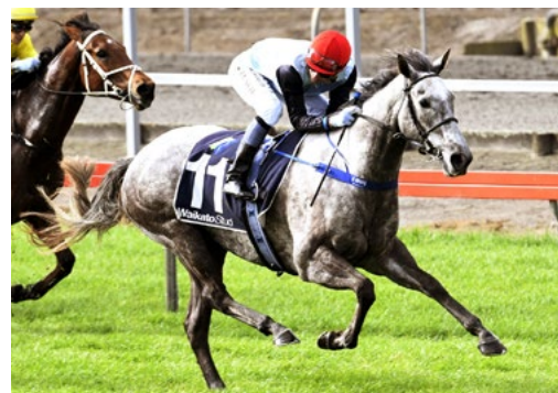
Fly To The Moon (NZ) (Reliable Man)

Connections believe Fly To The Moon (NZ) (Reliable Man) is a filly to follow