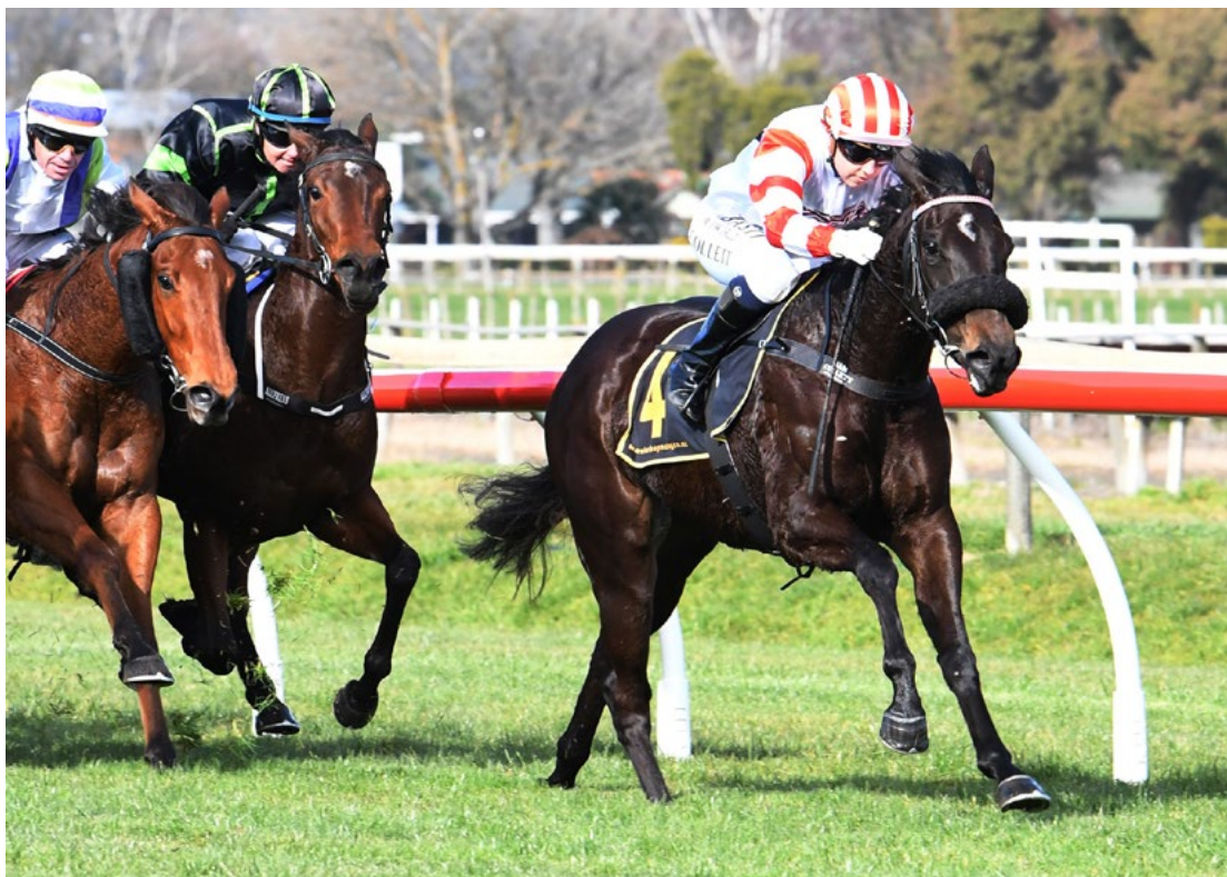
Eastern Warrior will start one of the favourites in Saturday's Listed Ryder Stakes at Awapuni

"She'd lightened up a bit with the trip and she's not a big filly anyway but she's been eating and her trackwork on her own on Wednesday was good. She's