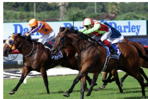
Julius (NZ) (Swiss Ace)