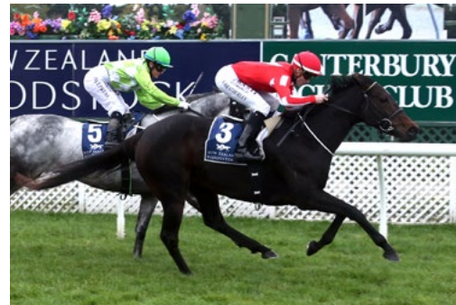
Elfee (NZ) (Iffraaj)