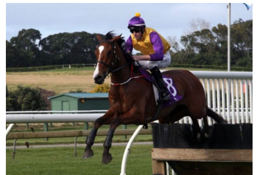
Monarch Chimes (NZ) (Shinko King)