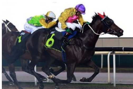
Clarton Treasure (NZ) (Guillotine)