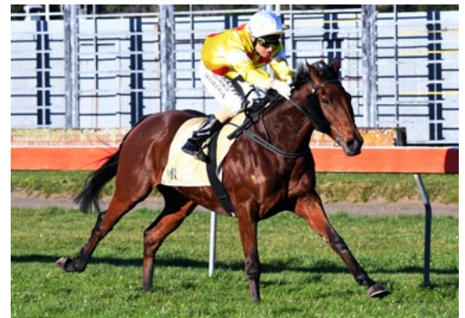
El Luchador (NZ) (El Hermano)