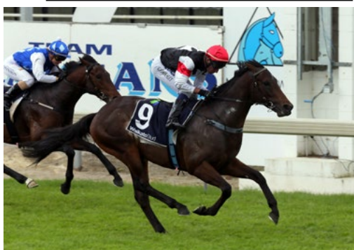
Ali Baba (NZ) (Savabeel)

"He would probably run in the Captain Cook Stakes and go back to Christchurch for the Coupland's," he said.