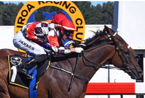
Wait A Sec (NZ) (Postponed)