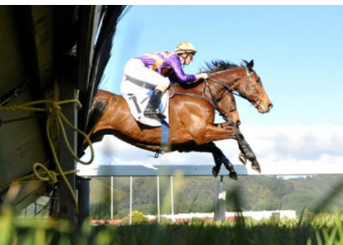
Sea King (NZ) (Shinko King)