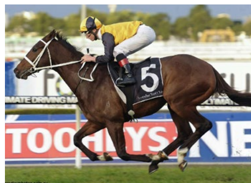
Marenostro (NZ) (Duelled)

"He will have a freshen-up after Saturday and we will look at some races for him in the spring from 1600 to 2000 metres."