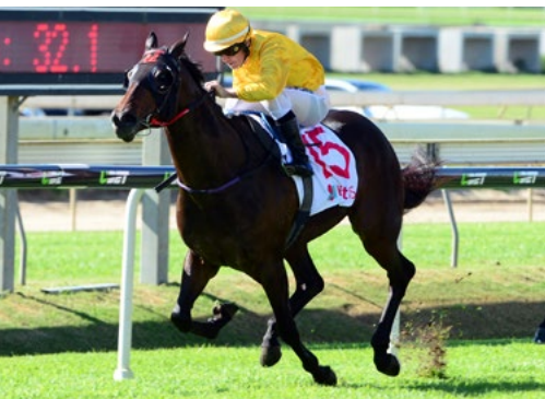
Cruising Speed (NZ) (Savabeel)