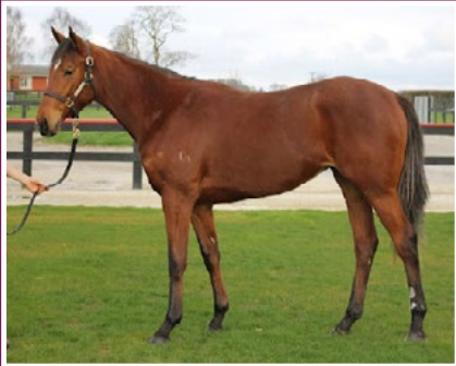
BROKEN IN YEARLING FILLY BY CAPE BLANCO.