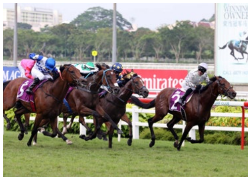
Alibi (NZ) (Darci Brahma)

The Showcasing filly was successful in this season's Listed New Zealand Bloodstock Airfreight Stakes and she also earned black type placings in the Gore and Dunedin Guineas and the New Zealand Bloodstock Warstep Stakes.