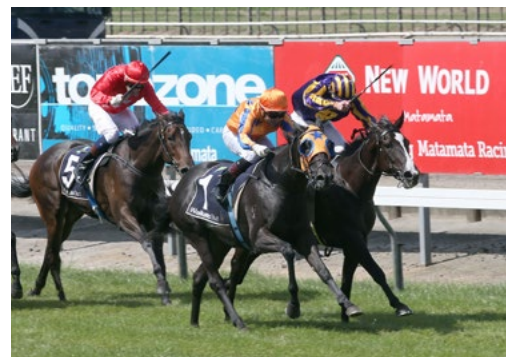
Gold Fever (NZ) (Savabeel)