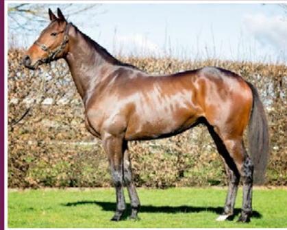
LIGHTLY RACED GELDING BY MAKFI. TWICE PLACED.