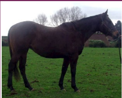
WELL-RELATED WINNING MARE. DAM OF FIVE WINNERS.