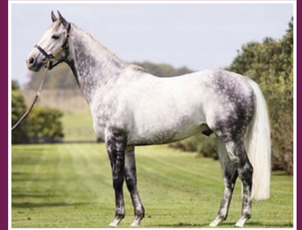
NOMINATION TO MULTIPLE GR.1 WINNER RELIABLE MAN.