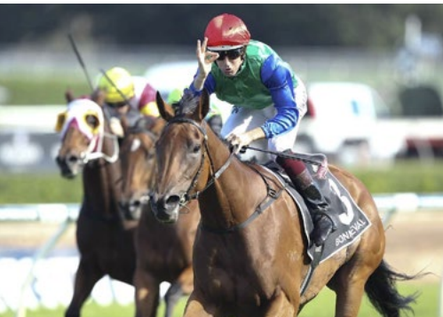
Bonneval (NZ) (Makfi)