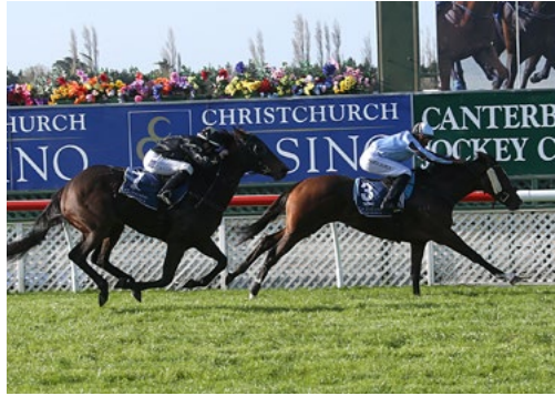
Showmup (NZ) (Showcasing)