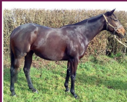
WELL-RELATED YOUNG MARE BY DARCI BRAHMA.