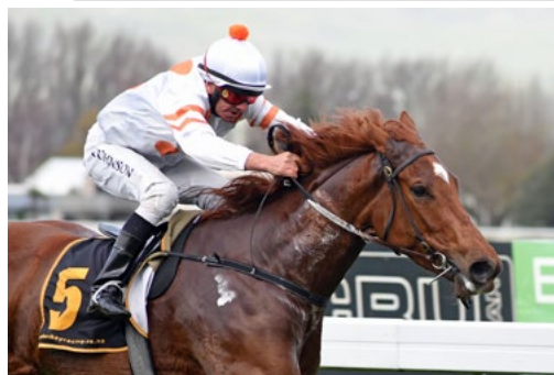
Astor (NZ) (Iffraaj)

Addictive Nature is a brother to the Australian Group Two winner and Group One placegetter Savvy Nature (NZ).