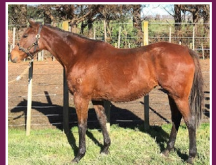
ZABEEL MARE. DAM OF TWO WINNERS.

Featuring 33 Lots including three weanlings, four yearlings, one 2YO, one unraced horse, nine raced horses, 14 broodmares, and one stallion nomination. Covering sires include Complacent, and Pure Champion.