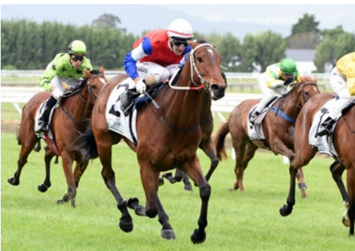
High Quality (NZ) (Handsome Ransom)