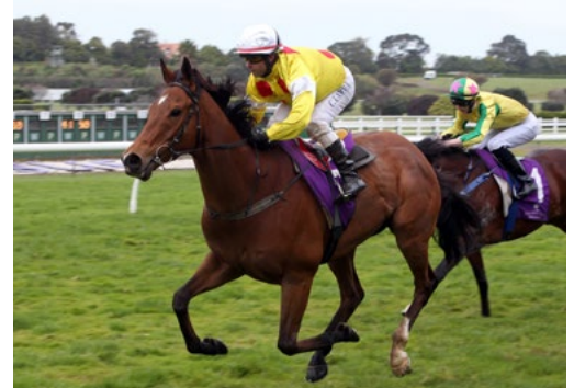
El Pescado (NZ) (El Hermano)