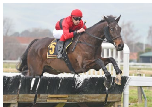
The Shackler (NZ) (Istidaad)