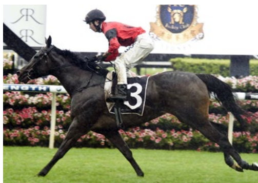
La (Bella) Diosa (NZ) (So You Think)