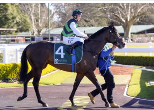
Addictive Nature (NZ) (Savabeel)

"He's a good hurdler, but he likes the tempo of a steeple. He's quite a slow horse that's got a lot of stamina, but they'll be too dashing for him I'd think."