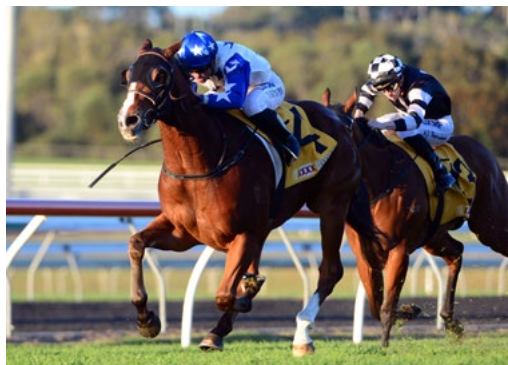
Crack Me Up (NZ) (Mossman)