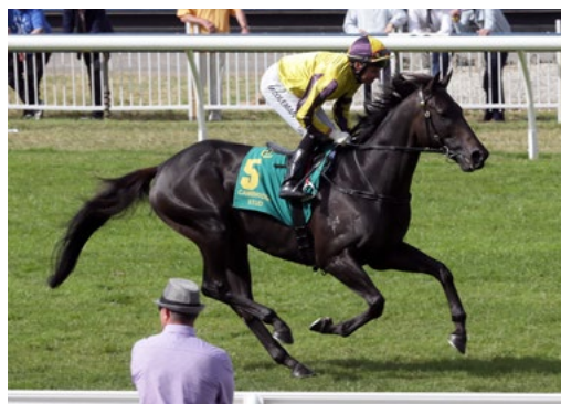
Sound Proposition (NZ) (Savabeel)