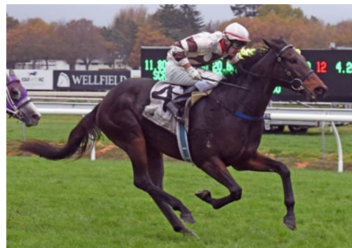
Detentore (NZ) (Keeper)