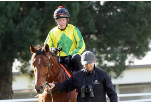
Close Up (NZ) (Shinko King)