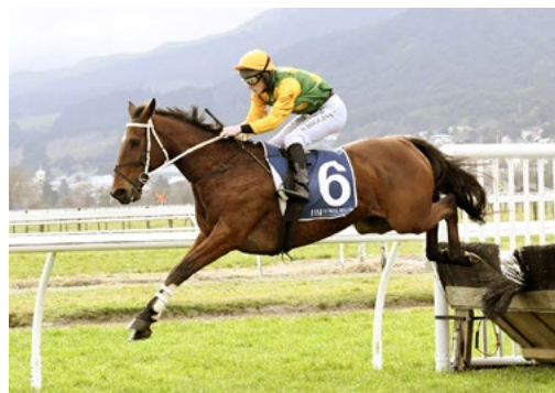
Banbury Lad (NZ) (Woodbury Lad)

successful jumping debut at Te Aroha on Wednesday with a dashing front-running victory in The Dentist Morrinsville Hurdle (3100m).