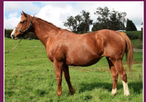
WELL-RELATED RAHY MARE IN FOAL TO TAVISTOCK.