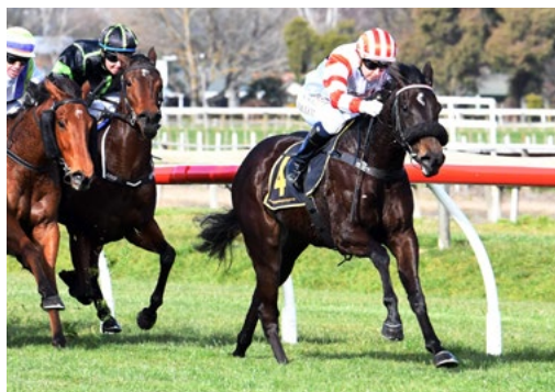
Eastern Warrior (NZ) (Shamoline Warrior)