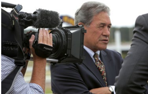
The Right Honourable Winston Peters