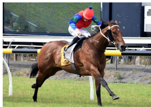
Culzean (Duke Of Marmalade)

"He'll surface at the trials at Foxton on August 1 and he'll probably kick off at Waverley on the 18th, all going well, and then we'll make a plan from there. I don't think he'll have any problem getting up to 2000m this time around."