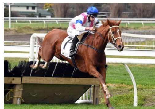
Iffitel (NZ) (Iffraaj)

"I've got a lot of nice two and three-year-olds coming up and I think Casaquinman, Handfull and Bring to The Block are all genuine carnival horses as well," Brown said.