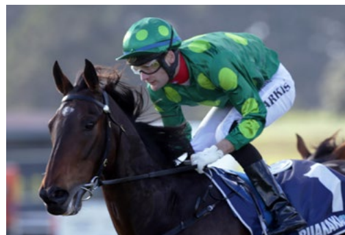
Hiflyer (NZ) (Tavistock)

"He's come through that run really well,"