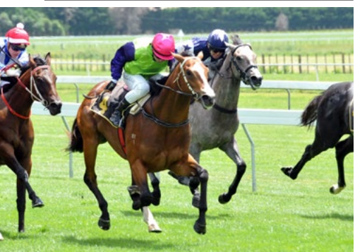
Longchamp (NZ) (Tavistock)