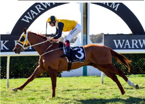
Star Of Seas (NZ) (Ocean Park)

"He missed the start and still won. We'll play it by ear, but I think he'll go through the grades." Full story here