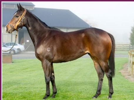
RECENTLY RETIRED FILLY. JUVENILE WINNER BY O'REILLY.