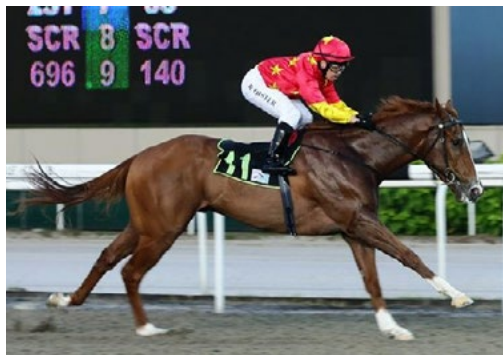
Skywalk (NZ) (Battle Paint)