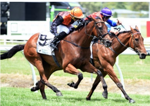
Jacksstar (NZ) (Zed)