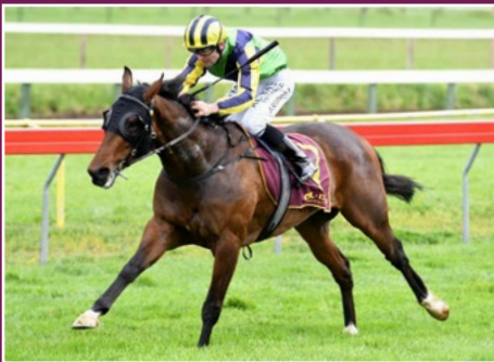
LAST START WINNER BY TAVISTOCK IN FULL WORK.