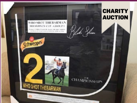
WHO SHOT THE BARMAN'S SIGNED SYDNEY CUP SADDLECLOTH.

Featuring 53 Lots including weanlings, yearlings, tried and untried racing stock, broodmares and a nomination to Shocking.