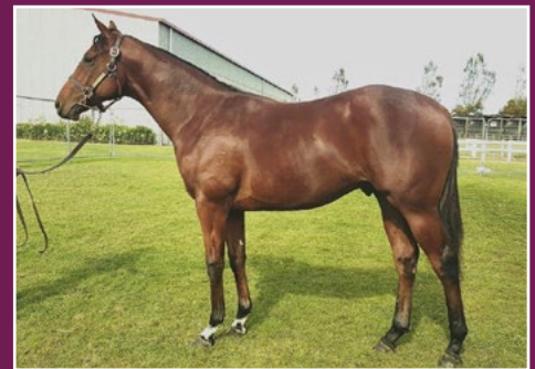
HIGHLY RECOMMENDED COLT.