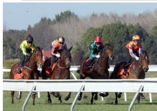
Melody Belle (NZ) (Commands)

"He's a bit of a thinker and I've been hoping hurdling would keep him entertained and it looks like it has."