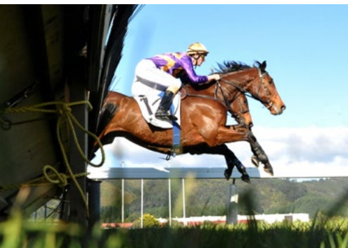
Sea King (NZ) (Shinko King)