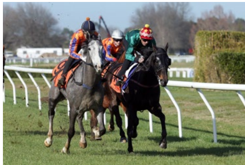
Magnum (NZ) (Per Incanto)