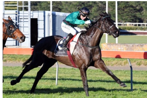
Dez (NZ) (Zed)