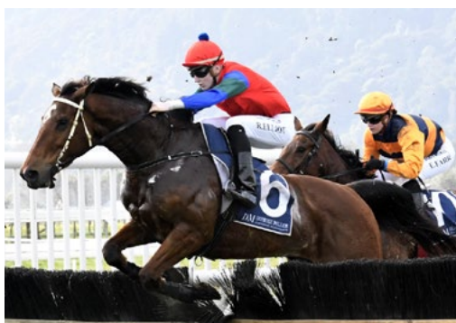
Suffice To Say (NZ) (Sufficient)