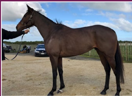
RECENTLY RETIRED DUAL WINNER READY FOR AN EARLY SERVICE.