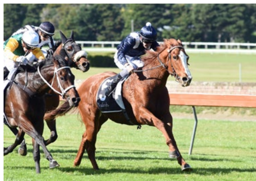
Rayas (NZ) (Rip Van Winkle)