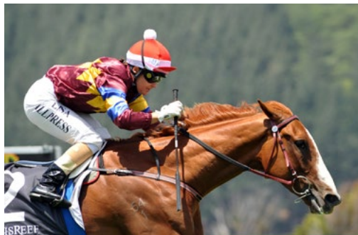
Pentathlon (NZ) (Pentire)