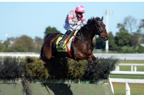
The Oysterman (NZ) (Yamanin Vital)