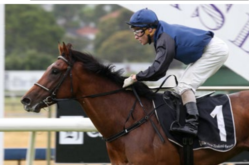
Manolo Blahniq (NZ) (Jimmy Choux)