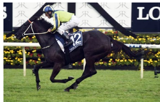
Lucia Valentina (NZ) (Savabeel)

The Makybe Diva Stakes (1600m) is on September 10.