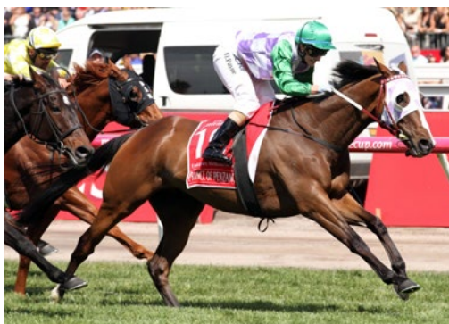
Prince Of Penzance (NZ) (Pentire)