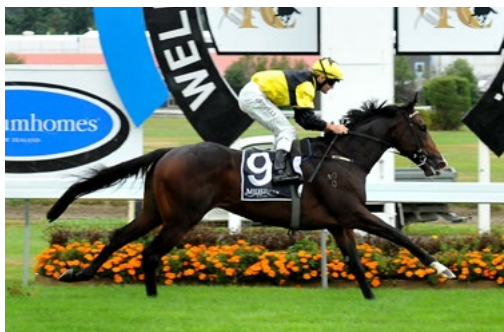
The Bold One (NZ) (Fastnet Rock)

"He's had a couple of little run alongs and everything is going to plan, but he is