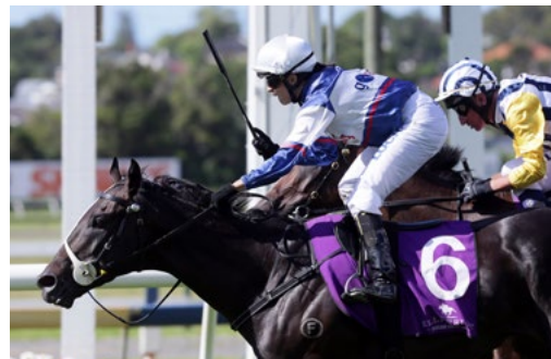
What's The Story (NZ) (Savabeel)

impressive debut winner at Wanganui last month with an effort that has attracted interest. Full story here