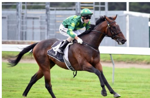
Hiflyer (NZ) (Tavistock)