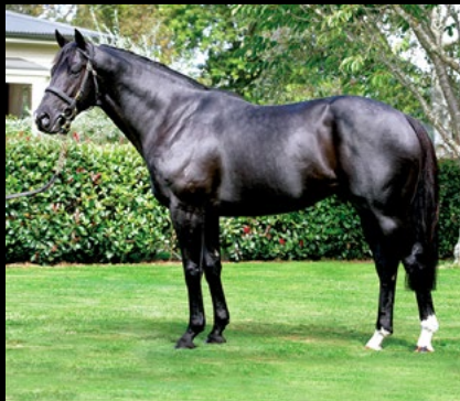
PERFECTLY READY (Aus) More Than Ready - Elle Duccio, Danehill

One of New Zealand's proven Group I sires, leaving winners worldwide.