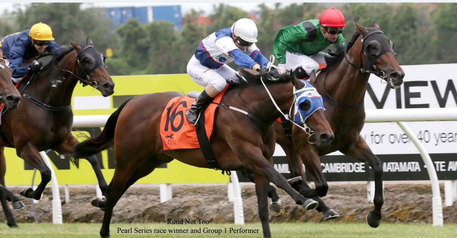
Ruud Not Too Pearl Series race winner and Group 1 Performer

“Recognising the importance of supporting fillies and mares racing and fostering the breeding stock of the future.”