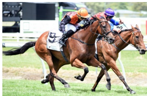
Jacksstar (NZ) (Zed)

going to come up too quickly. "It makes sense to go to Sydney. It's very tempting and a trip over there and a good look around would really help to furnish the horse." Full story here.