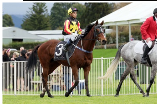
Art Deco (NZ) (Road To Rock)

"We were looking at going to the Foxbridge Plate and then the first day of the Hastings carnival, but they are probably