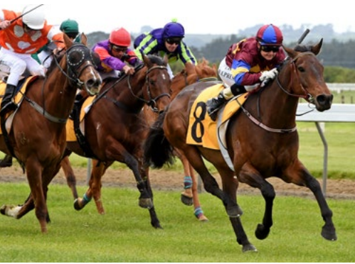
My Diamantine (NZ) (Eighth Wonder)