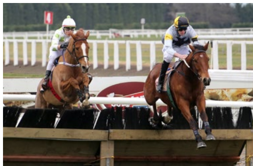
Coolibah (NZ) (Istidaad)

"We would be worried about giving him too many starts on firm ground." Full story here