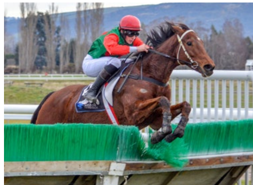
Go Go Gonzo (NZ) (Golan)

A New Zealand Bloodstock sale graduate, Marenostro was purchased out of Dormello Stud's 2011 weanling sale draft by Cambridge bloodstock agent Phill Cataldo for $20,000.