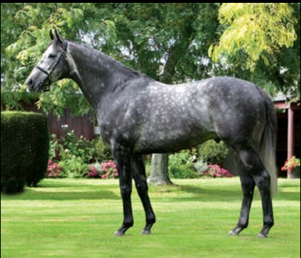
DALGHAR (Fr) Anabaa - Daltawa, Miswaki

Exciting young sire. Huge Karaka Sales series, selling up to $220,000 & overall sales average of $53,000.