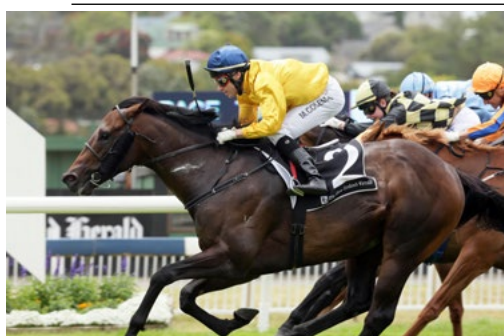
Savile Row (NZ) (Makfi)

Kawi, who is currently tied on six of the best with Mr Tiz (Bletchingly) and Sir Slick (NZ) (Volksraad), will have early opportunities to move on to even terms with the former two-time Horse of the Year at the Hawke's Bay carnival. Full story here.