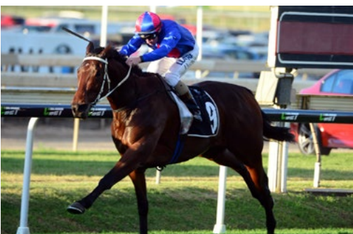
Chocante (NZ) (Shocking)