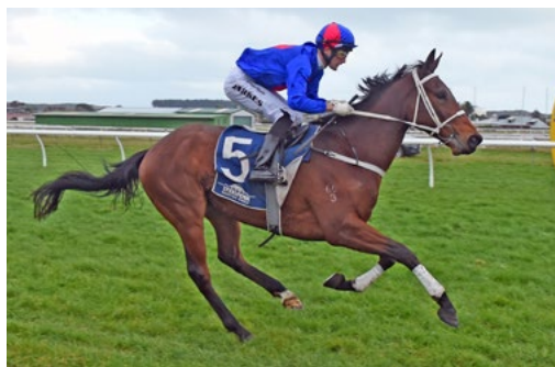
Hermanito (NZ) (Shocking)