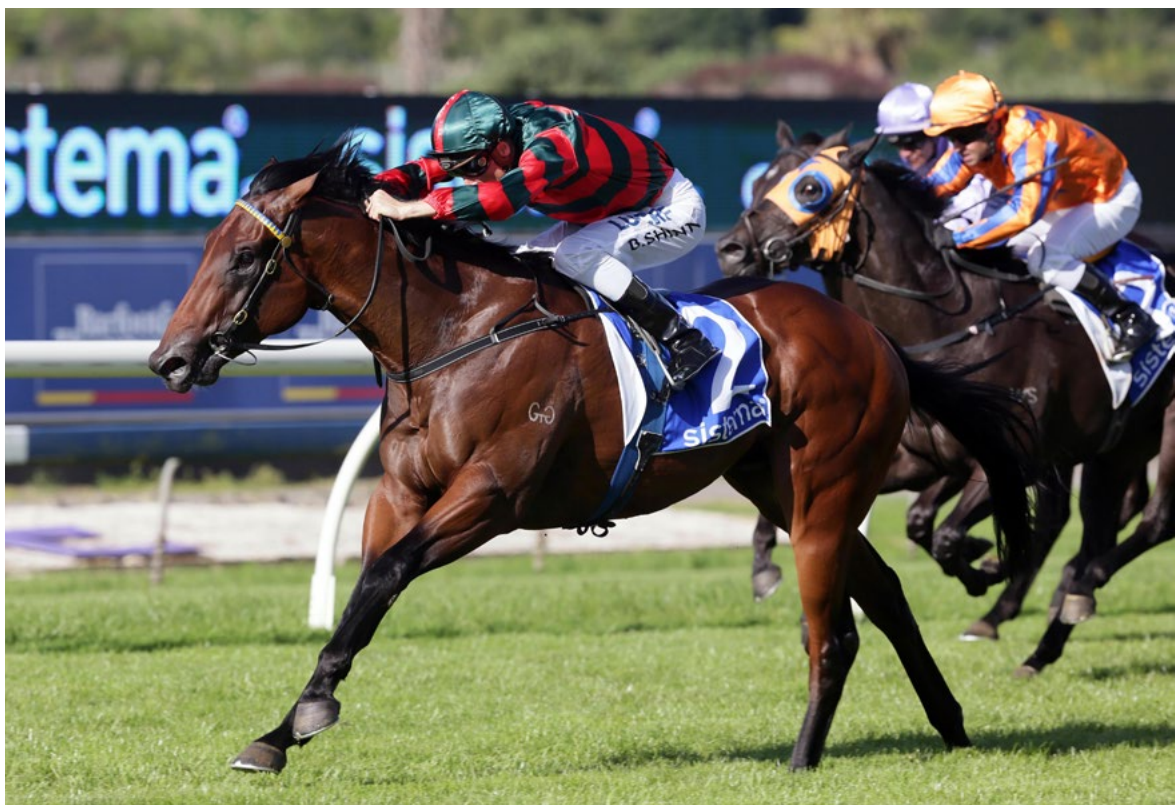
Group One Sistema Stakes winner Summer Passage is on target for a planned Australian campaign to kick-off his three-year-old career