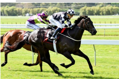
Kawi (NZ) (Savabeel)

Jacksstar won the Gr.3 Manawatu Cup during his last preparation and also placed in the Gr.2 Wellington Cup and the Listed Marton Cup before his brave effort at Ellerslie in the autumn.