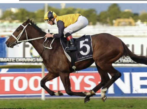
Marenostro (NZ) (Duelled)