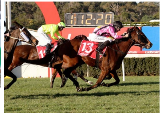
I Boogi (NZ) (Iffraaj)