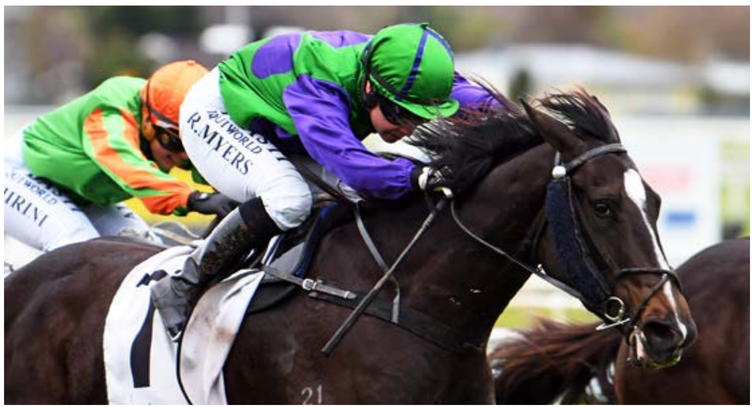
Back In A Flash impressively retained her unbeaten record when victorious at Awapuni

ack In A Flash (NZ) (Ekraar) maintained the perfect start to her career with a dashing display at Awapuni. The good-looking daughter of Ekraar went into the Rangitikei Tyre Centre 3YO (1200m) off the back of a debut win at Te Teko and she retained her unbeaten status on Saturday courtesy of a powerful late finishing run.