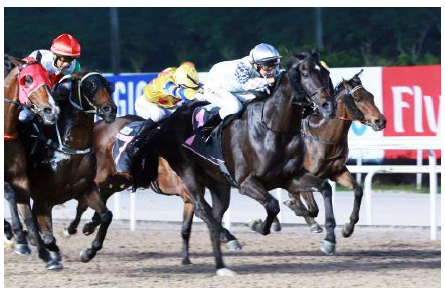
Arhat hangs on to score at Kranji (Singapore Turf Club)