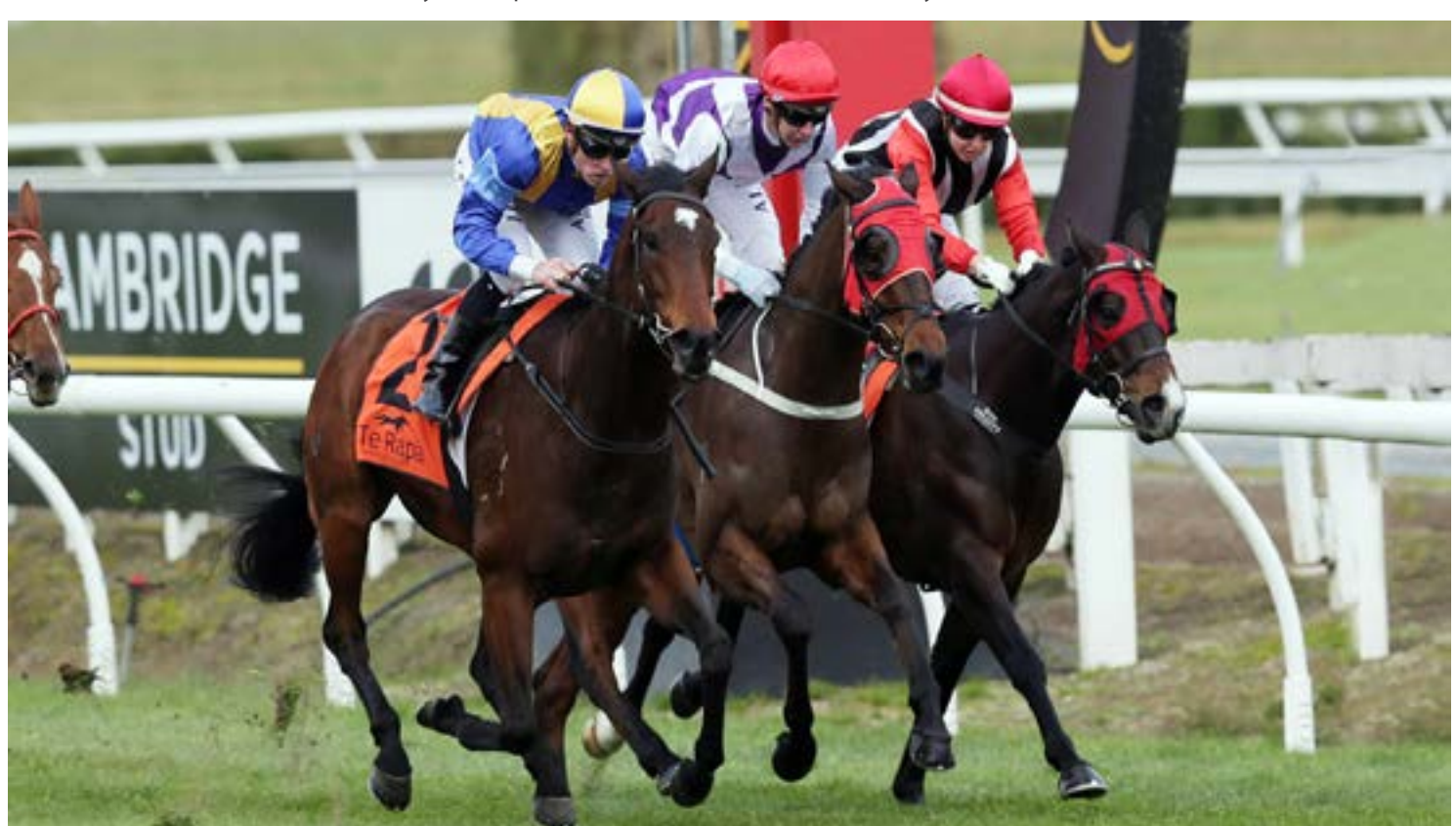
Ambitious Winner (outer) downs Temple Tiger and Stradivarius (rails) (Trish Dunell)