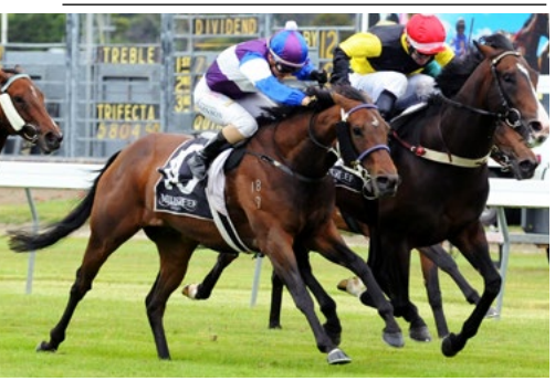
Cassie Anne (NZ) (Castelli)

Almost $200,000 was traded last night with sales still being made after the auction. Click here to view the results. Entries are now being taken for the site's next sale, to be held on 25 July.