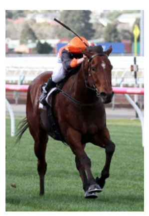
Pin Your Hopes (NZ) (Pins)

Pin Your Hopes (NZ) (Pins) is set to race on a quick back up at Caulfield, with connections hoping his recent return to