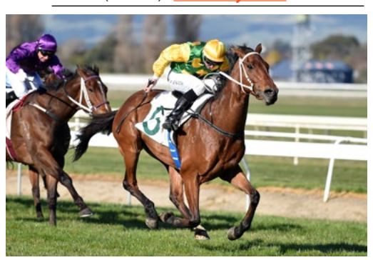
Danza Lad (NZ) (Woodbury Lad)

old Bally Heights (NZ) (Lord Ballina) in Saturday's Animal Health Direct Hawke's Bay Steeplechase (4800m) as he attempts to become the first trainer to win the race on more than three occasions, while San Pedro (NZ) (Colombia) and Ooee (NZ) (Ruff Nipper) give him a strong hand in the Hurdle (3100m). Full story here.