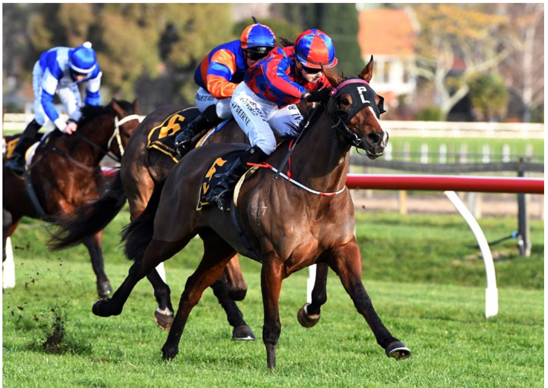
Size no issue to smart mare Red Sierra