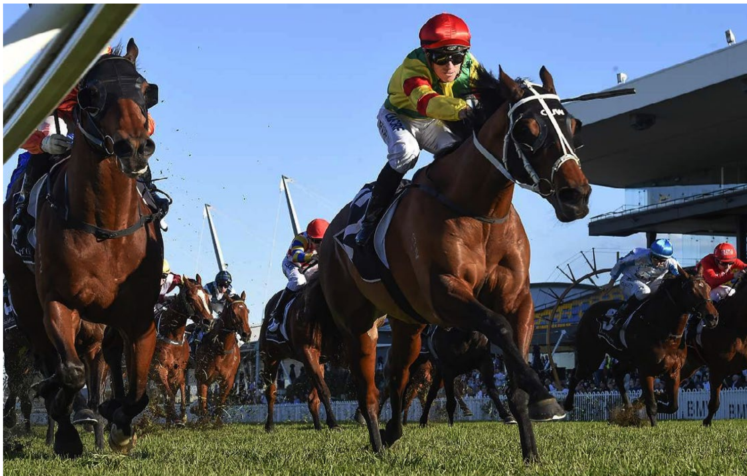
Liapari scored an upset win to take out the Listed Civic Stakes at Rosehill

A solid pace over a distance short of his best has been the catalyst for Liapari's (NZ) (Nom Du Jeu) return to the winner's circle in the Listed Civic Stakes (1350m) at Rosehill.