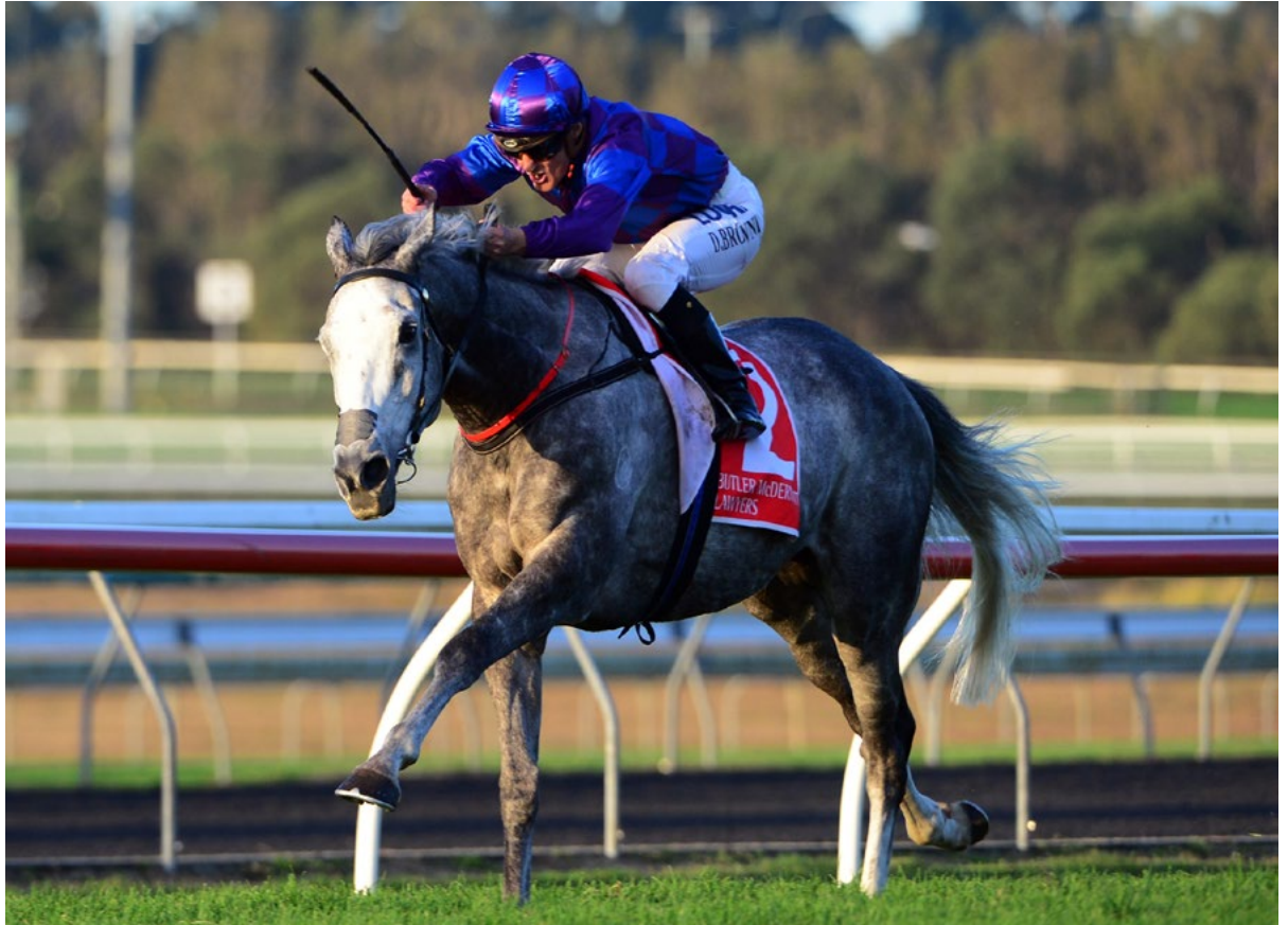
Megablast completed a NZ-bred feature race double winning the Listed Caloundra Cup (Grant Peters)