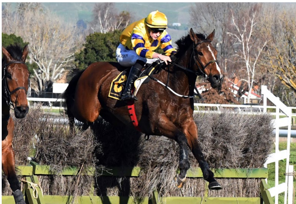
Brave Hawke's Bay Steeplechase winner Justa Charlie