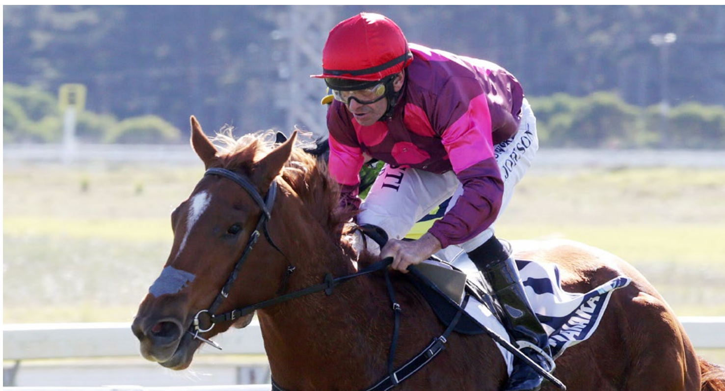
Stakes targets await Ruakaka winner Hapi Ella