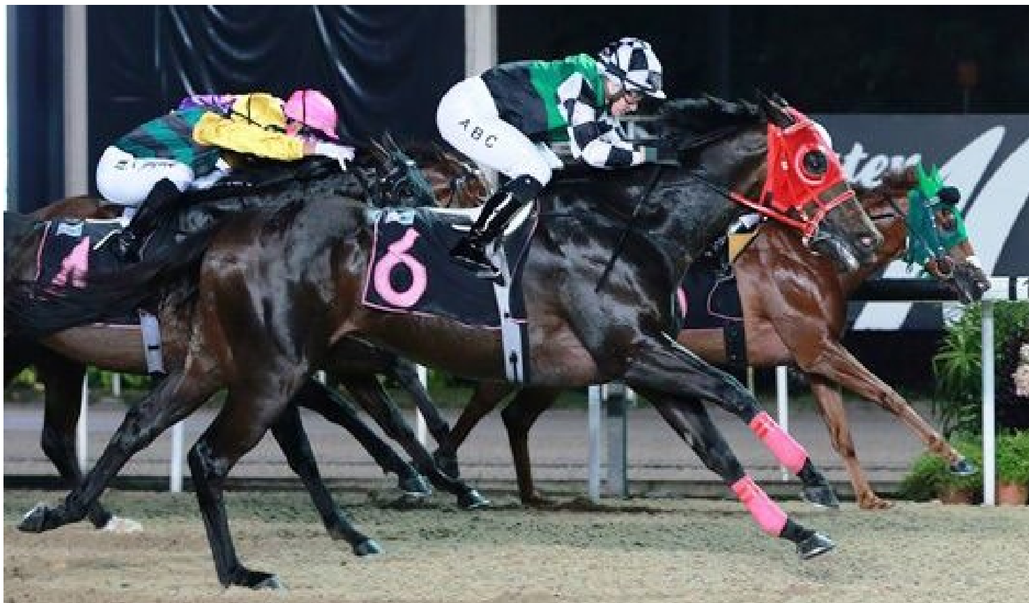
Lord O'Reilly and Alysha Collett storm home to upstage favourite Yulong Xiongyin (STC)

Lord O'Reilly (NZ) (O'Reilly) showed that his lacklustre run in the Singapore Guineas was nothing more than just a blip after he bounced back to his best with a pulsating win in the S$80,000 Class 3 race over 1000m on Polytrack on Friday night.