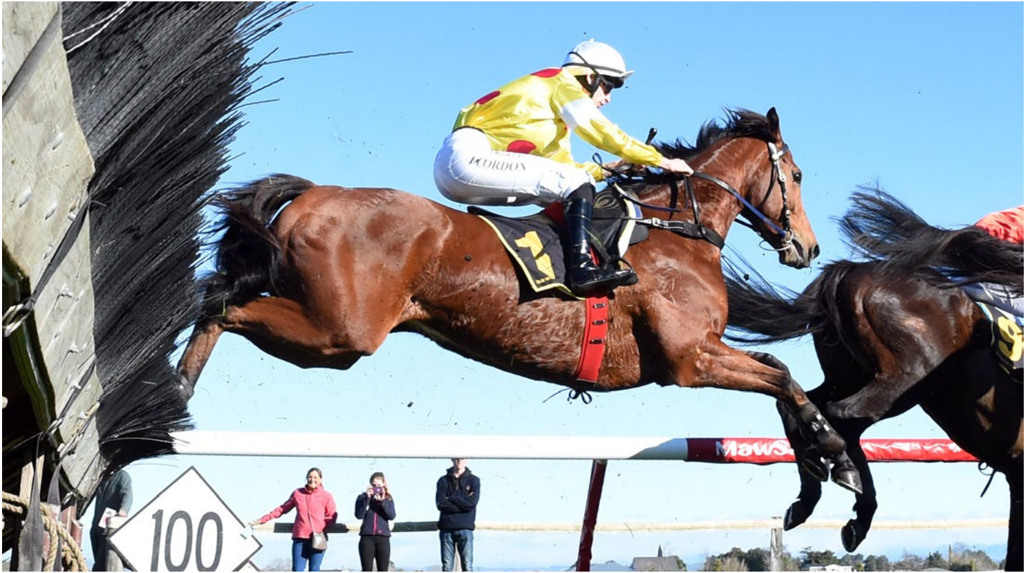
Schweppes Great Northern Hurdles (4150m) on radar for El Disparo

E l Disparo (NZ) (El Hermano) added serious momentum to his jumping career at Hawke's Bay.