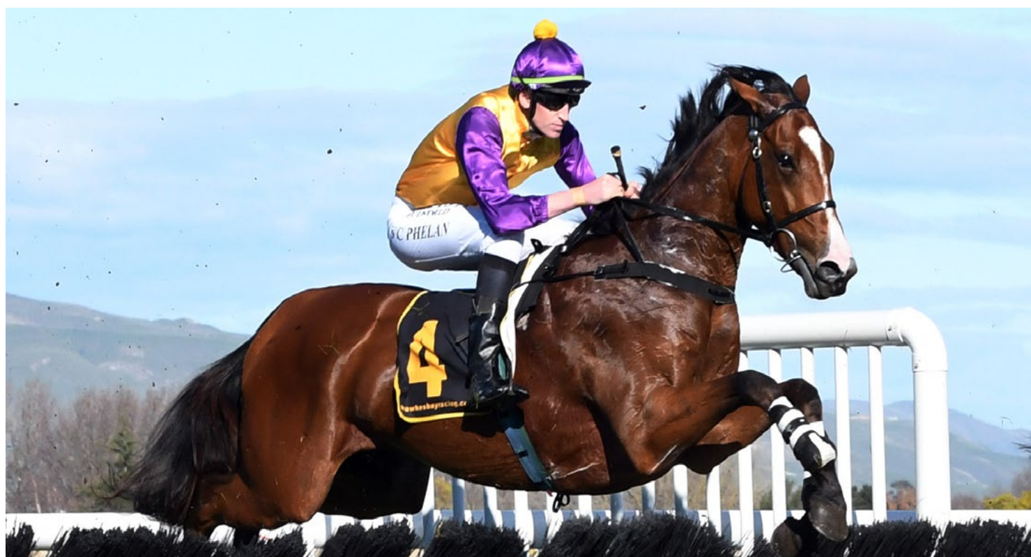
Outstanding jumper Monarch Chimes who is in line for a return trip across the Tasman