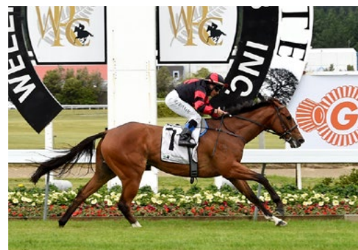
Shadow Fox (NZ) (Keeninsky)