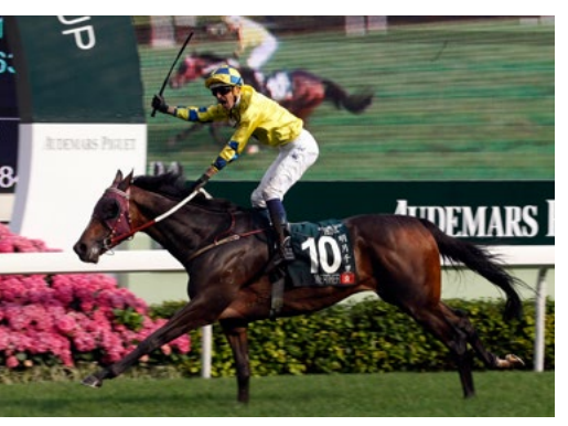
Werther (NZ) (Tavistock)