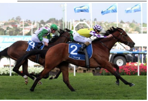
Sacred Elixir (NZ) (Pour Moi) Pike's stable out in force at Ellerslie

"We have been selling for about 10 years after starting off with one or two and we have slowly built it up. We prepare around about a dozen every year now." Full story here.