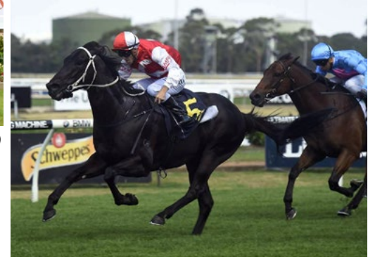
Kuro (NZ) (Denman)

The Gr.1 CF Orr Stakes (1400m) is run at Caulfield on February 11, a fortnight before the Gr.1 Futurity Stakes (1400m) at the same track.