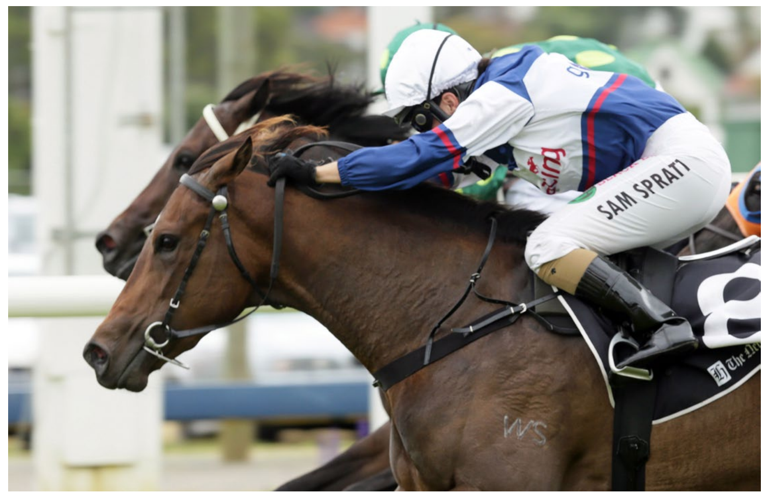
Hasahalo will start one of the favourites in Sunday's Listed Karaka Million at Ellerslie