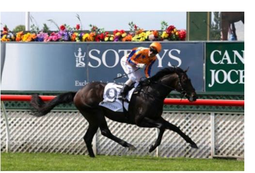
Xtravagant (NZ) (Pentire)

Xtravagant to stand at Newhaven Park Dual Group One winner Xtravagant (NZ) (Pentire) has been sold and is set for a stud career at Newhaven Park in New South Wales.