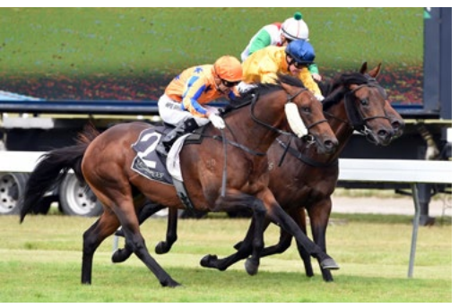
Hall Of Fame (NZ) (Savabeel)

A total of 1347 yearlings will go under the hammer across three sales sessions as local and international buyers look to secure a future champion from the cream of the New Zealand thoroughbred crop. Full story here.