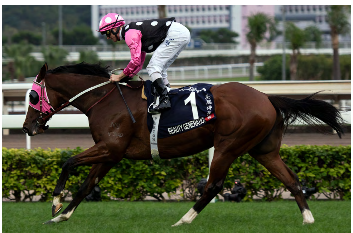
NZB National yearling Sale graduate Beauty Generation

he cream of New Zealand's thoroughbred yearling crop will go under the hammer at New Zealand Bloodstock's National Yearling Sales at Karaka this week, with the Book 1 sale to commence at 3pm on Sunday.