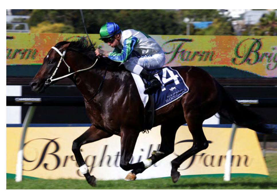
Ardrossan remains unbeaten in New Zealand after a classy win at Ellerslie

"He came back with a few heart problems.