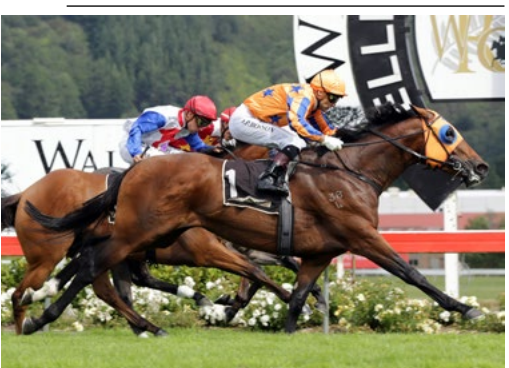
Age Of Fire (Fastnet Rock)

The decision to give Hiflyer a break was made following his latest run for third in the Gr.1 Thorndon Mile (1600m).