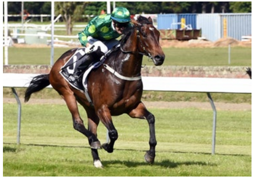
Hiflyer (NZ) (Tavistock)

The winner of four of her seven starts, Love Affair had finished runner-up in the Gr.2 Cal Isuzu Stakes (1600m) at Te Rapa at her previous start.