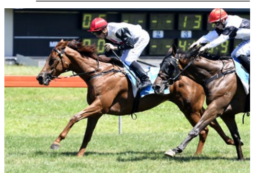
Matauri (NZ) (Ocean Park)

Atlante will be offered by Mapperley Stud at the Book 1 Sale at Karaka next Wednesday.