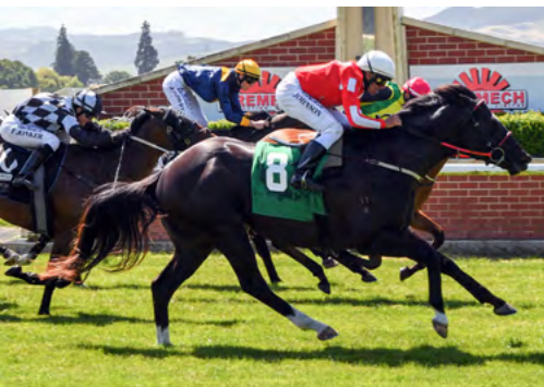
Sensei (Dream Ahead)