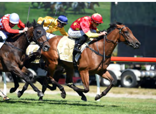
Madison County (NZ) (Pins)