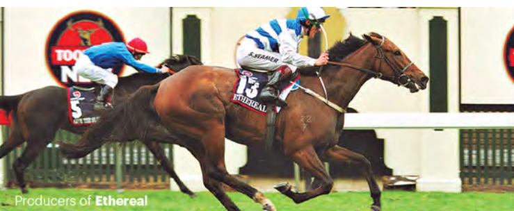
Producers of Ethereal