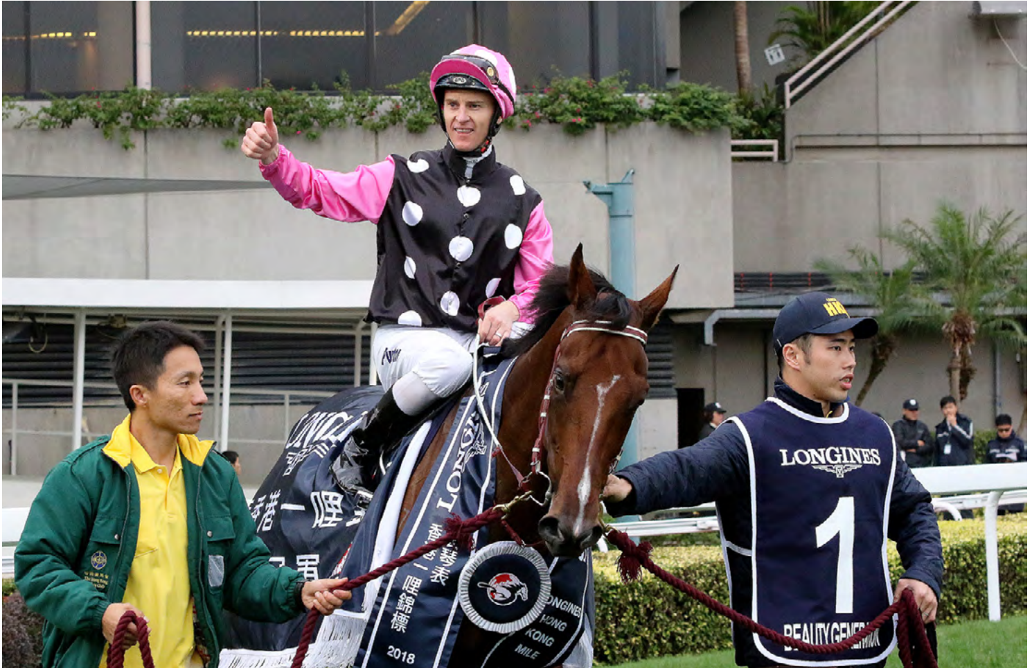
Reigning Hong Kong Horse of the Year, Beauty Generation, has been named the equal best miler in the world

H ong Kong champion Beauty Generation (NZ) (Road to Rock) has been named the equal best miler in the world, alongside Winx, in the 2018 LONGINES World's Best Racehorse Rankings (WBRR), released on Wednesday.