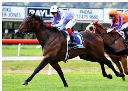
Ever Loyal (Sebring)