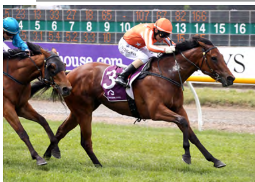
Media Sensation (I Am Invincible)

"The track was perfect after they put a bit of water on it overnight and they all went well," Pike said. Full story here