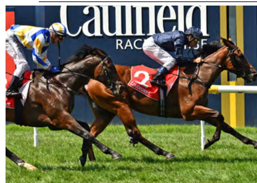
Long Leaf (Fastnet Rock)

"We have got to turn the tables on Kiwi Ida from last time (Gr.3 Canterbury Breeders' Stakes), she looks the one to beat, but I am pretty happy with my horse."