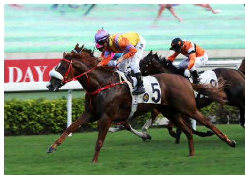
Superich (NZ) (Red Giant)