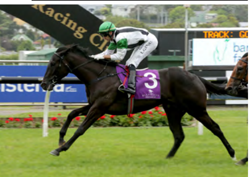
Whiskey Neat (Denman)