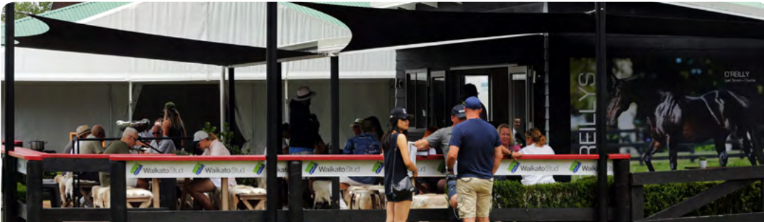
Waikato Stud Hospitality