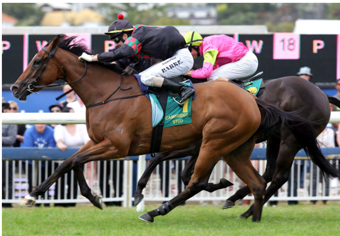
Class mare Volpe Veloce tackles the Gr.2 Westbury Classic at Ellerslie on Saturday