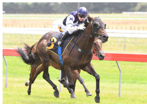
Press Release (NZ) (Dalghar)

Innes was able to find some clear racing room down the straight where Sistabeel was able to lengthen and win by 1-1/4 lengths over Cin Cin, with a further three quarters of a length back to Witchery (NZ) (Savabeel) in third. Full story here