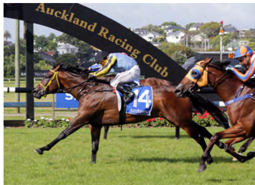
Santa Monica (NZ) (Per Incanto)