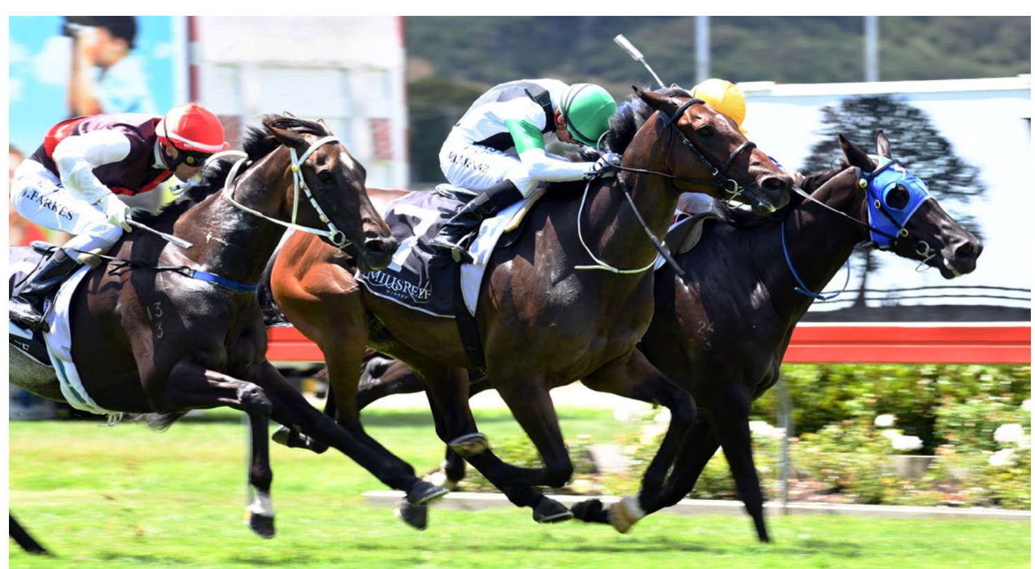
Exciting three-year-old Jasd continued to deliver with a win at Trentham on Saturday