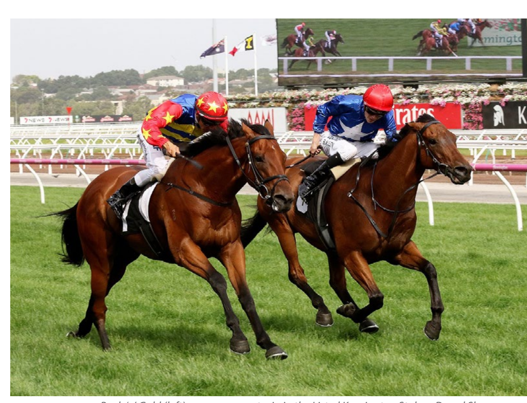
Rock 'n' Gold (left) scores an upset win in the Listed Kensington Stakes