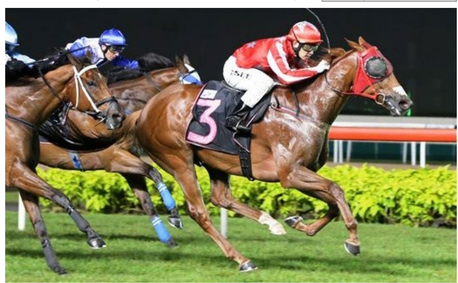
Nova Strike notched up his seventh career win at Kranj on Friday night