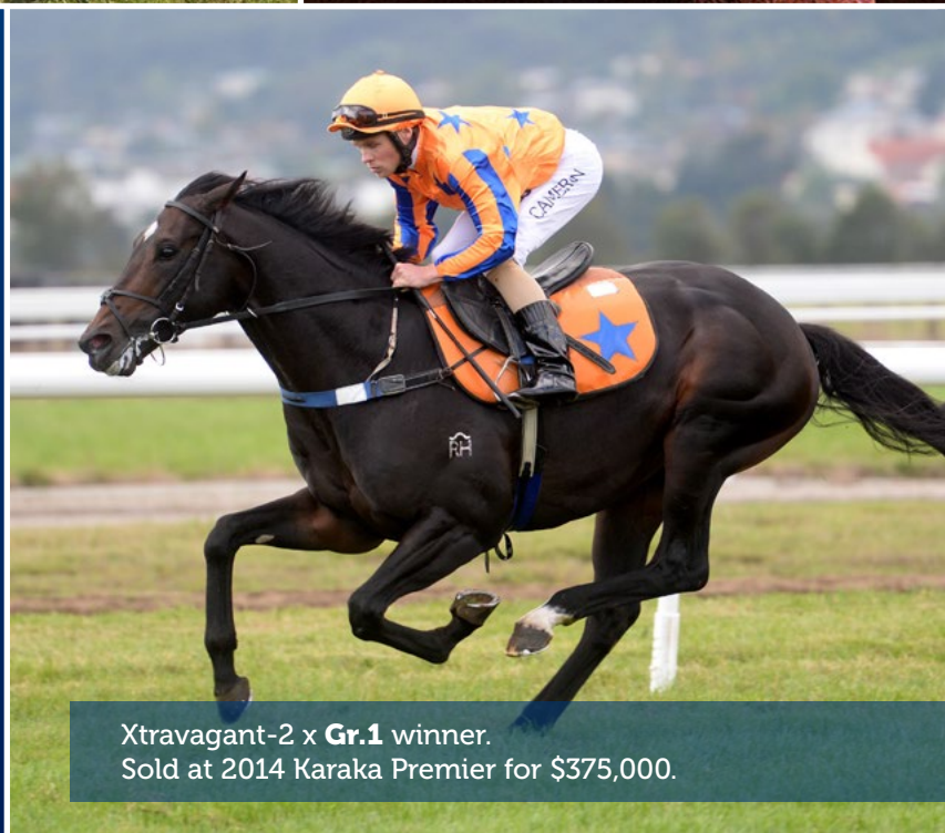
Xtravagant-2 x Gr.1 winner. Sold at 2014 Karaka Premier for $375,000.

Pentire, Shocking, Jimmy Choux, Tavistock, Fastnet Rock, Pins, Reliable Man, Myboycharlie, Super Easy, Zacinto, Showcasing