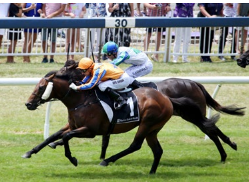
Hall Of Fame (NZ) (Savabeel)