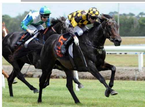
Promise To Reign (Manhattan Rain)