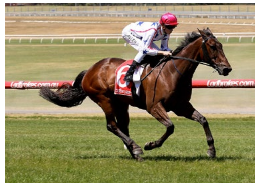
Airalign (NZ) (Align)