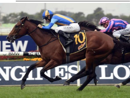
Imposing Lass (NZ) (Makfi)

Storytime finished runner-up last time out behind leading filly Volpe Veloce (Foxwedge) in the Gr.2 Eight Carat Classic.