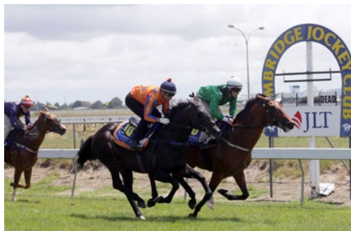
Turn Me Loose (NZ) (Iffraaj)

"She performed very well in the race last year as a soft four-year-old mare. She's certainly a much more developed, much stronger horse this season," he said.