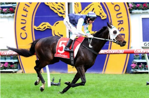
Sly Romance (NZ) (Pentire)

Trentham on Saturday week for the five-year-old gelding.