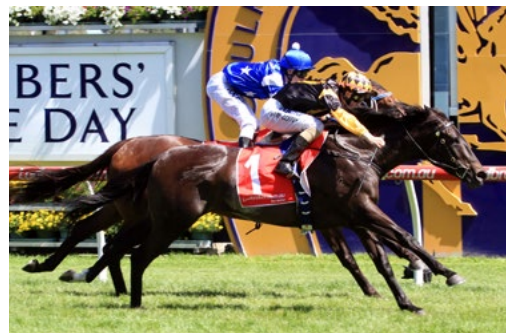
Jacqui's Joy (NZ) (Real Saga)