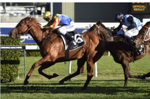
Spieth (NZ) (Thorn Park)

"I have been predominantly behind the camera in my role as a programming producer," she said. "The racing.com role is a presenting one doing birdcage analysis on raceday." Full story here.