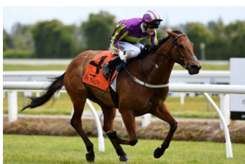
Start Wondering (NZ) (Eighth Wonder)

Turn Me Loose's first-up run across the Tasman is likely to be in the Gr.2 Australia Stakes at Moonee Valley on January 27. Full story here.