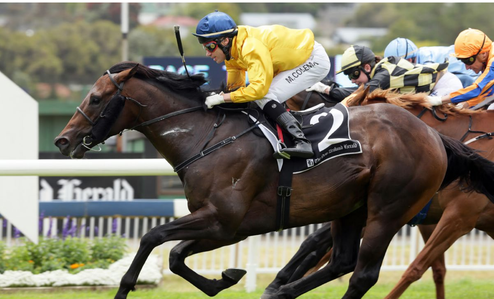
Savile Row looms as a major contender for tomorrow's Gr. 1 Randwick Meats Levin Classic