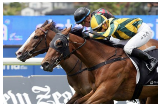
Swissta (NZ) (Swiss Ace)

The Lance O'Sullivan and Andrew Scott-trained filly blew the start in the Gr.3 Eclipse Stakes on New Year's Day before she got home well to finish fourth behind Hasahalo (NZ) (Savabeel).