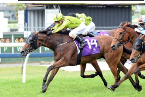
Snow Secret (NZ) (Sakhee's Secret)

Sly Romance's depths of stamina are emphasised by his victories over 4000m at Caulfield, 3400m at Mornington and his latest runaway success, under topweight of 59kg, last month at Moonee Valley over 3000m. Full story here.