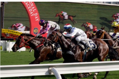
Amazing Kids (NZ) (Falkirk)