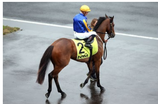
Oscar Eight (NZ) (Showcasing)