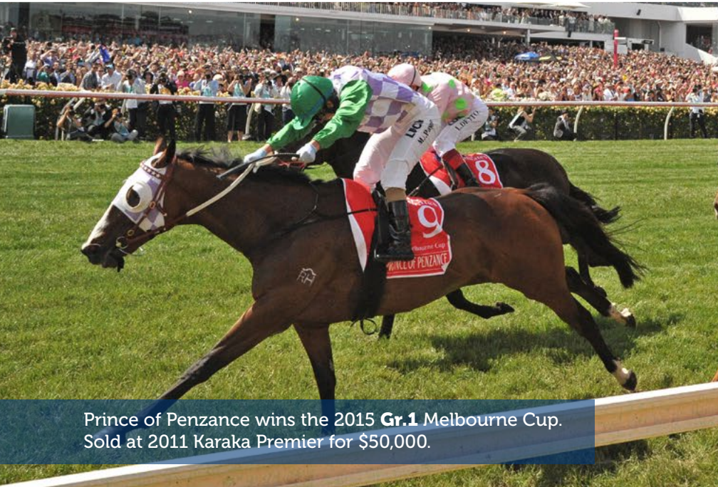
Prince of Penzance wins the 2015 Gr.1 Melbourne Cup. Sold at 2011 Karaka Premier for $50,000.