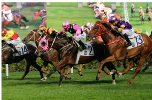
Beauty Generation (NZ) (Road To Rock)

"He's shown that he can accelerate well down the straight and nothing really fazes him so he would be the right type of horse to travel."