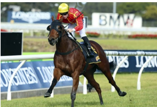
Esteban (NZ) (Encosta De Lago)

"He's a nice talented horse going forward and hopefully he can just keep going through the grades."