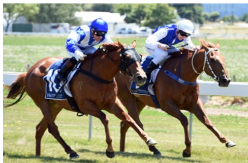
Orange Shore (NZ) (Swiss Ace)

"He's a nice horse, he's not overly big but he always tries."