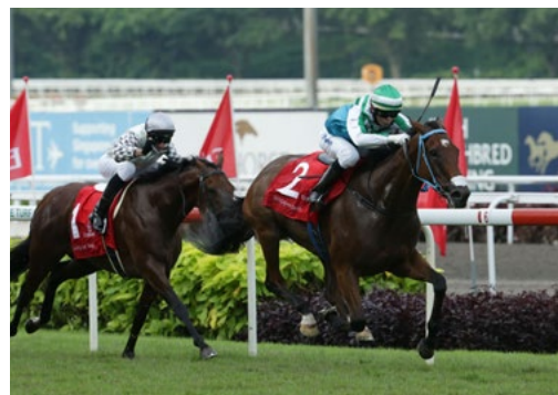
Infantry (NZ) (Tavistock)

Good things come to those who wait though and the daughter of Swiss Ace won for the second time in her brief career when successful on her home track at Hastings on New Year's Day. Full story here