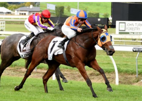
Melody Belle (NZ) (Commands)