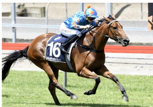
Anevay (NZ) (Ocean Park)