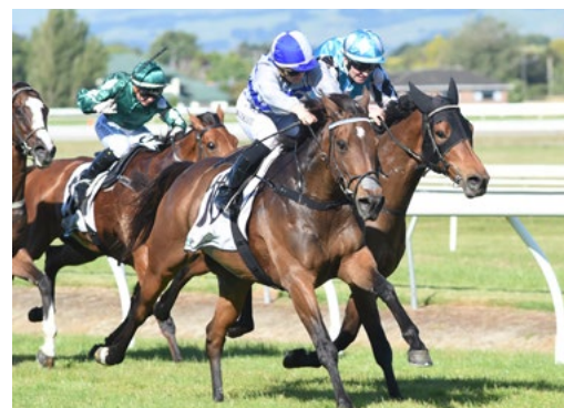
Asama Blue (Fastnet Rock)