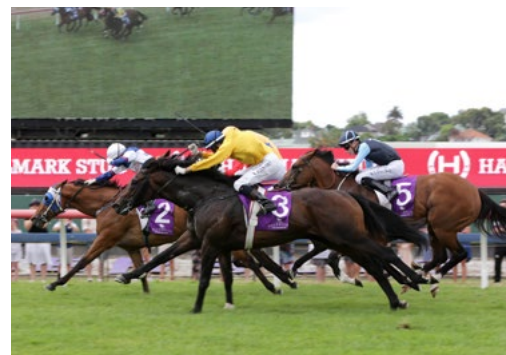
Savile Row (NZ) (Makfi)

Shenandoah's win boosted interest in her half-brother (Lot 418) by exciting first-season sire Brazen Beau being offered in their Wentwood Grange Book 1 draft at Karaka. In total, Wentwood Grange has 23 yearlings in Book 1 and a further 15 in Book 2. Full story here