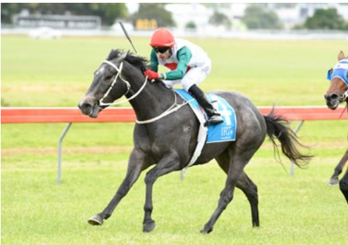
Crossedem (NZ) (Any Suggestion)