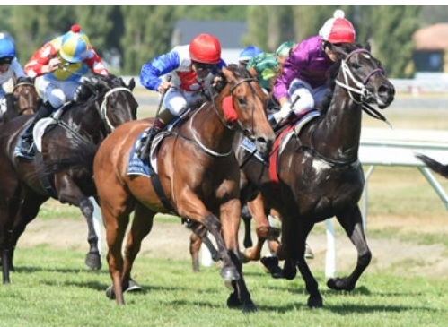
Savvy Coup (NZ) (Savabeel)