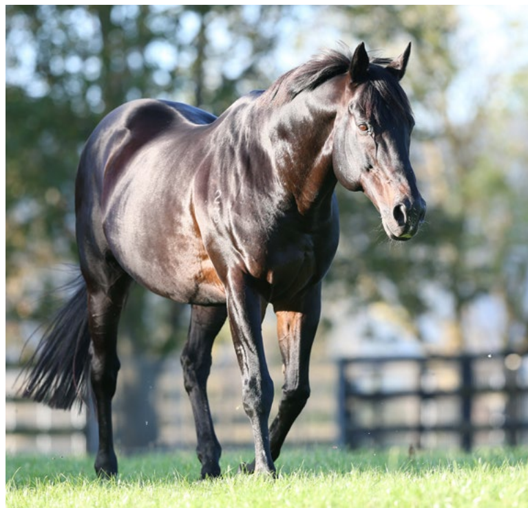
Four-time New Zealand General Sires Premiership winner, O'Reilly

Veandercross was owner-trained in New Zealand