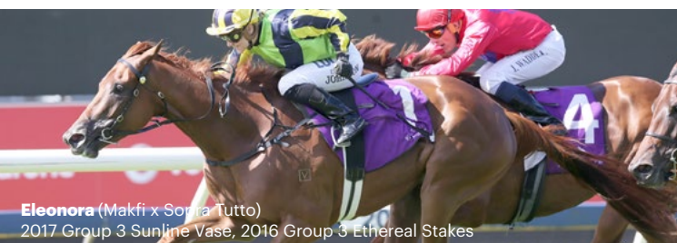
Eleonora (Makfi x Sopra Tutto) 2017 Group 3 Sunline Vase, 2016 Group 3 Ethereal Stakes