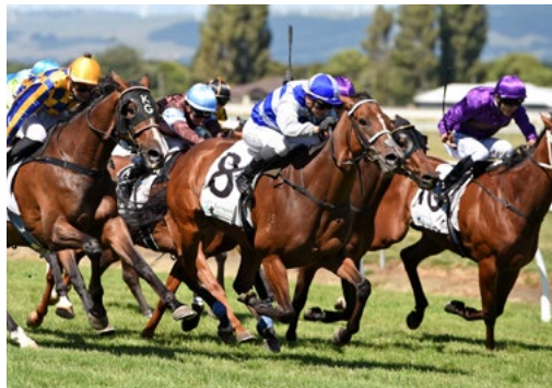
Seraphim (NZ) (Rip Van Winkle)