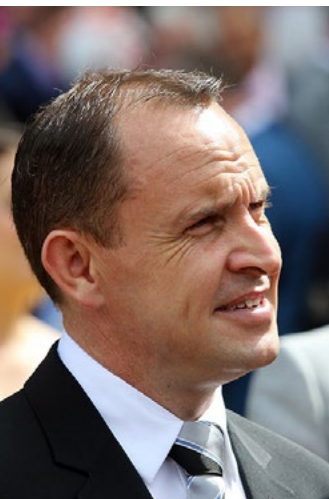
Champion Sydney-based trainer, Chris Waller

Since moving across the Tasman, Waller has won seven consecutive Sydney premierships, seven Bart Cummings Medals and has produced numerous Group One winners including wonder mare Winx (Street Cry).