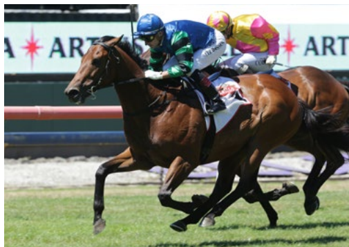
Sultan Of Swing (NZ) (Bachelor Duke)