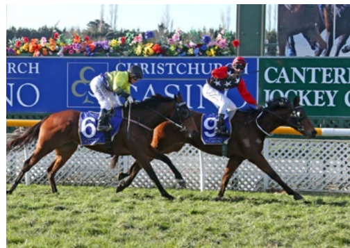
The Gordonian (NZ) (Remind)

Koru Thoroughbreds will offer a yearling half-brother (Lot 92) to Scream Park by Dundeel during the Book 1 Sale at Karaka on January 28.