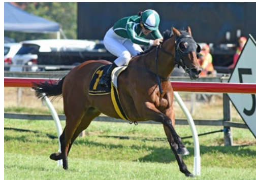
Swiss Precision (NZ) (Swiss Ace)

Trelawney Stud will offer Anevay's yearling half-brother (Lot 918) by Reliable Man during the Book 2 Sale at Karaka next month.