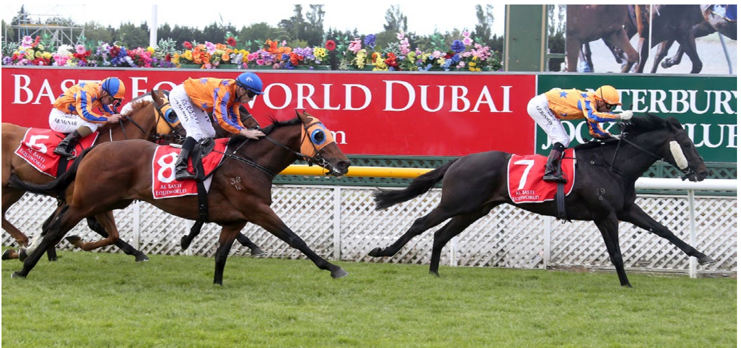
Embellish will retire to stand at Cambridge Stud once his racing career is over.