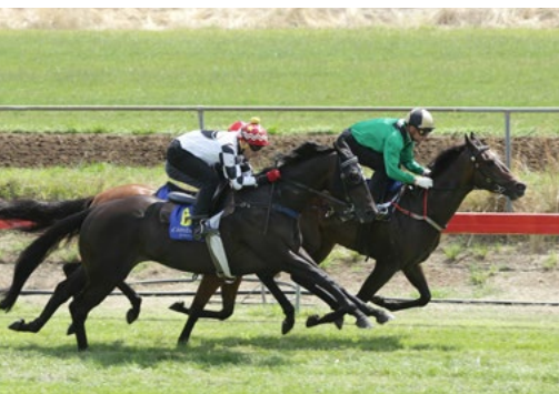
Kawi (NZ) (Savabeel)