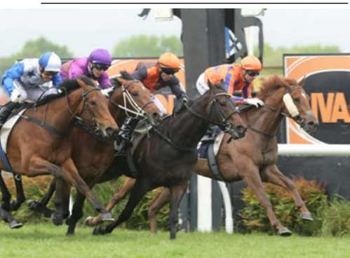
Hard Merchandize (NZ) (Burgundy)