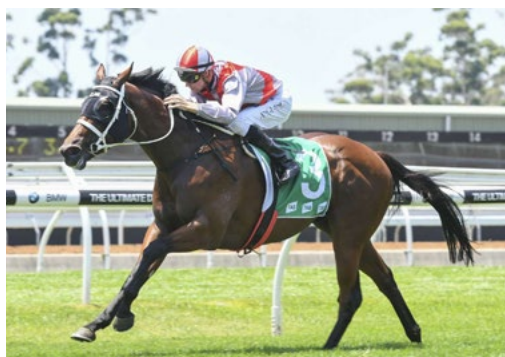
Scream Park (NZ) (Ocean Park)