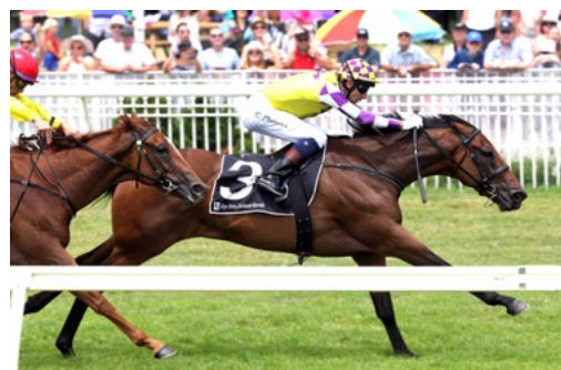
Sacred Shot (NZ) (Savabeel)