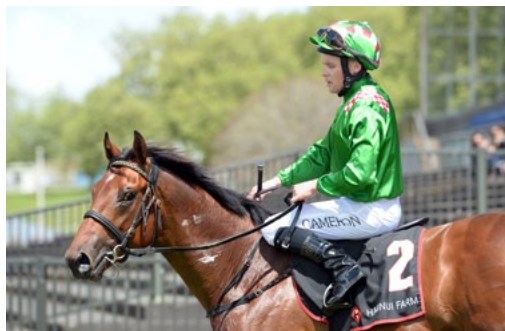
No Fuss Gus (NZ) (Savabeel)