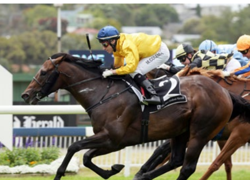
Savile Row (NZ) (Makfi)