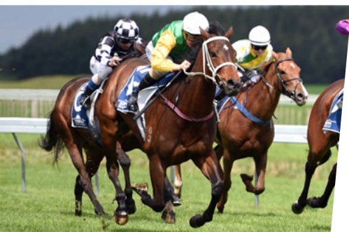
Sweepstake (NZ) (Per Incanto)