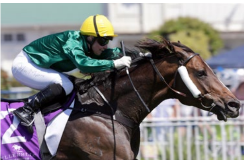
Benzini (Tale Of The Cat)