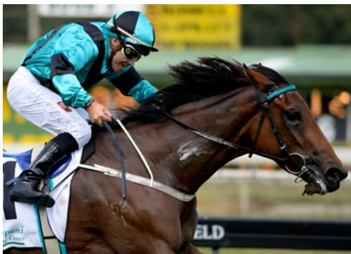
Exquisite Jewel (NZ) (Lucky Unicorn)

Record priced yearling Horizon (Dynasty) who cost R5.2 million at the Cape Premier Yearling Sale is considered the horse to beat following a luckless second placing in the Listed Grand Foods Jet Master Stakes.