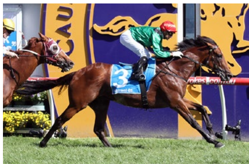
Turn Me Loose (NZ) (Iffraaj)

Odyssey Moon has won four races, including the Gr.3 Standish Handicap at Flemington on New Year's Day. The son of Snitzel has also runner-up in the Gr.1 Sires' Produce Stakes at Rosehill as a two-year-old.