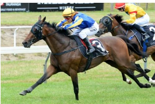
Brighton (NZ) (Buffalo Man)

Savile Row's Ellerslie success at the end of last month marked his first appearance since he finished runner-up behind Ugo Foscolo (NZ) (Zacinto) in the Gr.1 New Zealand 2000 Guineas in November. That performance earned him a hefty 20 rating points. Full story here.