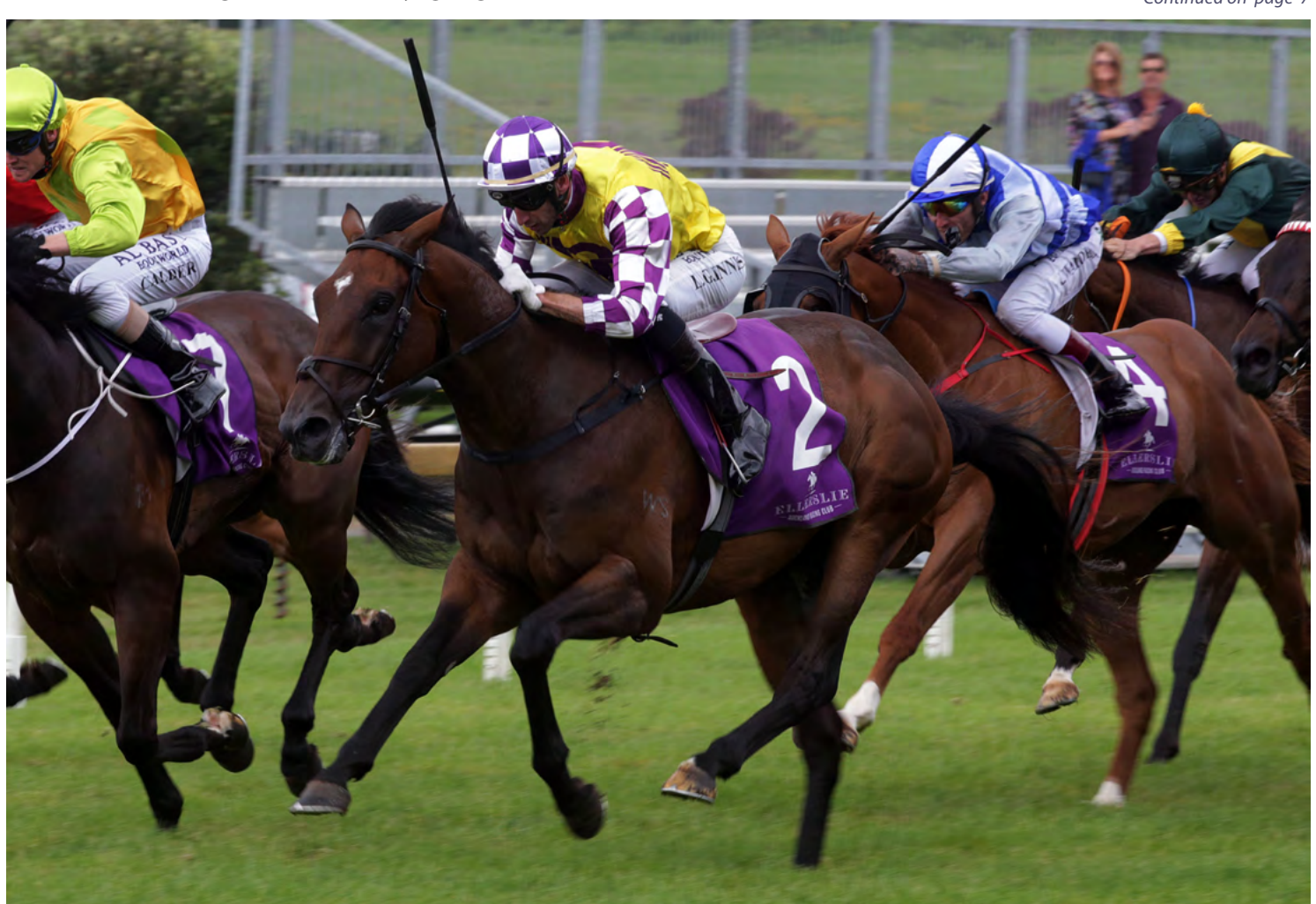
Surely Sacred winning the Gr.2 Jamieson Park Auckland Guineas (1600m) at Ellerslie on Tuesday.