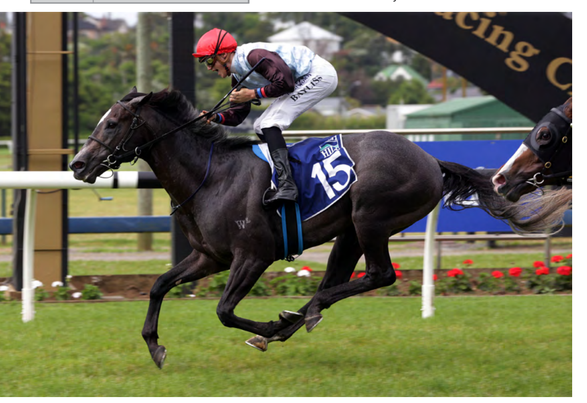
On The Rocks winning the Gr.2 Rich Hill Mile (1600m) at Ellerslie on New Year's Day.