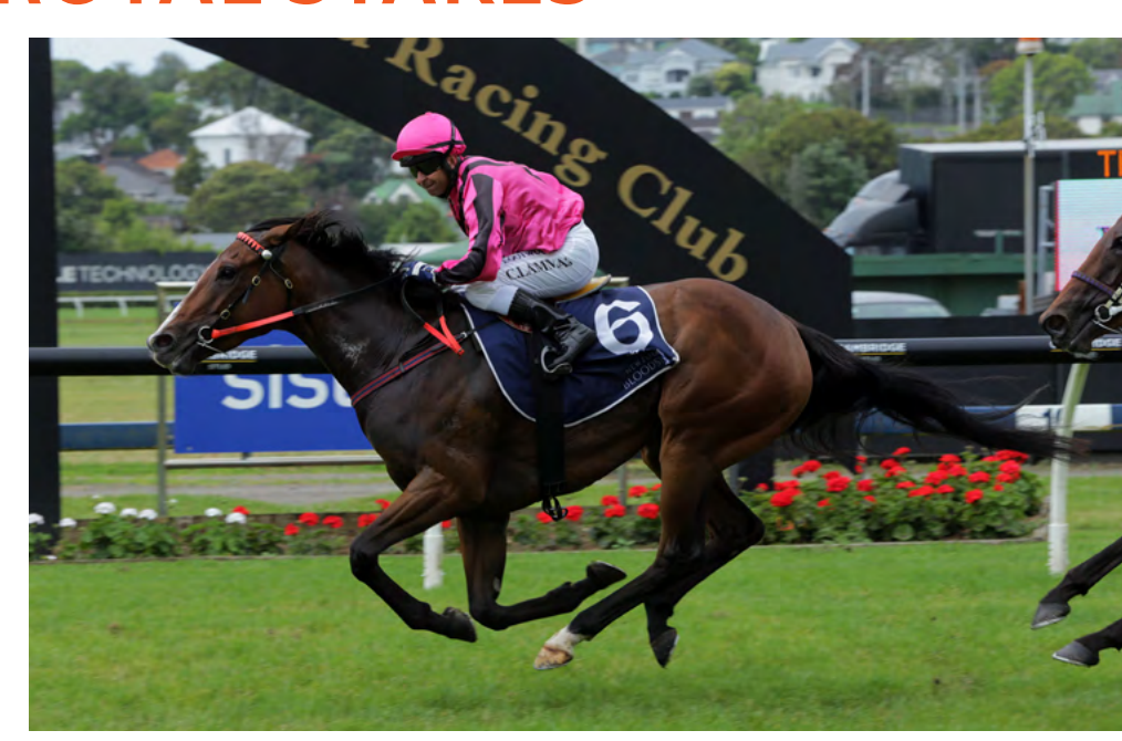
Imelda Mary winning the Gr.2 Valachi Downs Royal Stakes (2000m) at Ellerslie on Tuesday.

Awapuni visitor Secret Allure (NZ) (Zacinto