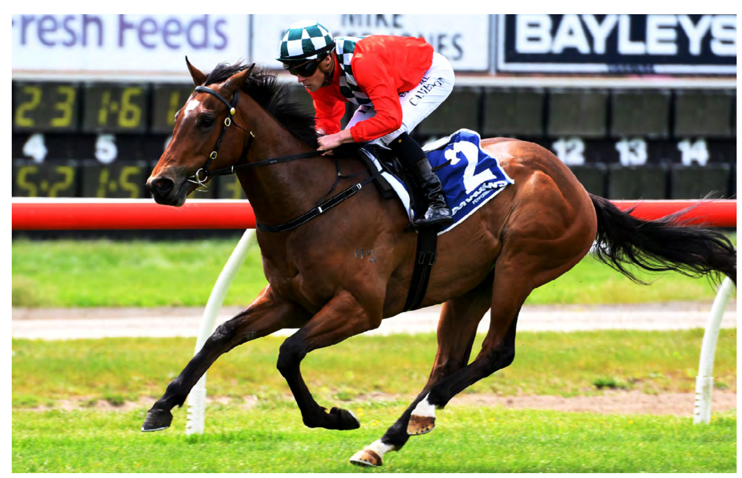
Regency Legend (Espumoso) winning at Te Aroha.