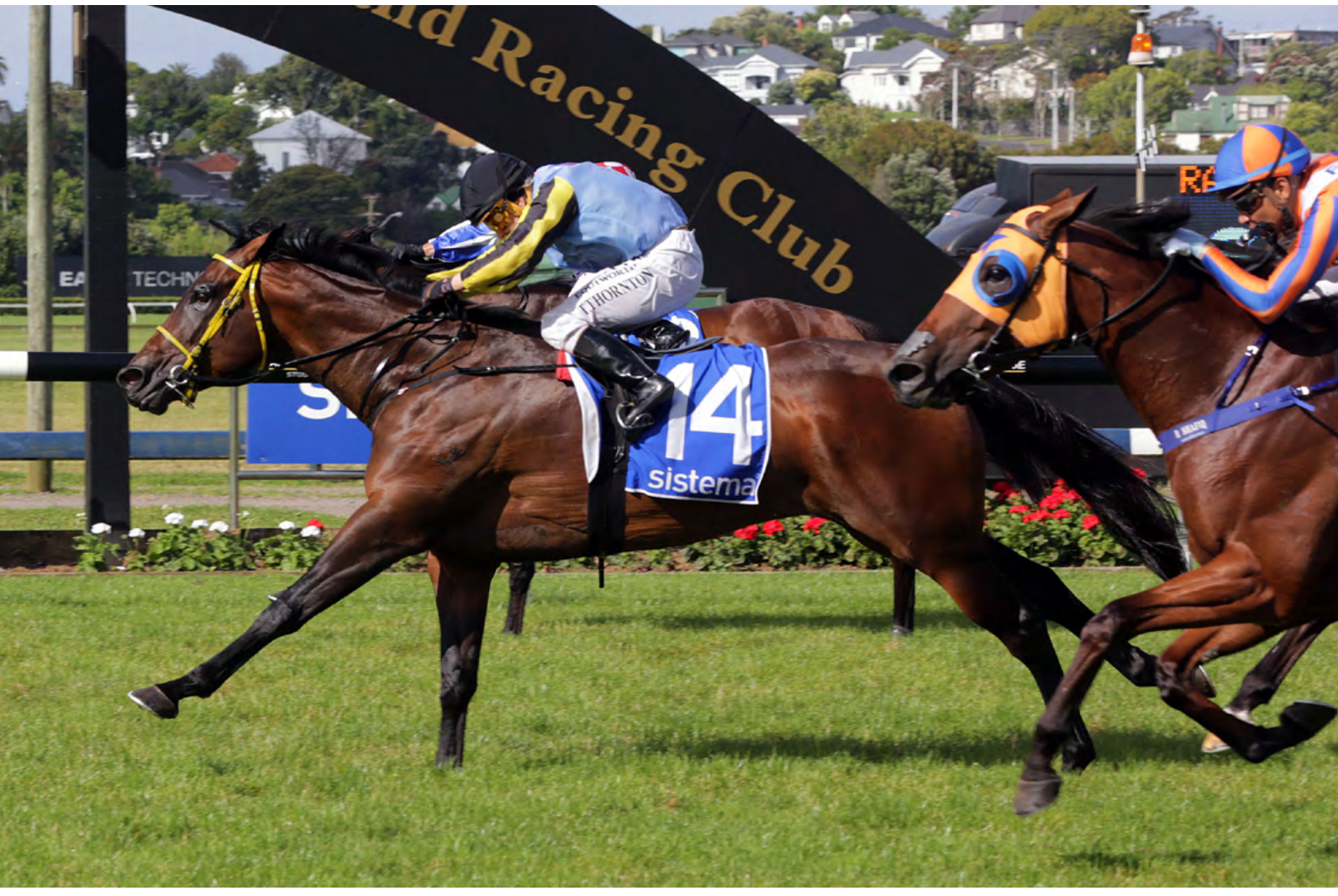
Santa Monica winning the Gr.1 Sistema Railway (1200m) at Ellerslie on New Year's Day.

utsider Santa Monica (NZ) (Per Incanto) belied her $77 winning-odds to take out the Gr.1 Sistema Railway (1200m) at Ellerslie on New Year's Day.