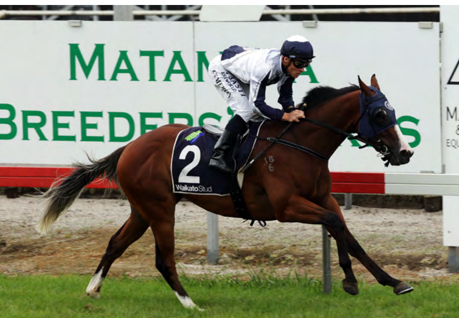
Yourdeel is well clear as he scores impressively at Matamata