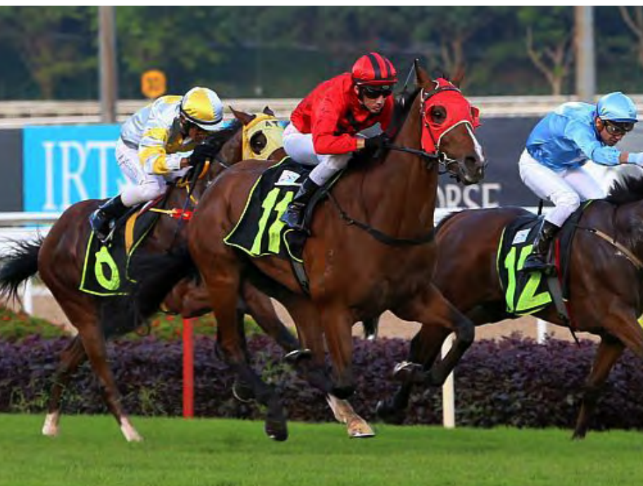
Stay The Course claims his first win on Friday night