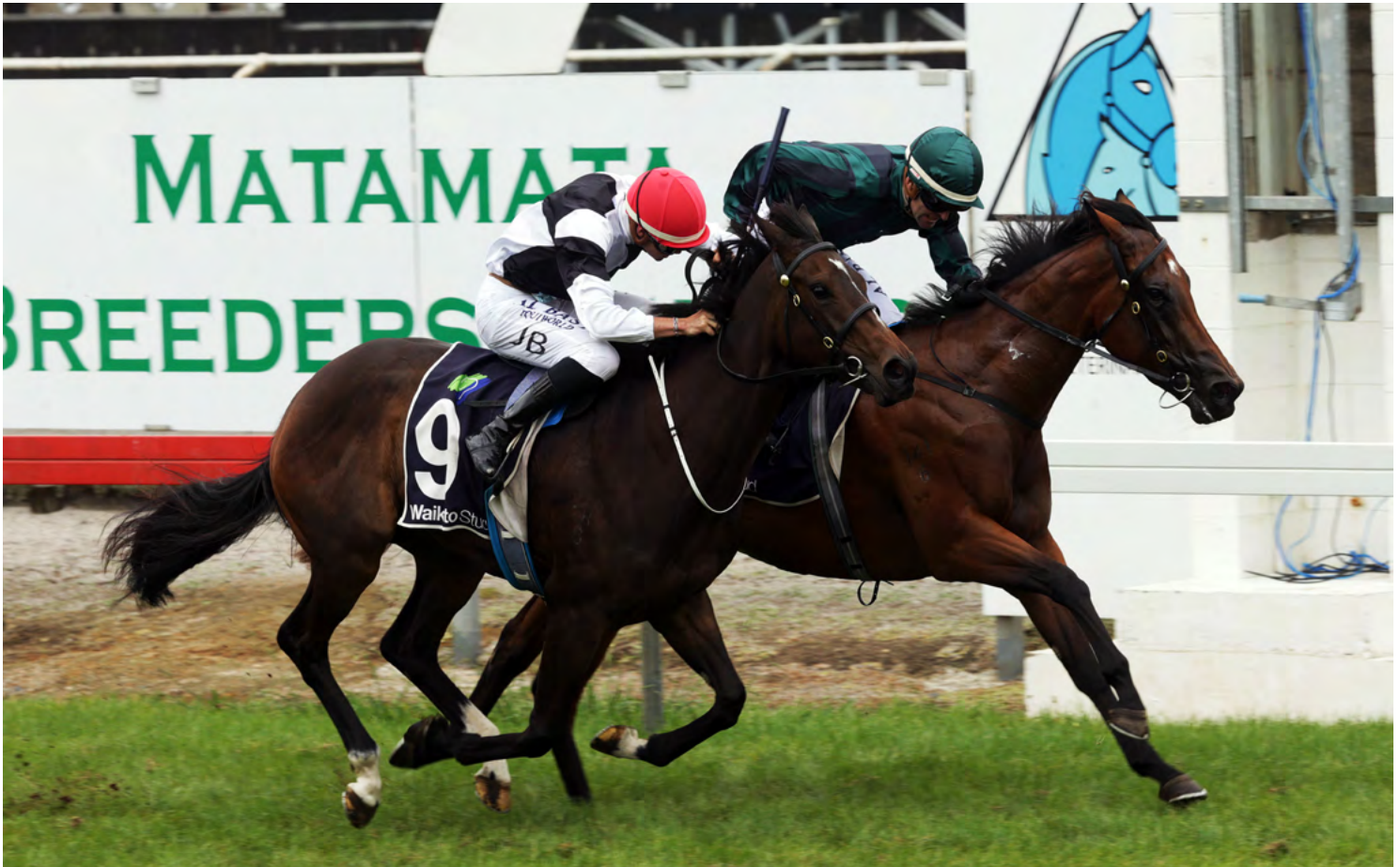
Aretha (inner) out-finishes Rainbow Dash at Matamata