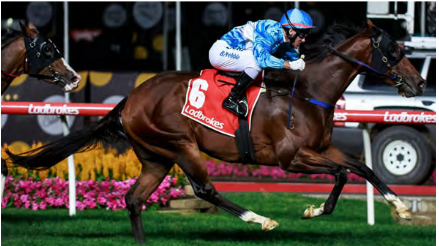
Embrace Me burst to the lead with a devastating run (Grant Courtney)