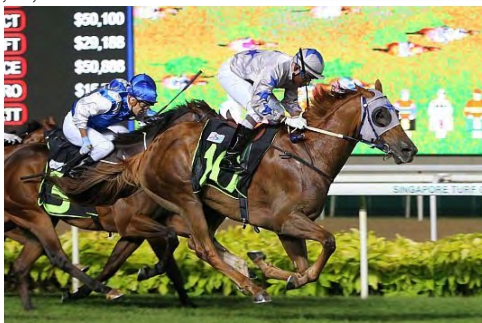
Star Emperor springs a major upset in the Canada Cup 2019 (Singapore Turf Club)