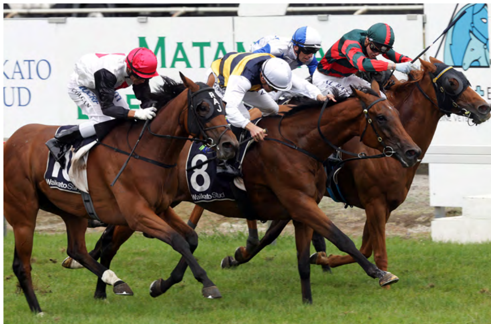
Vin De Dance (middle) prevails in an exciting finish at Matamata

"He was caught out wide in bit of a muddling run race, that didn't pan out