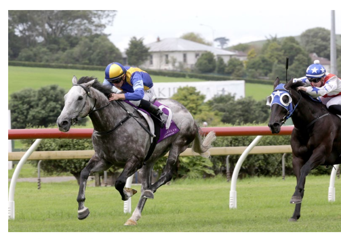
Saint Emilion made a stylish return at Ellerslie

"He had been working really well and I guess the track was the only