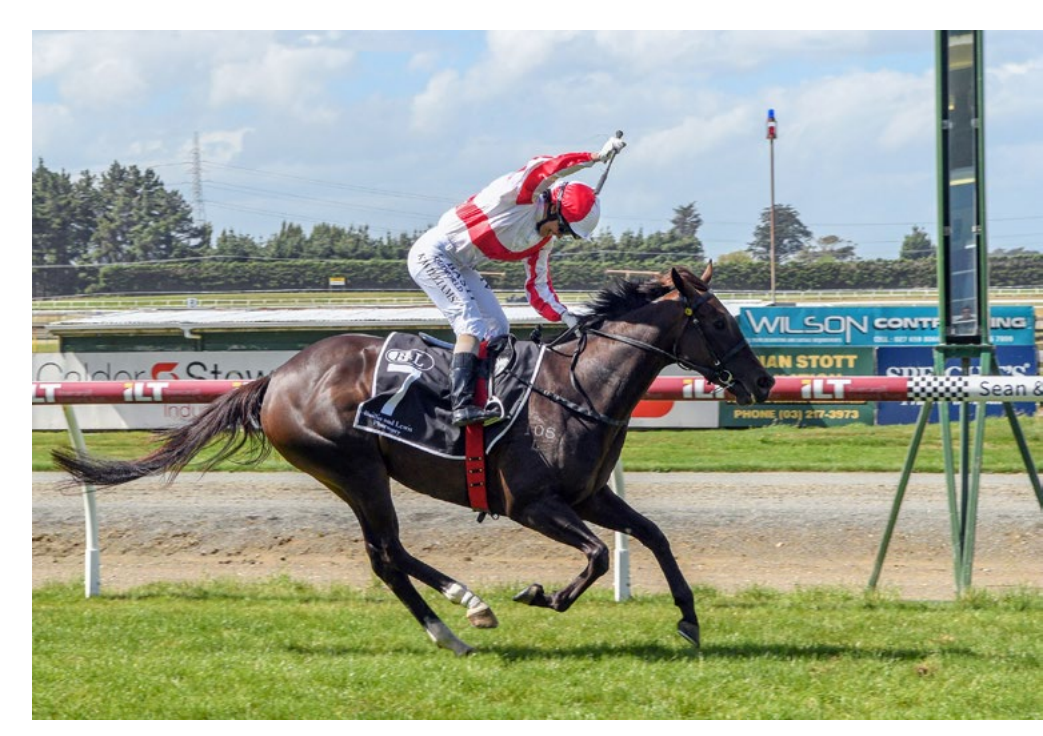
Global Thinking gets an all important black-type victory to boost her broodmare credentials

"He's won three of his last four starts and couldn't go in