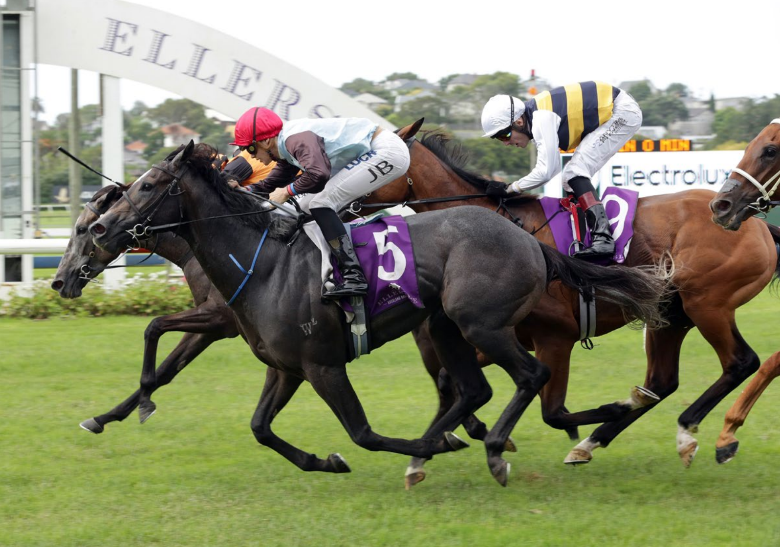
On The Rocks, back in NZ Derby favour after taking out the Gr.2 Avondale Guineas

n The Rocks (NZ) (Alamosa) is back in Group One contention after downing his fellow classic hopefuls at Ellerslie.