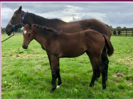
DAM OF FIVE WINNERS WITH POWER FILLY & IN FOAL TO TURN ME LOOSE.