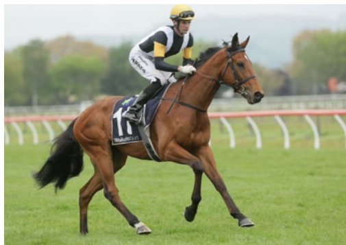
Kirkland (NZ) (Highly Recommended)