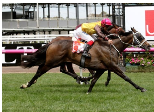
Main Stage (NZ) (Reliable Man)

The four-year-old is home spelling at Te Akau and the stable are now looking to his younger sibling Griffin (NZ) to pick up the mantle. Full story here