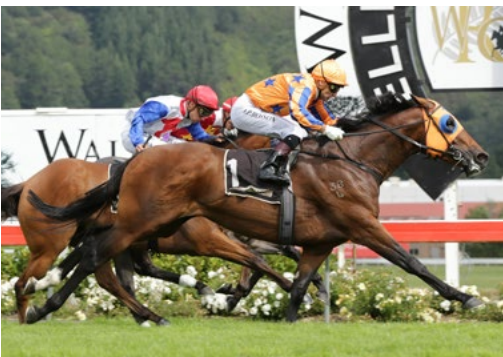
Age Of Fire (Fastnet Rock)