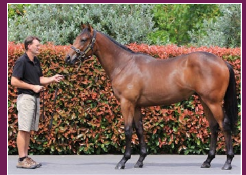
SAVABEEL YEARLING COLT OUT OF GR.1 WINNER IRISH FLING.