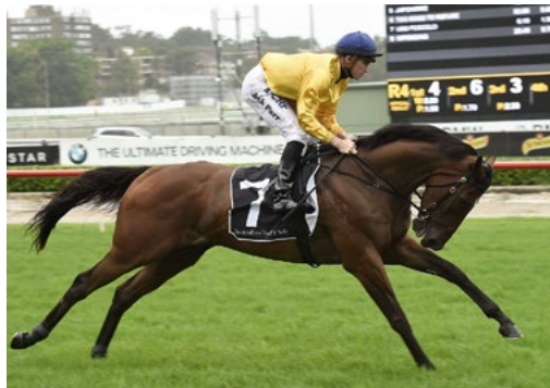
Ugo Foscolo (NZ) (Zacinto)