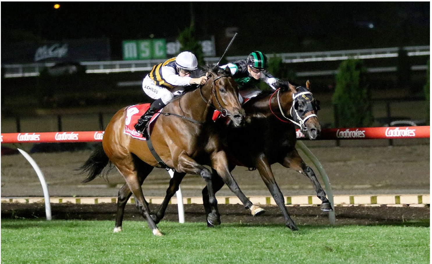
Persian Empire (inner) will have his first New Zealand start in the Gr.2 Electrolux Avondale Guineas (2100m) tomorrow