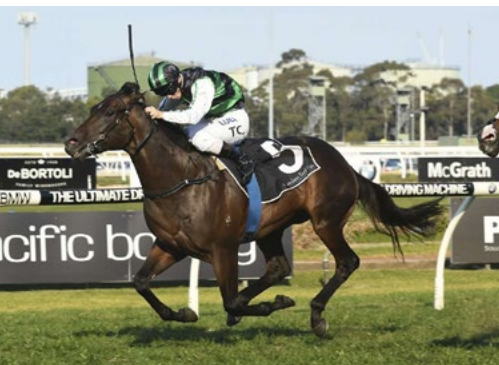
Addictive Nature (Savabeel)