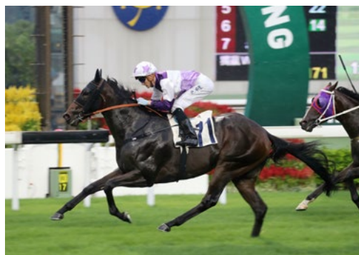
Rattan (NZ) (Savabeel)

Grunt won two of his three starts last season and has trialled ahead of his three-year-old debut at the weekend.