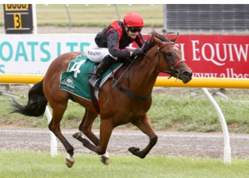
Xpressmyind (NZ) (Shamexpress)