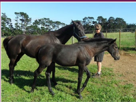
HALF TO GR.1 WINNER IN FOAL TO SWISS ACE WITH RELIABLE MAN FILLY.