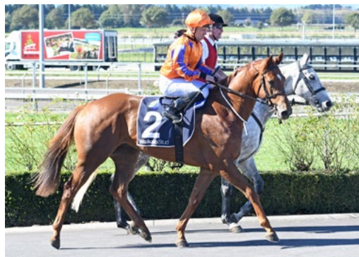
Griffin (NZ) (Iffraaj)

"It's been a case of Mission Hill being a bit sharper at the shorter trips, he's been ready for a while." Full story here