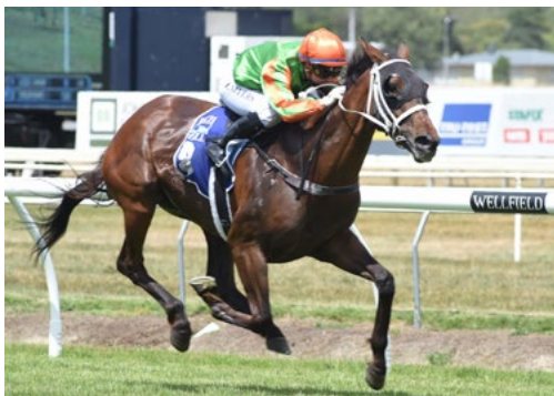
Boxachocolates (NZ) (Alamosa)