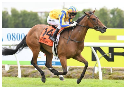
I Am Poppy (I Am Invincible)