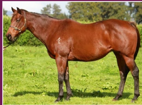
UNRESERVED MELBOURNE WINNING MARE IN FOAL TO SHAMEXPRESS.