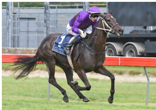
Dijon Bleu (NZ) (Burgundy)

She was the pre-post favourite for the Trentham feature following her hollow win in the Gr.2 Sir Tristram Fillies' Classic (2000m)