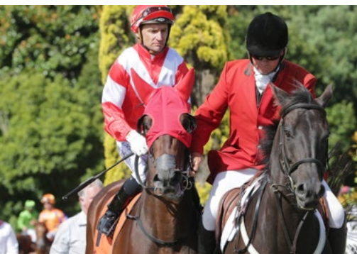
Mongolianconqueror (NZ) (Ocean Park)