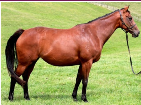
WELL-RELATED YOUNG MARE IN FOAL TO MONGOLIAN KHAN.

Featuring 35 Lots including yearlings, racing stock and broodmares.