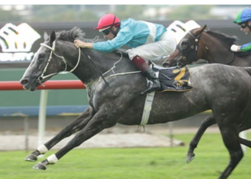
Thee Auld Floozie (NZ) (Mastercraftsman)