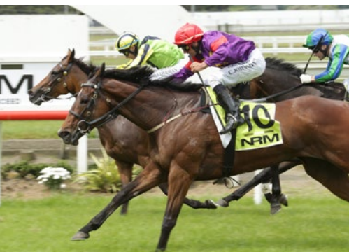
Sensible Princess (NZ) (Street Sense)