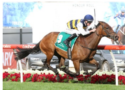
Aloisia (NZ) (Azamour)

"Sully might be a touch sharper over 1400m, he's won over 1400m and a mile before. They are there to win if they are good enough, it's a Group Three and they are hard to get."