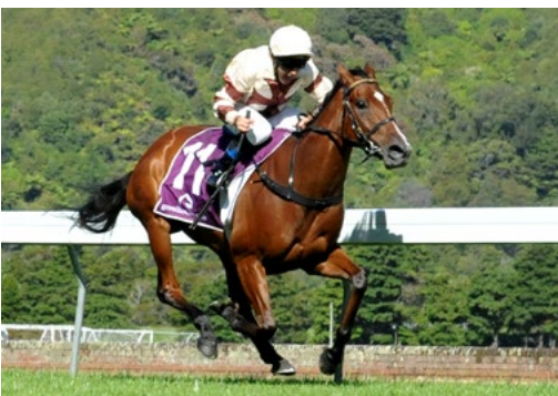
Aide Memoire (NZ) (Remind)

"I expect her to make good improvement from the run and if all goes to plan she should be pretty hard to beat in the Guineas, I think," he said.