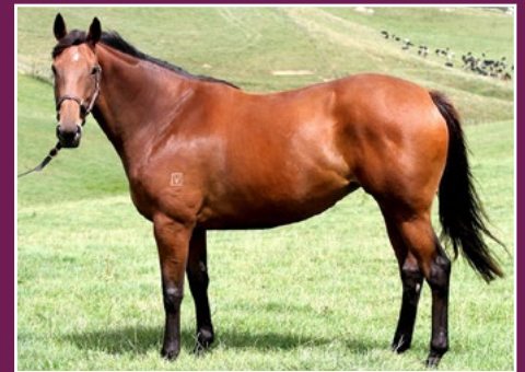
QUALITY YOUNG PENTIRE MARE IN FOAL TO BURGUNDY.