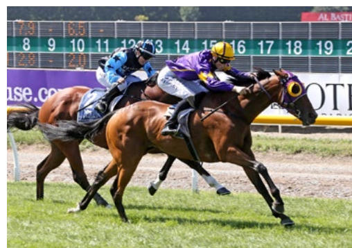
Boots 'N' All (NZ) (Perfectly Ready)

Carnival has won four of her 11 starts, including the Gr.3 Stewards' Stakes (1200m) at Riccarton in the spring.