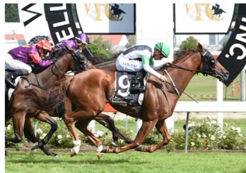
Magic Chai (Magic Albert)