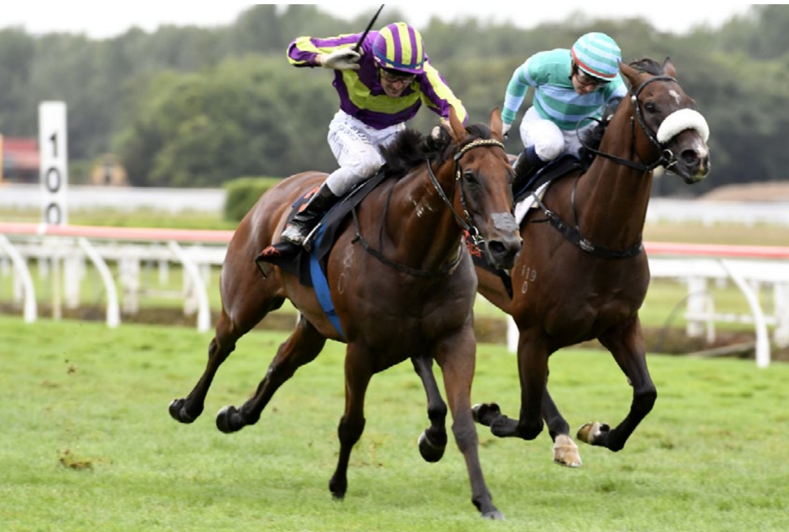
Start Wondering goes back-to-back in the Gr.1 BCD Sprint