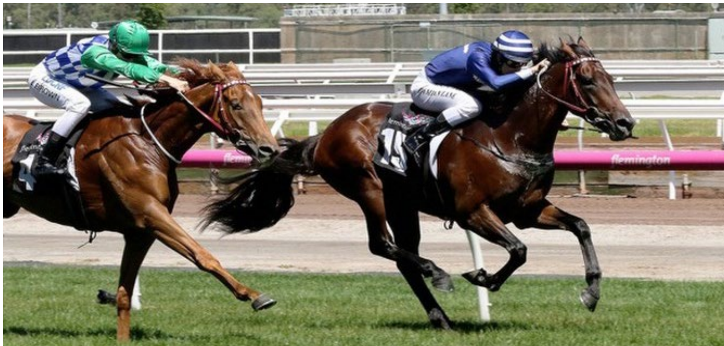
Civil Disobedience trounces his rivals in the Listed Tasmanian Derby

The New Zealand Derby could be on the radar for Civil Disobedience (NZ) (Raise The Flag) after the talented stayer justified his short quote with a dominant win in the Listed Tasmanian Derby.