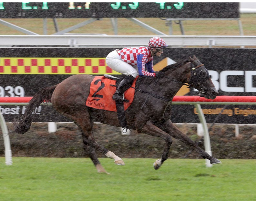
Auckland Cup hopeful, Diesel races away to a confident win