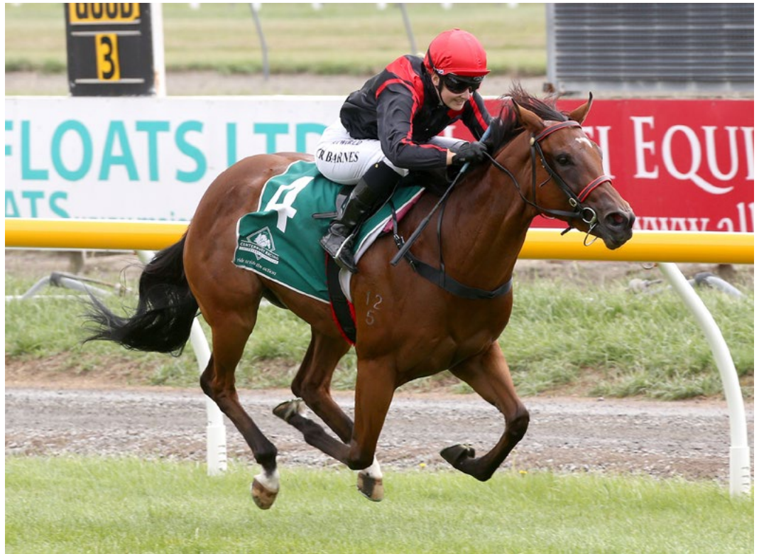
Xpressmymind shows shades of sire, Shamexpress' explosive speed

Shamexpress was the Group One winner of the Newmarket Handicap (1200m) before his retirement to the Cambridge nursery.