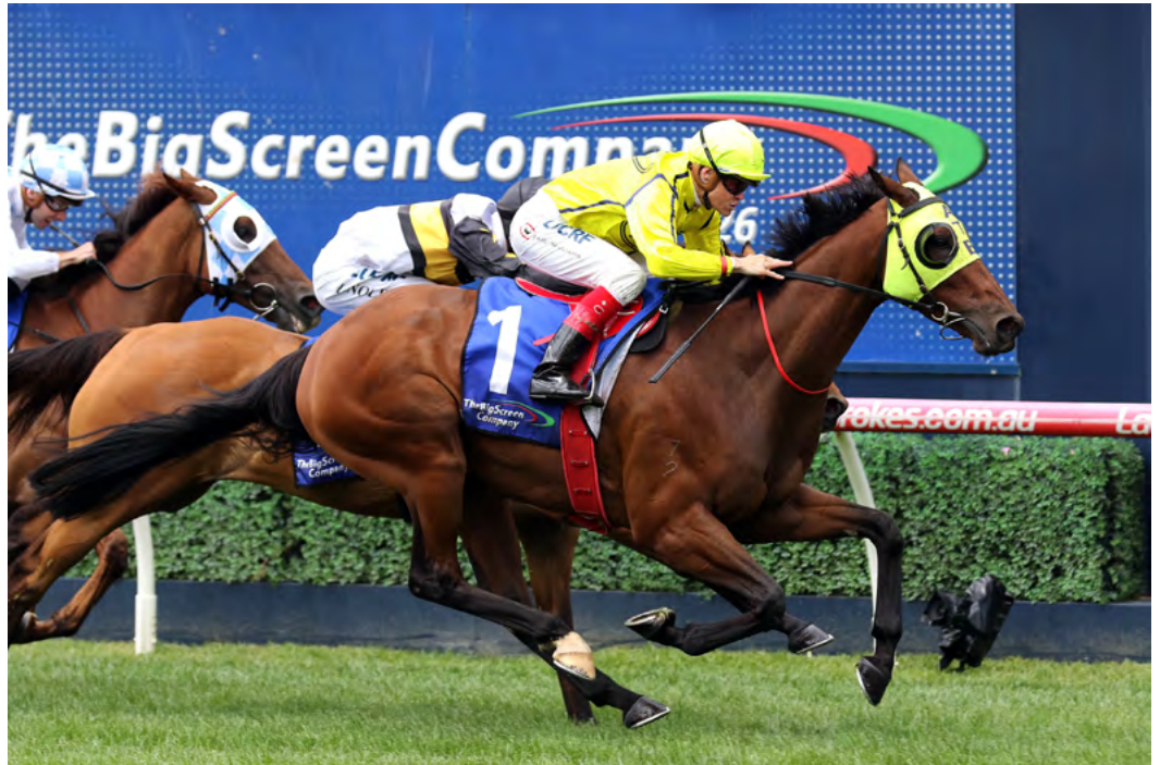
Yogi stormed home first-up at Caulfield on Saturday