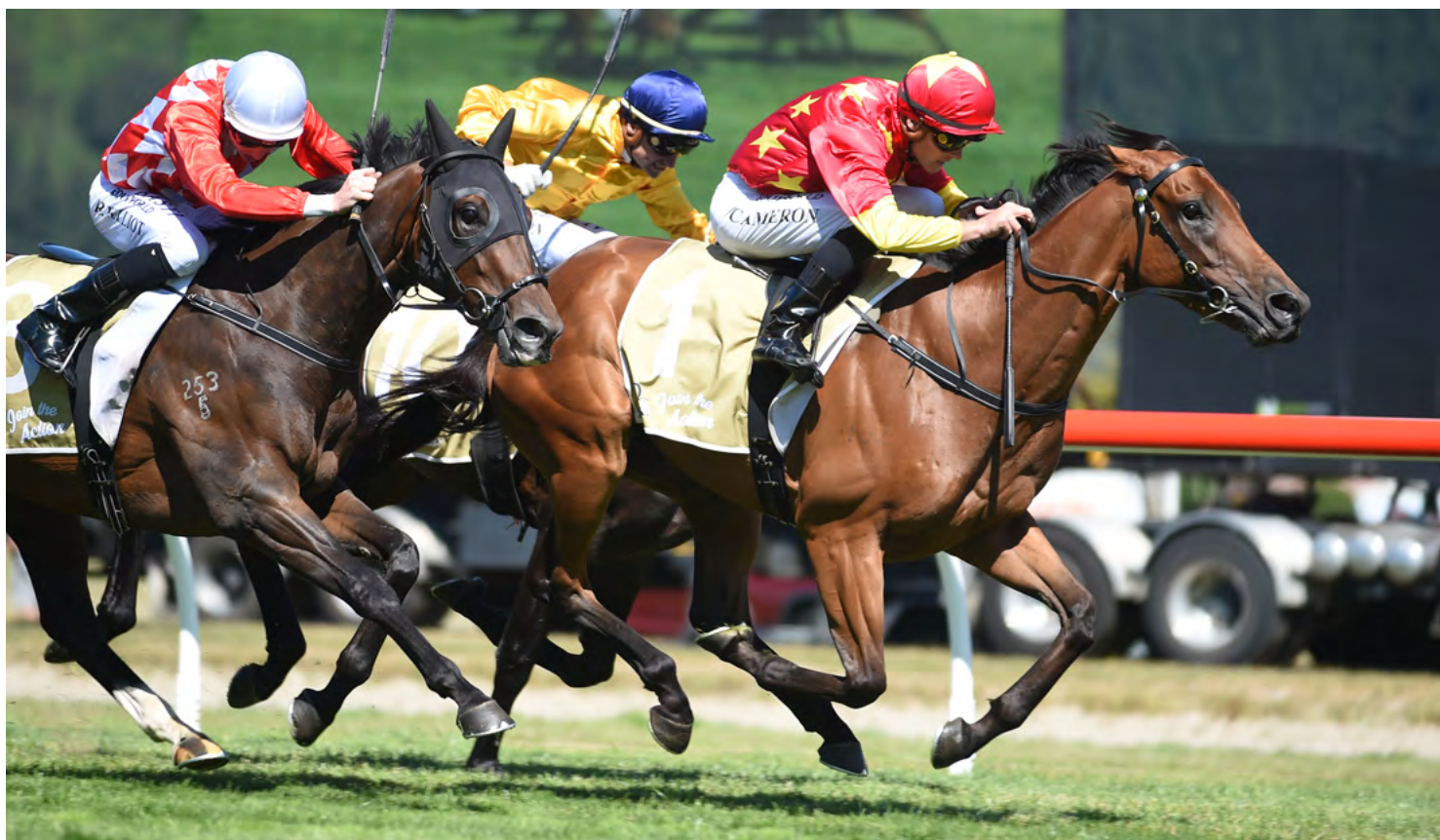
Madison County wins the Gr.1 Levin Classic at Trentham

He won four of his 8 starts and over $592,000 in prizemoney and looks an obvious candidate for next year's Hong Kong Derby (2000m), which is run for four-year-olds. – NZ Racing Desk