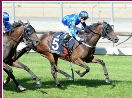
GR.1 & GR.2 PLACED SAVABEEL MARE - RACING & BREEDING PROPOSITION.