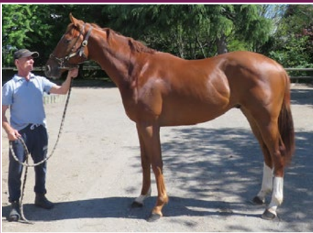
READY TO RUN TWO YEAR OLD BY COATS CHOICE.

Featuring 9 Lots including racing stock and broodmares.