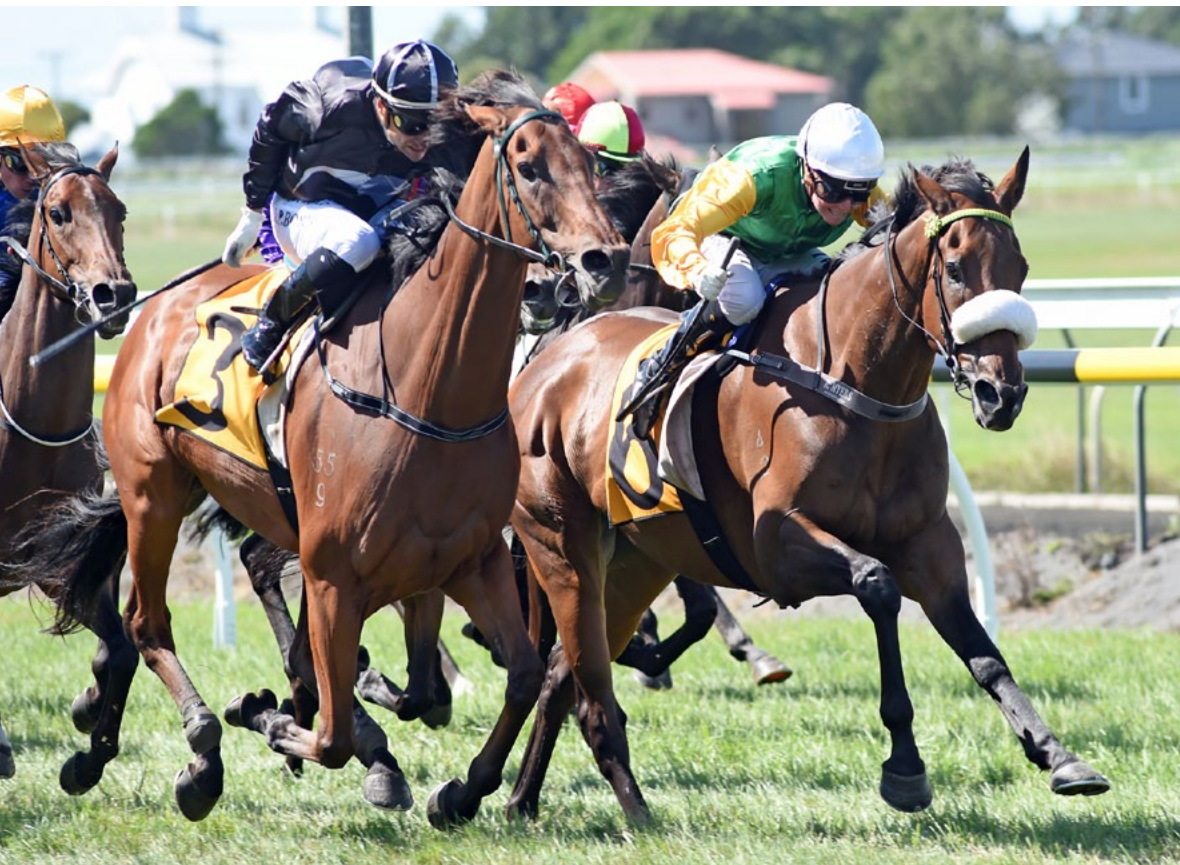
Beefeater (inside) holds off Scapolo to win the Gr.3 Platinum Homes Taranaki Cup