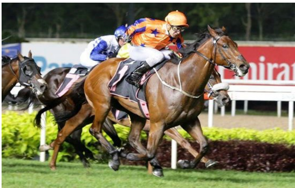
Kingsman keeps finding to land the spoils in the Class 3 race on Friday.