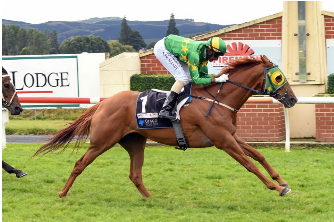
Tommy Tucker scored a deserved win in the Gr.3 White Robe Lodge Weight For Age

The chestnut will be defending his title in the Riccarton feature, having beaten Bloodstream (NZ) (Duelled) and Benzini