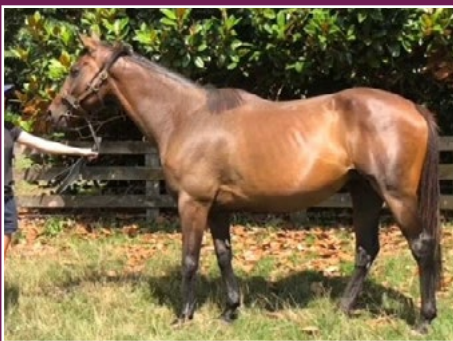
SUCCESSFUL STAKES PRODUCER - O'REILLY MARE IN FOAL TO POWER.