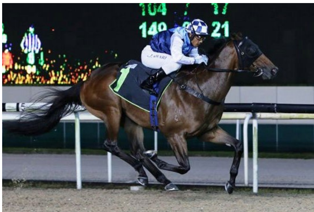
Arc Triumph goes all the way to score his first Kranji win on Friday.

"He was gelded after his last start and has come back more mature and more tractable. He was a lot better,"