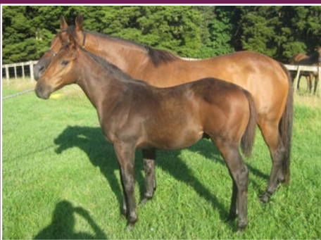
2 IN 1 LOT. WINNING DUBAWI MARE WITH PROISIR COLT AT FOOT.