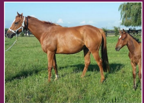
UNRESERVED 3 IN 1 LOT. SHINKO KING MARE WITH NIAGARA FILLY AT FOOT & IN FOAL TO NIAGARA.