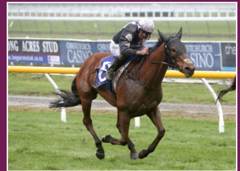
DUAL WINNER, FULL TO MULTIVICTORY - RACE OR BREED.