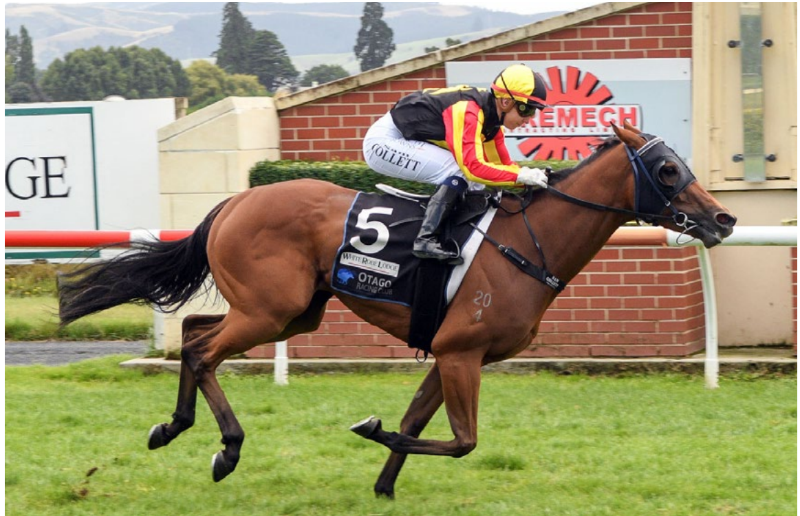
Consecutive Guineas wins go the way of Excelleration after she was successful in the Listed Harcourts Dunedin Guineas

She was widest into the straight and, after coasting to the front 250m