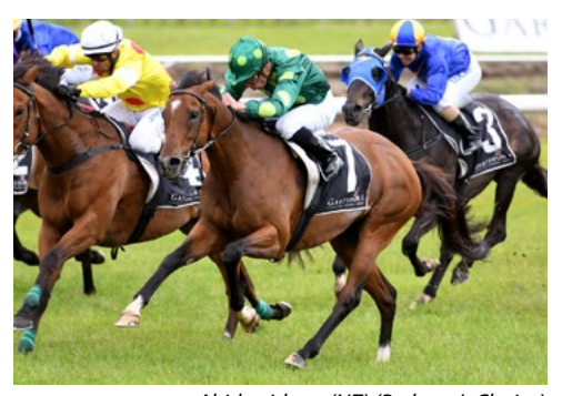
Abidewithme (NZ) (Redoute's Choice)

Abidewithme (NZ) (Redoute's Choice) will make her final race day appearance in the Gr.1 Herbie Dyke Stakes at Te Rapa on February 11.