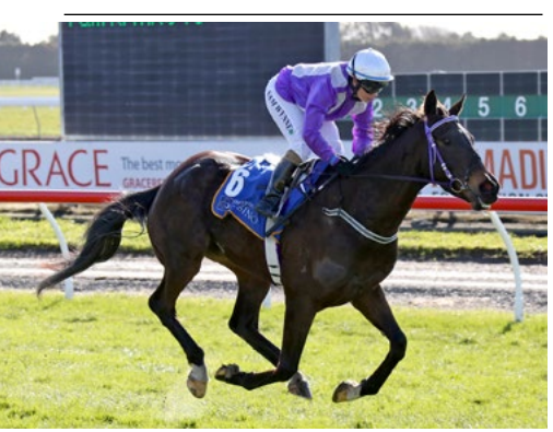
Miss Three Stars (NZ) (Perfectly Ready)

"We've done a lot of work in teaching this horse to settle while keeping in mind the Australian Guineas."