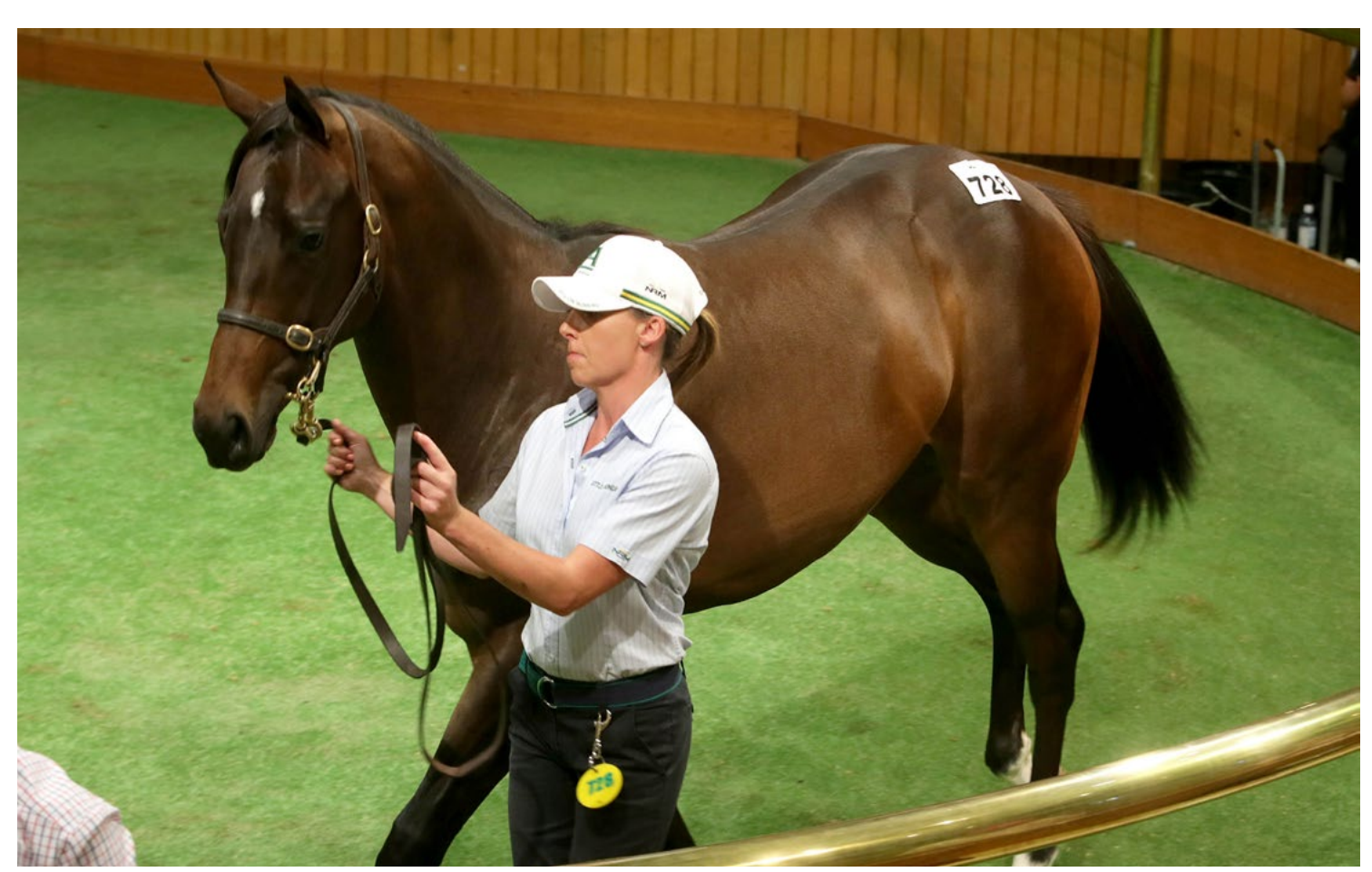
The Per Incanto filly, Lot 728, that topped Day Two of the Select Session at the NZB National Yearling Sale at Karaka

Selling will then break for a day's respite before the Festival Sale runs on Sunday from 11am. Click here to view the Select Sale passed in Lots.