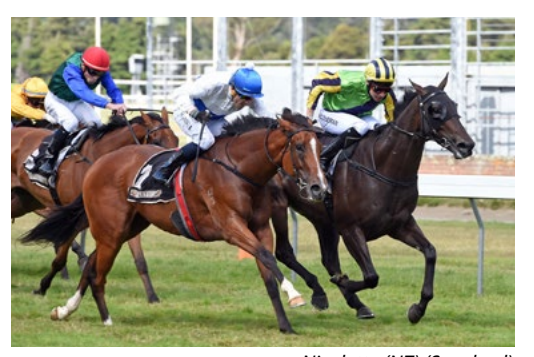
Nicoletta (NZ) (Savabeel)

Meanwhile, barn mate and Gr.1 Victoria Oaks placegetter Eleonora (NZ) (Makfi) had