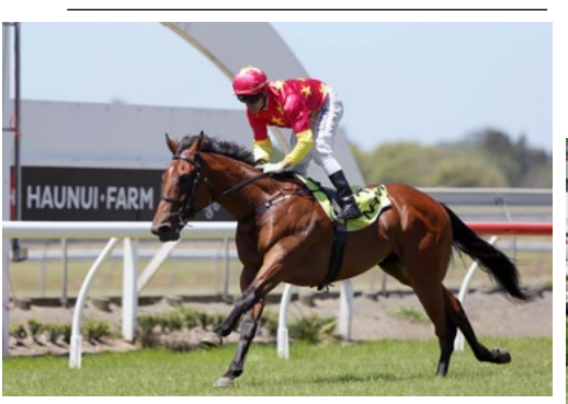
Aim Smart (Smart Missile)

Richard Rutherford's boutique North Canterbury stud Beltana maintained their standing as leading vendor by average (three or more sold) after topping the sale with their full brother to Shamexpress who sold for $825,000 at Lot 10 on the first day of the sale.