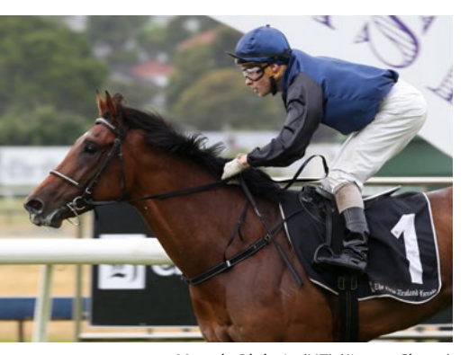
Manolo Blahniq (NZ) (Jimmy Choux)