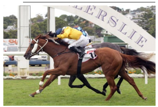
She Brings Joy (NZ) (Sebring)

The Redoute's Choice mare has won nine races, including two at Group Two level and she is also a two-time Group One placegetter.