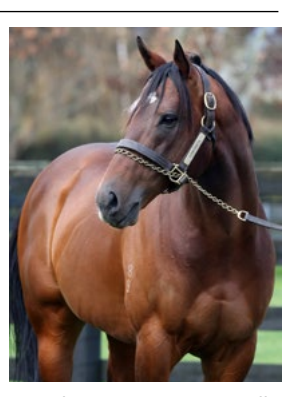
Shamexpress (NZ) (O'Reilly)

Windsor Park Stud weren't lacking confidence in the Group