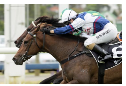
Hasahalo (NZ) (Savabeel)

"We got a bit further back than we wanted when the pace went out of the race."